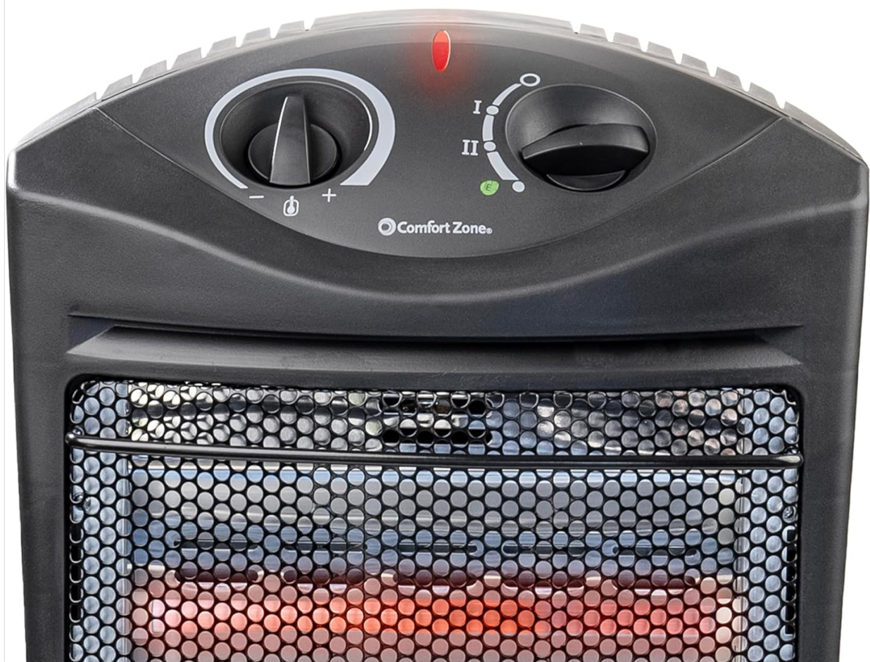
Image: A detailed view of the top-mounted control knobs, including the adjustable thermostat, power mode select, and power indicator light.