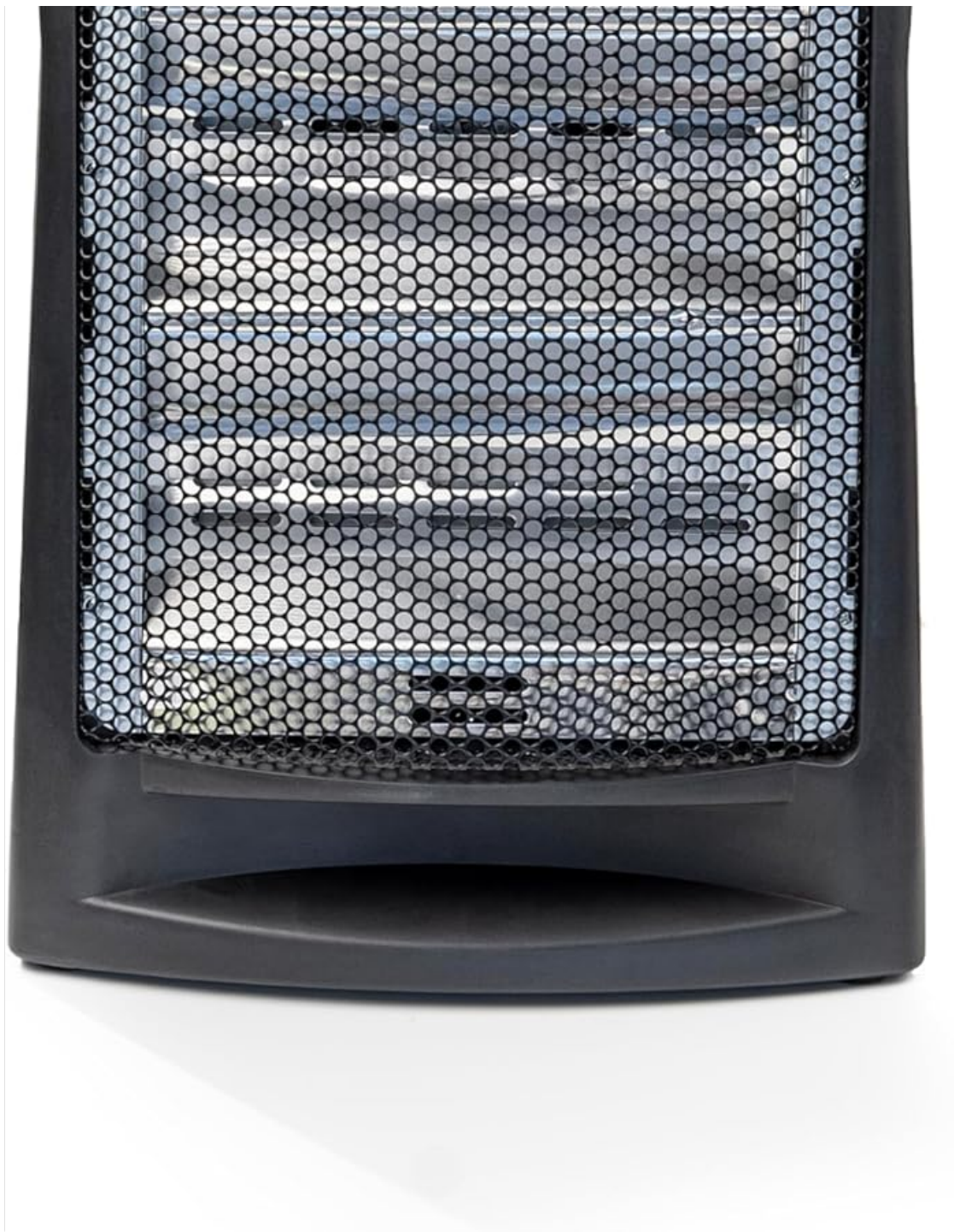
Image: Front view of the Comfort Zone CZQTV008EBK Quartz Tower Space Heater, showcasing its design.