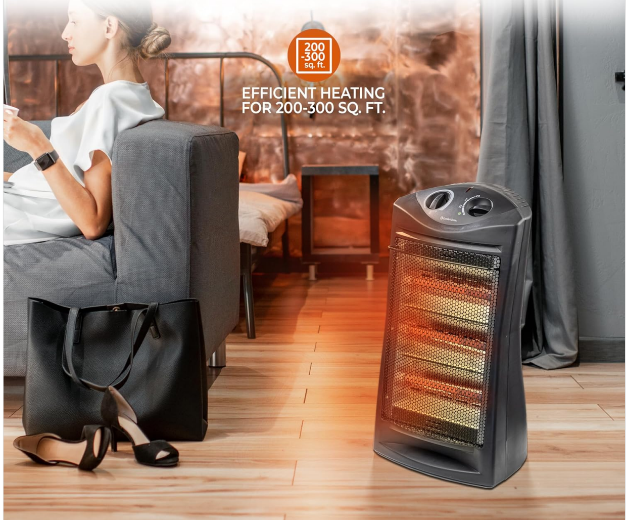
Image: The Comfort Zone CZQTV008EBK heater in operation, illustrating the instant and powerful heat provided by its radiant quartz tubes.