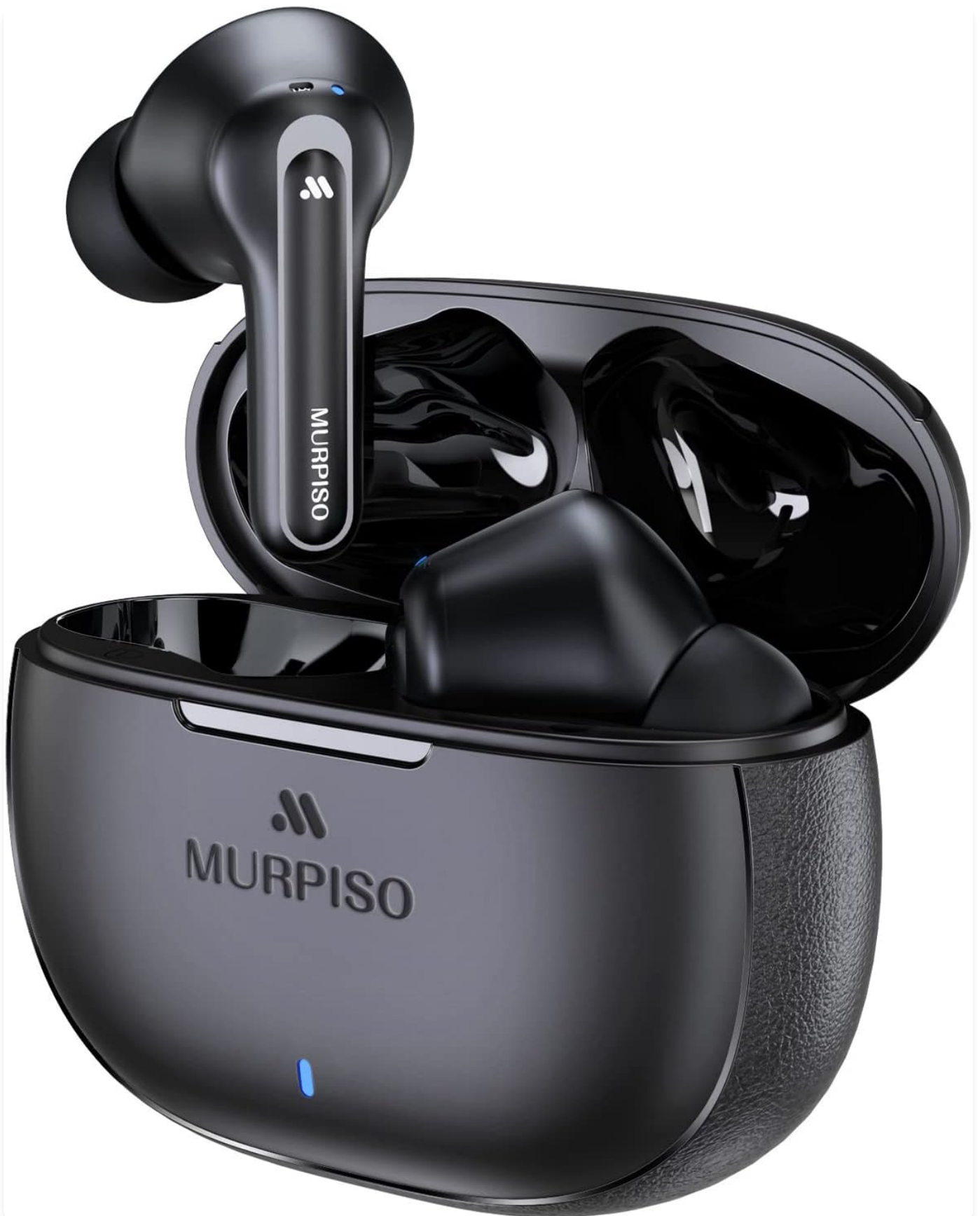
Image: The MURPISO U-Pro2 wireless earbuds resting inside their sleek black charging case, with the lid open, showcasing their compact design.