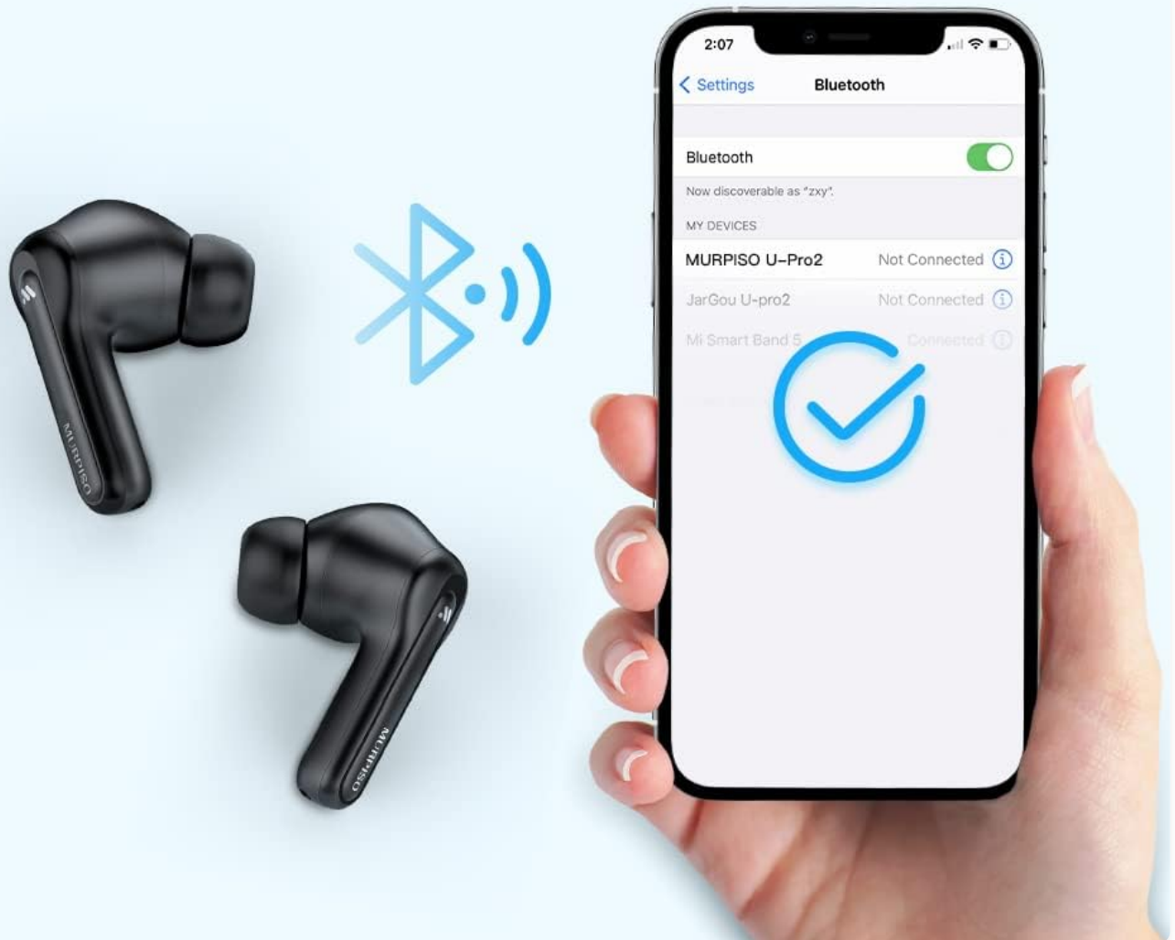
Image: A visual representation of the one-step pairing process, showing the earbuds connecting to a smartphone via Bluetooth, with a checkmark indicating successful connection.