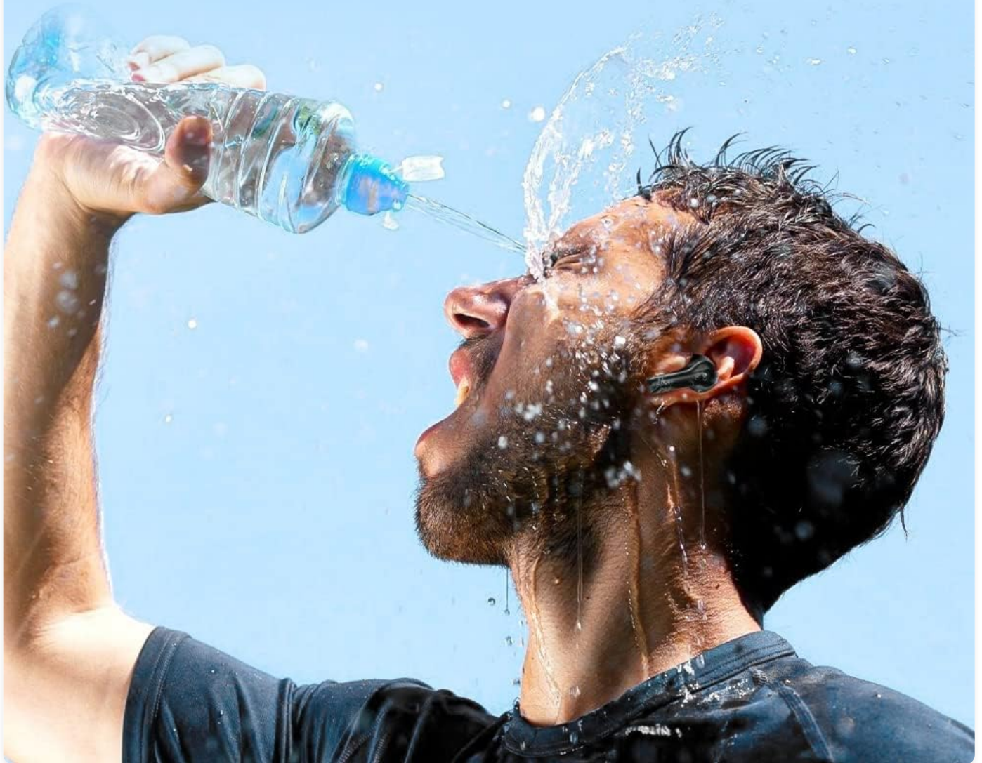
Image: A person pouring water from a bottle onto their face, with the MURPISO earbud visible, illustrating its IPX6 water-resistant and ergonomic design.