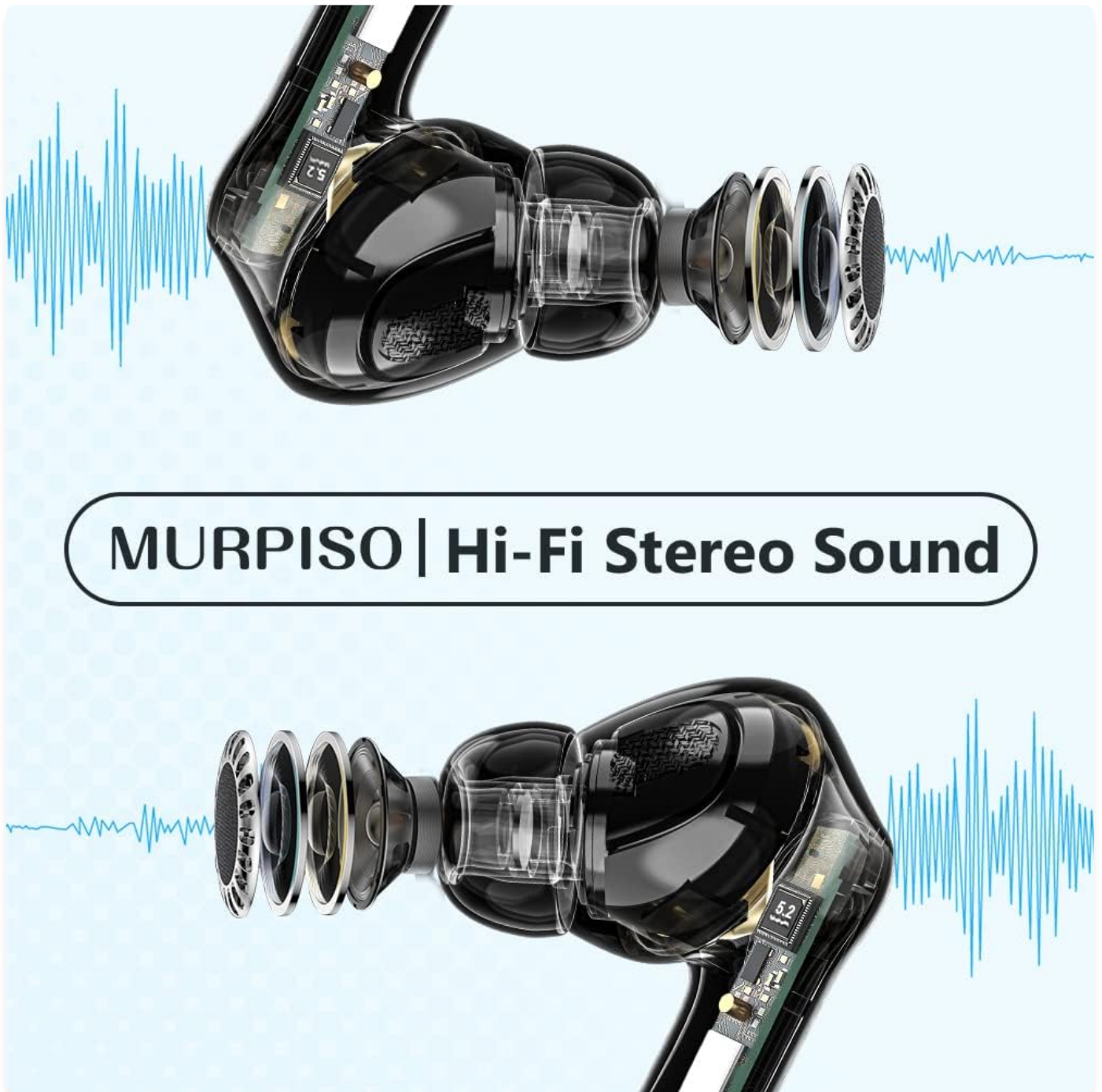
Image: A transparent view of the earbuds, showcasing their internal components and emphasizing the Hi-Fi Stereo Sound technology.