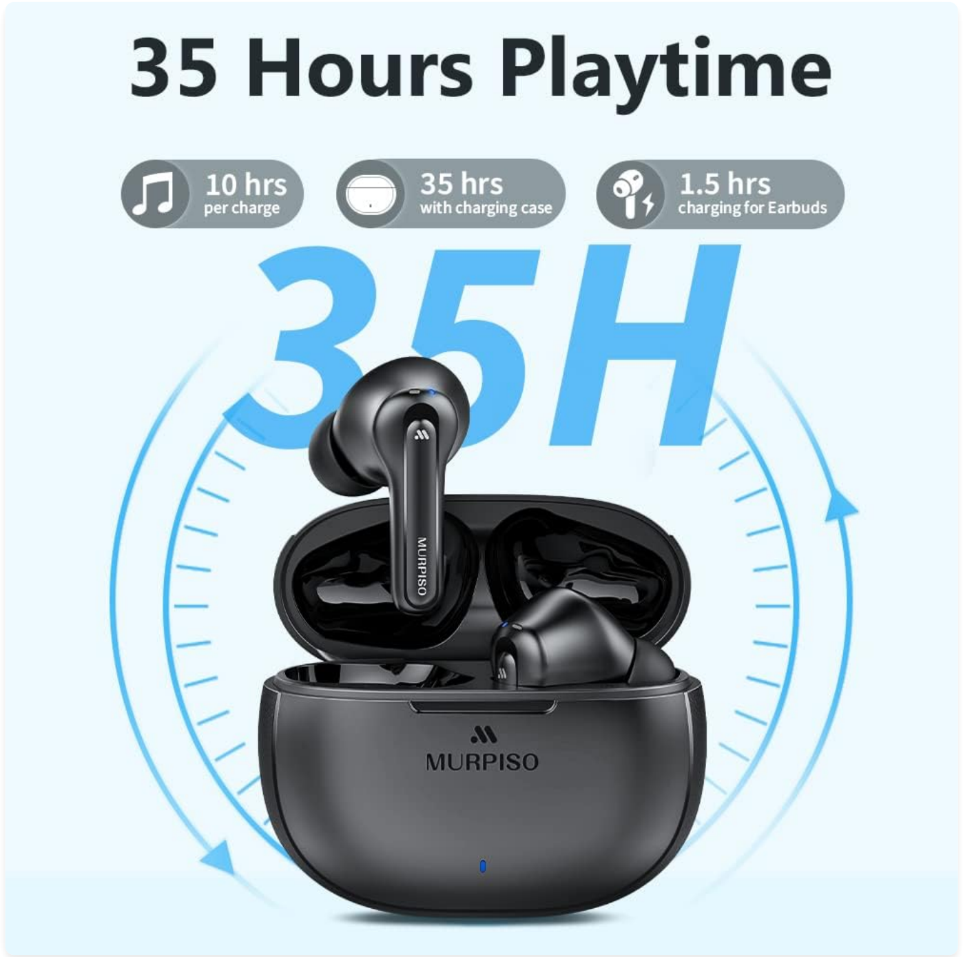
Image: An infographic illustrating the 35-hour total playtime, with 10 hours per charge for the earbuds and 35 hours with the charging case, along with a 1.5-hour charging time for the earbuds.

charge, and the charging case extends this to a total of 35 hours. A full charge for the earbuds takes approximately 1.5 hours.