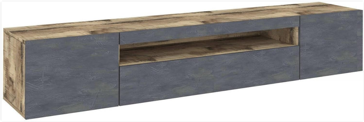
Image: Front view of the Dmora Jesse TV Stand, showcasing its maple and slate finish and minimalist design.