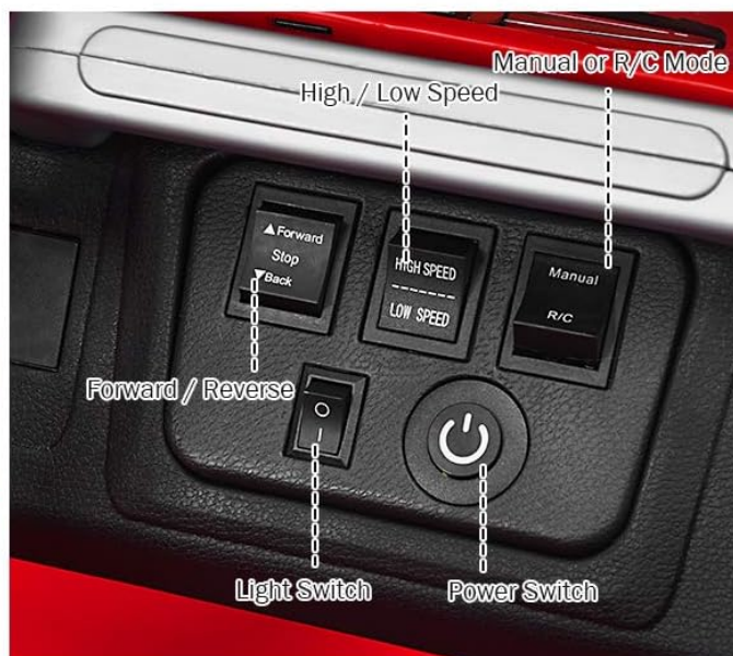
Figure 6: Detailed view of the dashboard, showing power display, USB slot, TF slot, AUX port, music/volume controls, story button, mode button, forward/reverse, high/low speed, manual/R/C switch, light switch, and power switch.