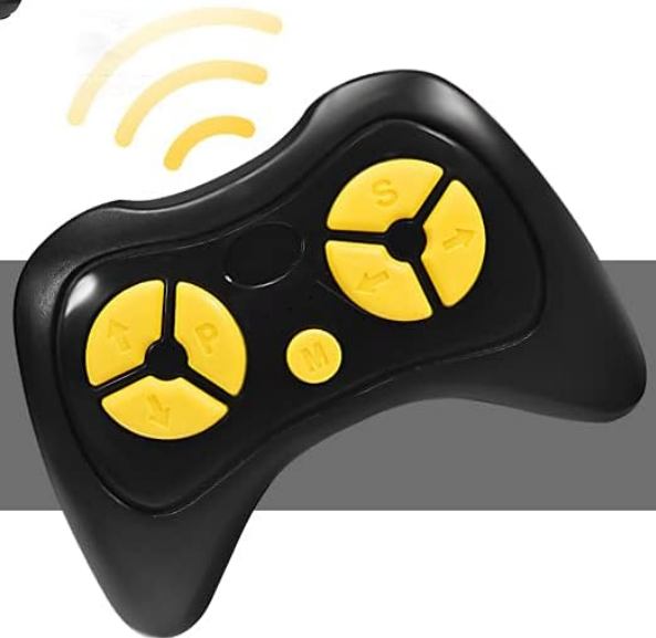
Figure 5: Illustration of the 2.4G remote control and the slow start feature, showing speed progression and control options.

3 Variable speeds in R/C mode 2 Forward & 2 reverse speeds in B/O mode