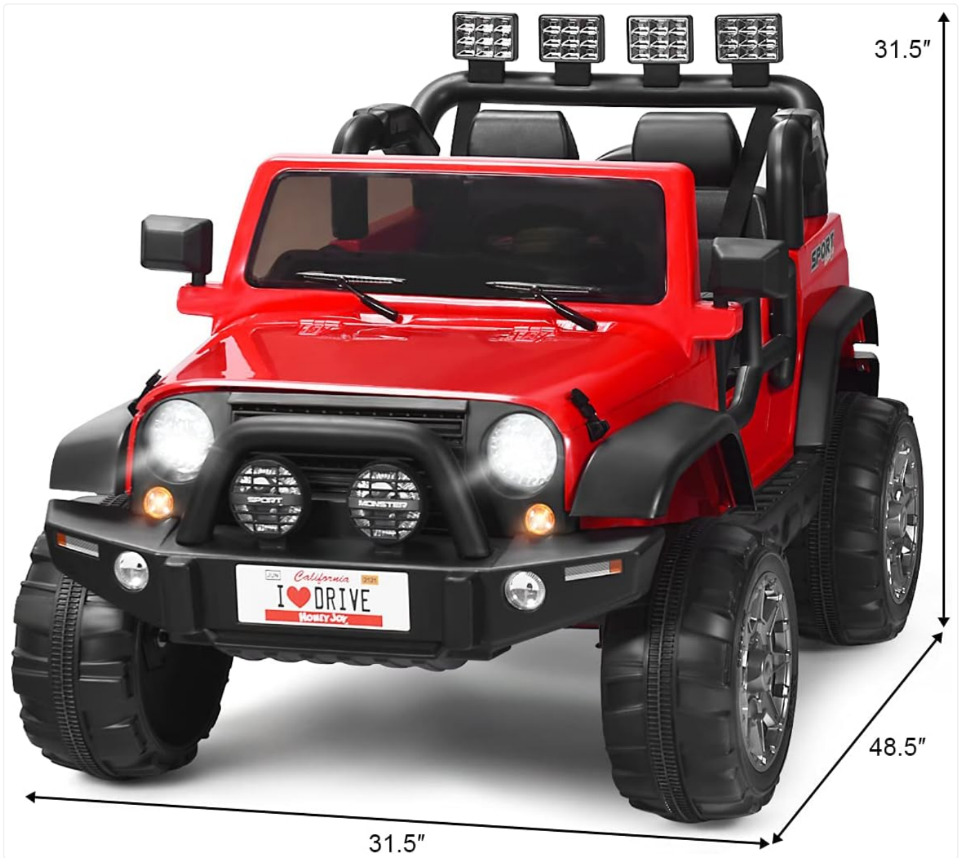
Figure 7: Visual representation of the truck's dimensions: 48.5 inches (length) x 31.5 inches (width) x 31.5 inches (height).