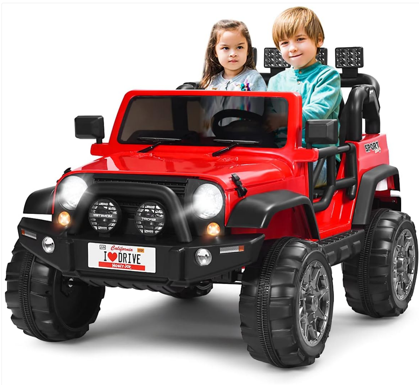
Figure 1: The HONEY JOY 2 Seat Ride On Truck, showcasing its robust design and dual seating capacity.