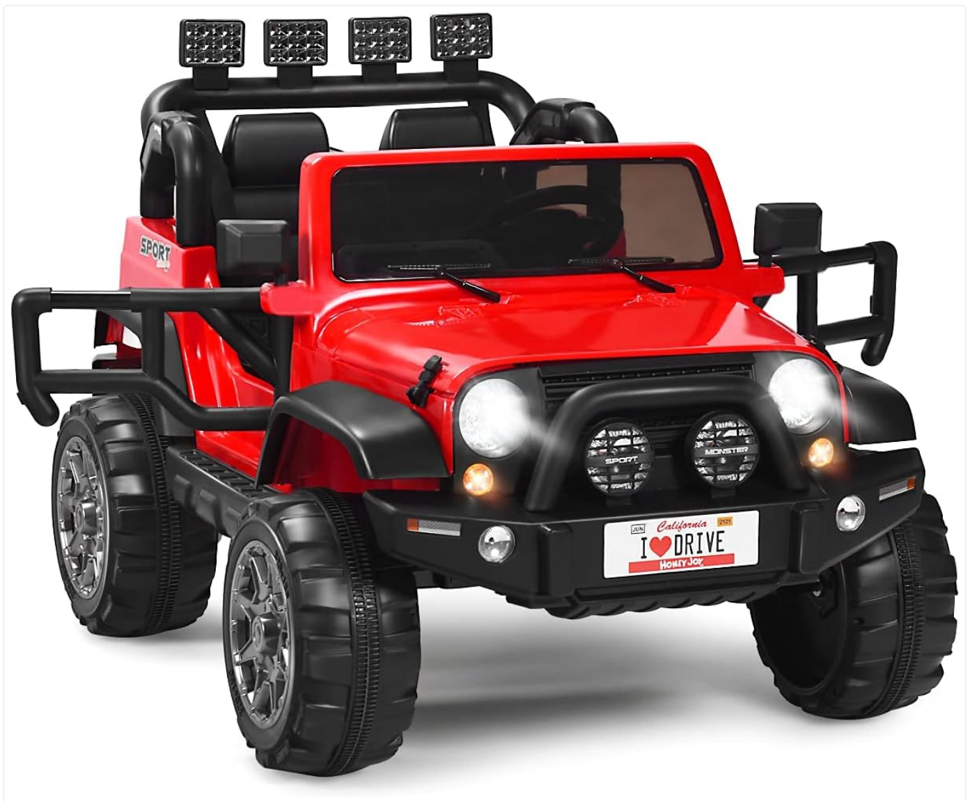
Figure 4: The front engine box can be opened to provide storage for toys or other small items during outdoor rides.