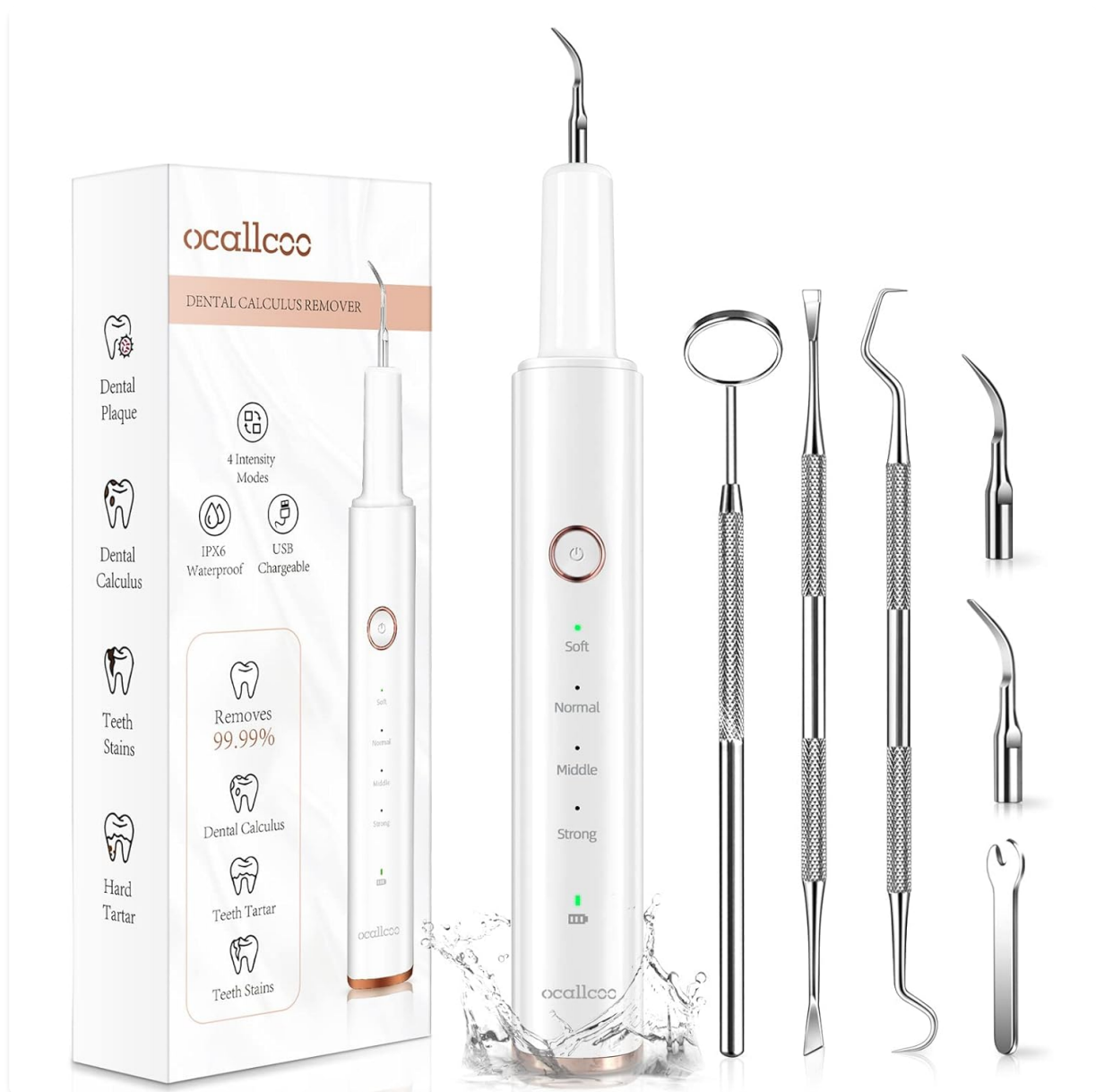
Image 1.1: ocallcoo Electric Tooth Cleaner and Tartar Remover with included accessories.