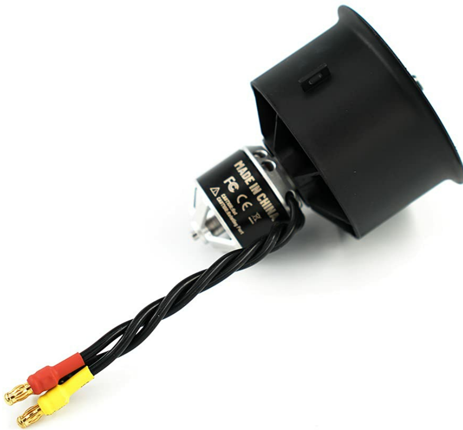
Rear view displaying the brushless motor and power connectors.