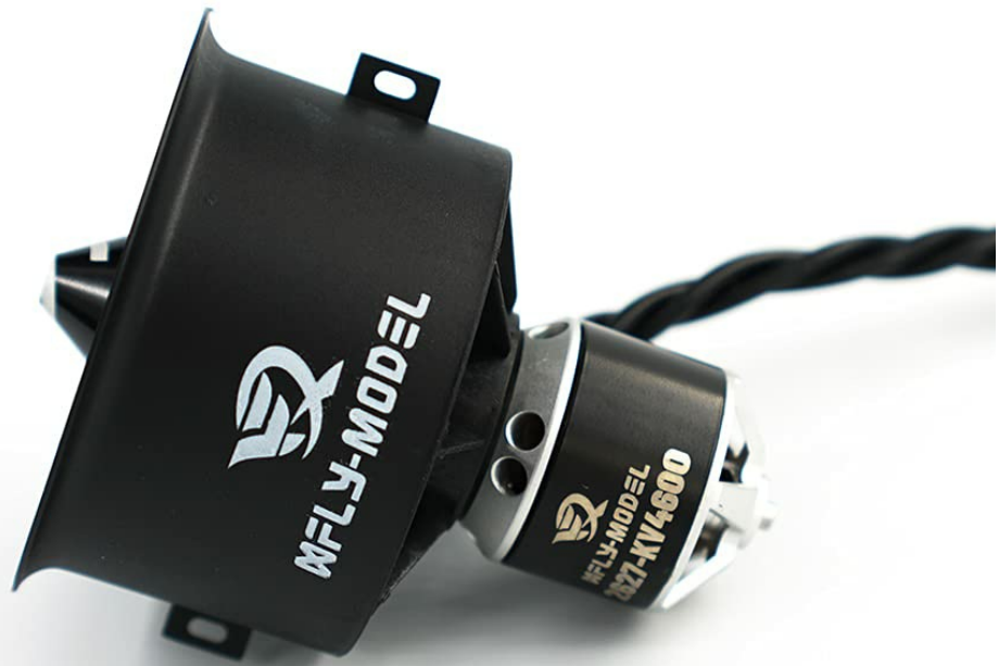
Complete 50mm EDF Ducted Fan assembly with motor and wiring.