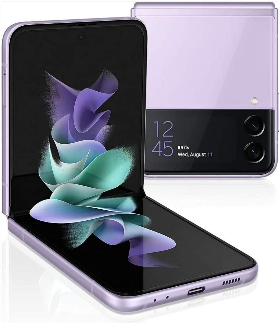
Figure 1: Samsung Galaxy Z Flip 3 5G in Lavender color, folded, showcasing its compact design.