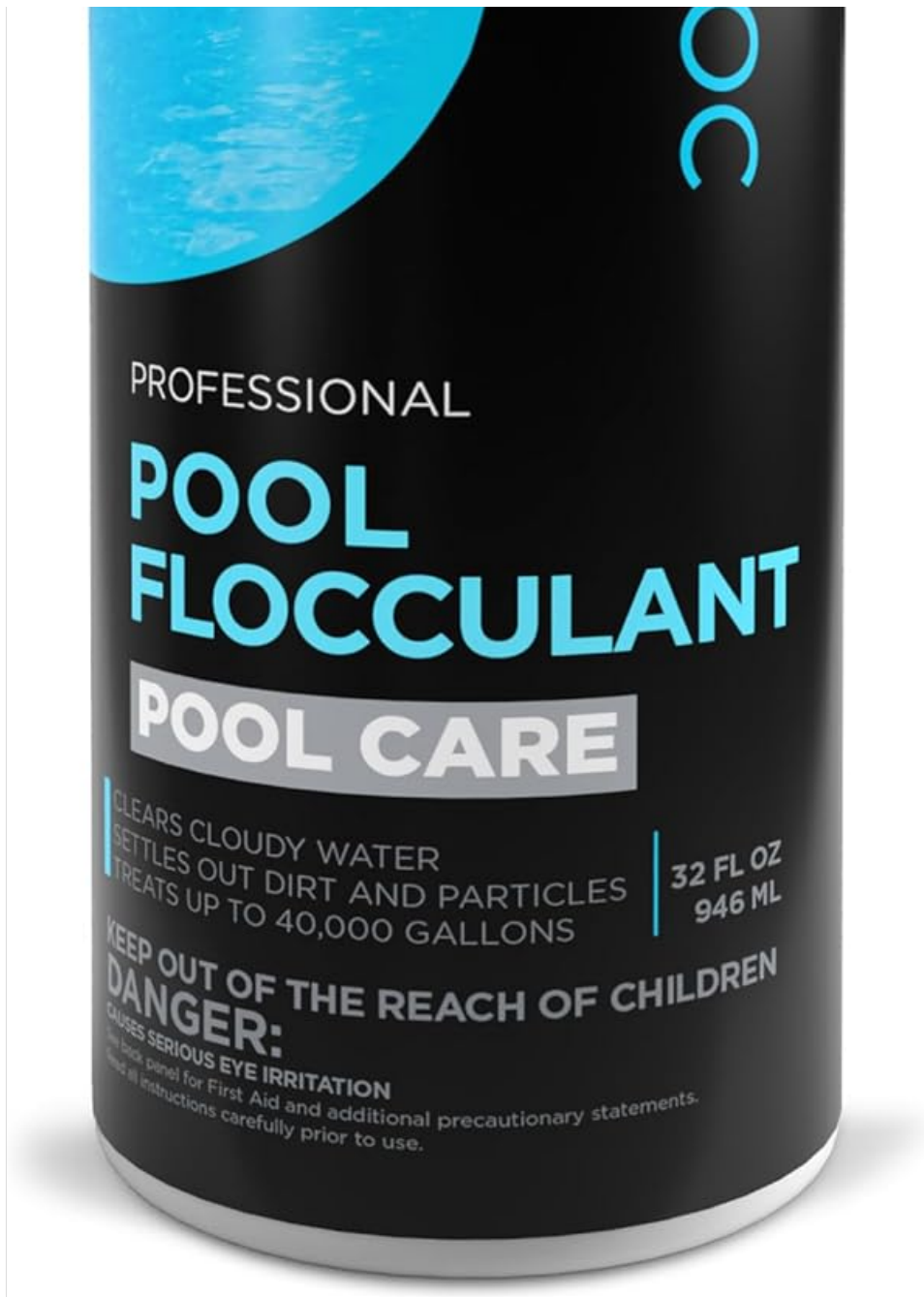
Image: MAV AquaDoc Pool Flocculant 32oz bottle, clearly showing the product label and branding.