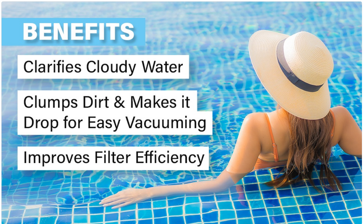
Image: A person enjoying a clear pool, visually representing the benefits of using the flocculant, such as clarified water and improved filter efficiency.