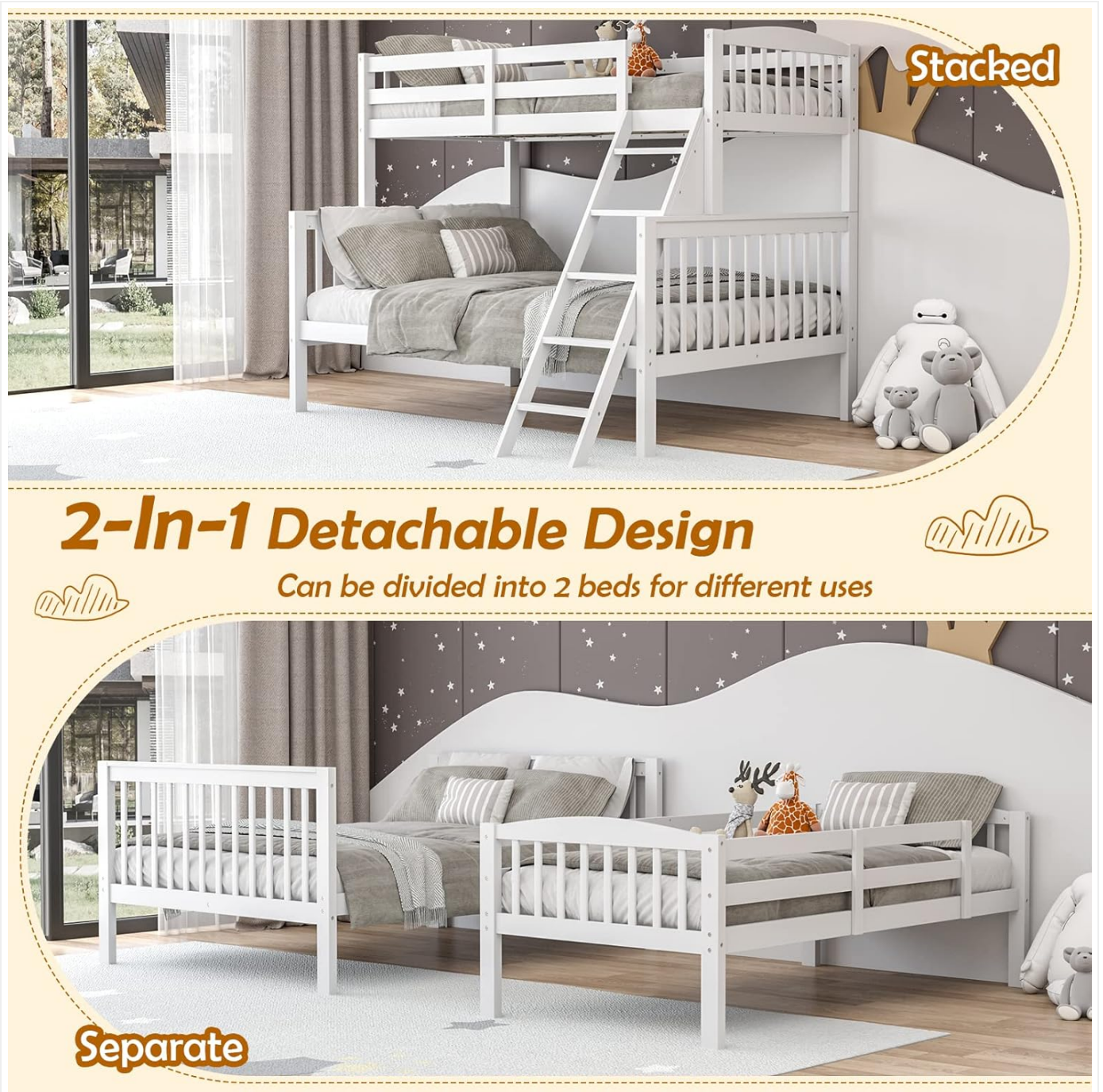
Figure 2: 2-in-1 Detachable Design, illustrating the bunk bed's ability to convert into two separate beds.