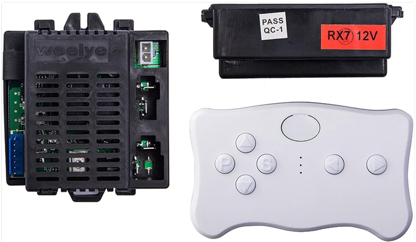
Image: Overview of the weelye RX7 12V control box (top) and the accompanying 2.4G Bluetooth remote control (bottom).