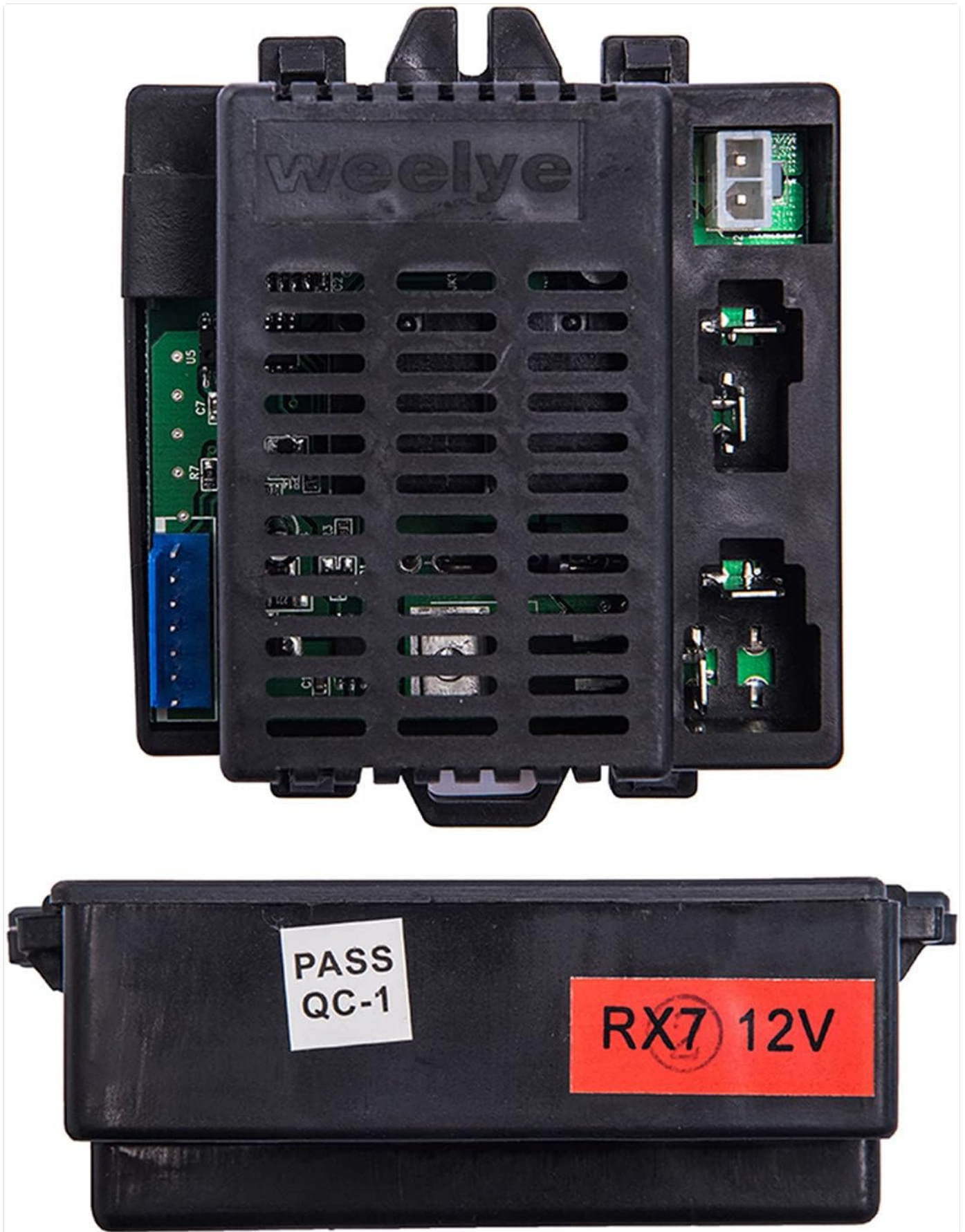
Image: Top and side view of the weelye RX7 12V control box, showing the "RX7 12V" label for identification.