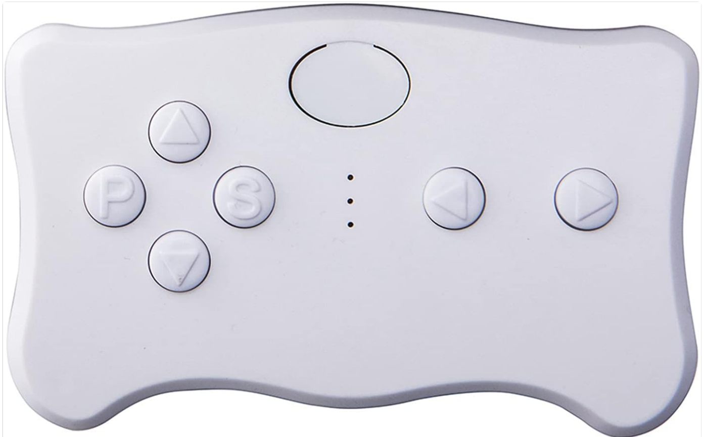
Image: Front view of the weelye RX7 remote control, showing its buttons.

The remote control allows for wireless operation of the ride-on car. It features buttons for movement, speed, and emergency braking.