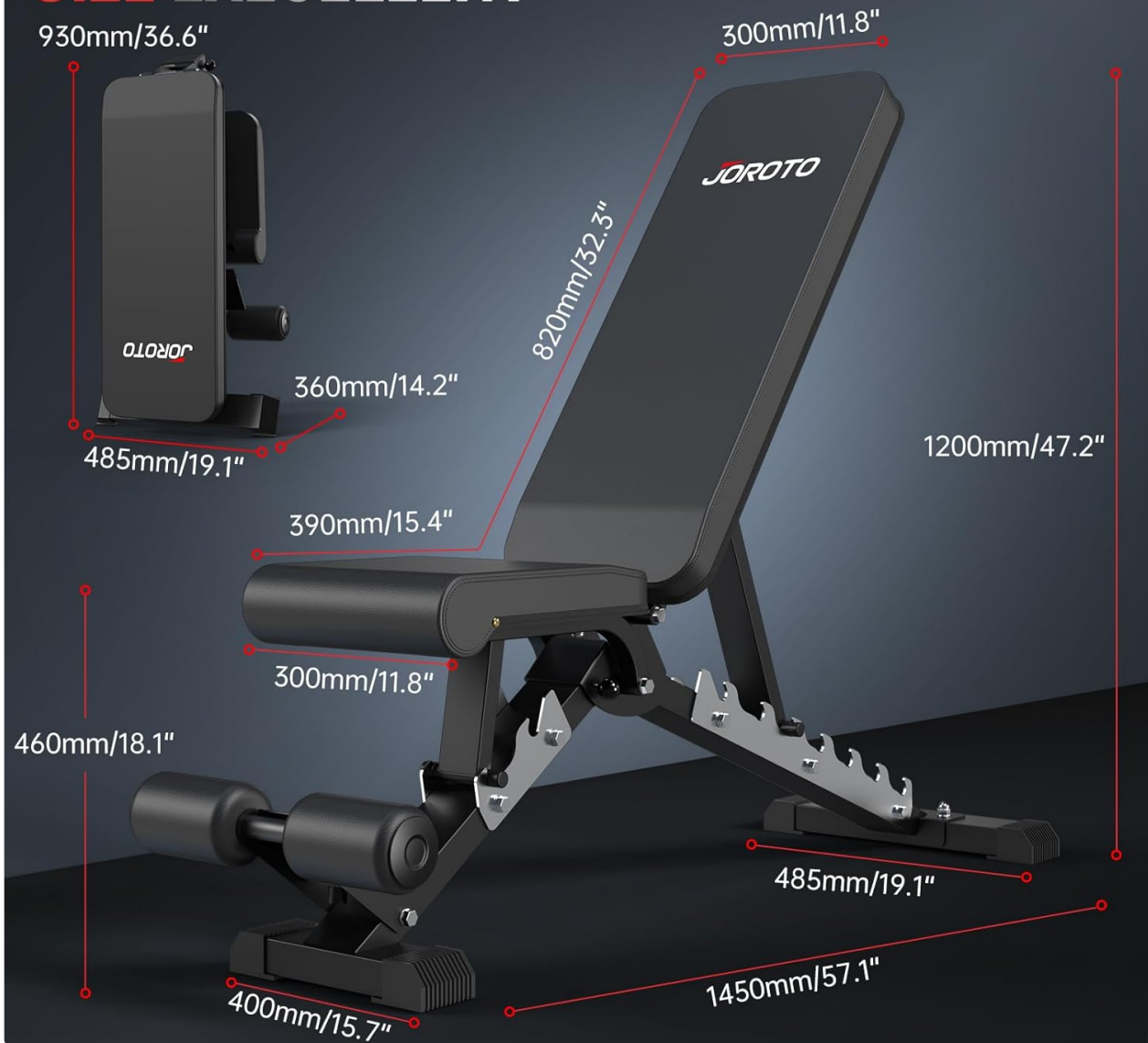
Image: A detailed diagram of the JOROTO MD60 weight bench showing its various dimensions in millimeters and inches, including length, width, and height of different sections.