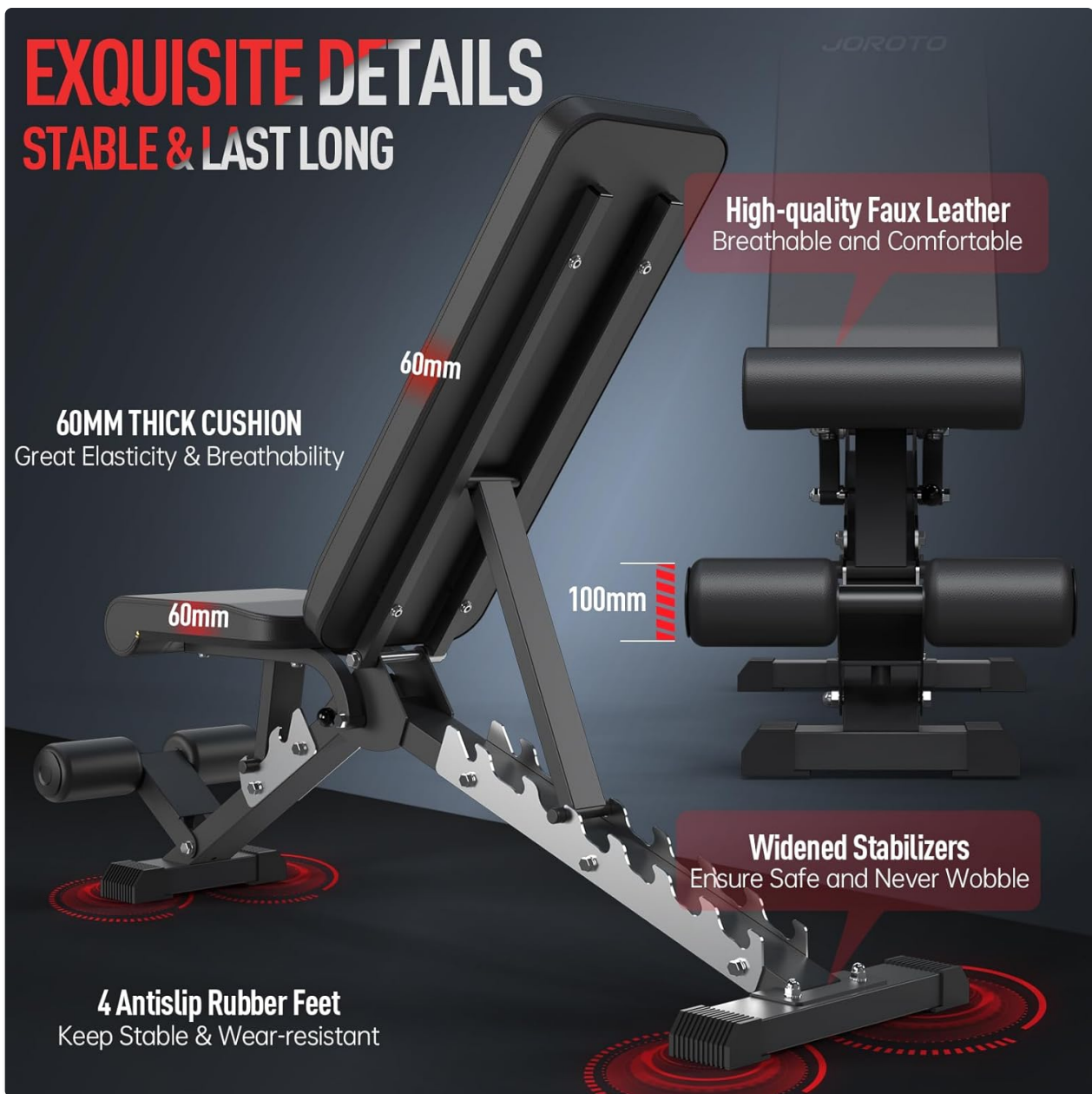
Image: Close-up of the JOROTO MD60 bench highlighting the 60mm thick cushion, high-quality faux leather, 4 anti-slip rubber feet, and widened stabilizers for enhanced safety and stability.