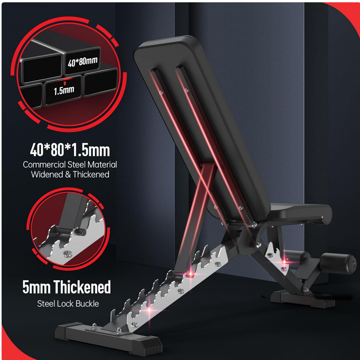
Image: Detailed view of the JOROTO MD60 bench's commercial-grade steel frame (40x80x1.5mm) and the 5mm thickened steel lock buckle, ensuring structural integrity.