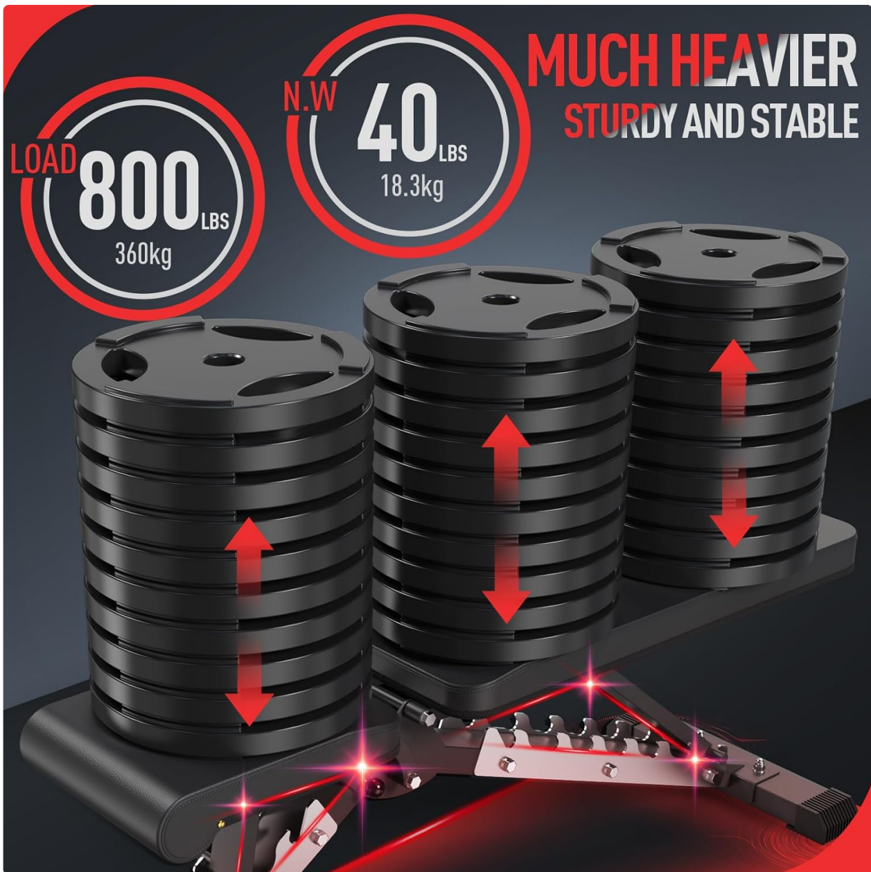
Image: The JOROTO MD60 weight bench highlighting its 800 lbs (360 kg) load capacity and 40 lbs (18.3 kg) net weight, indicating its sturdy construction.