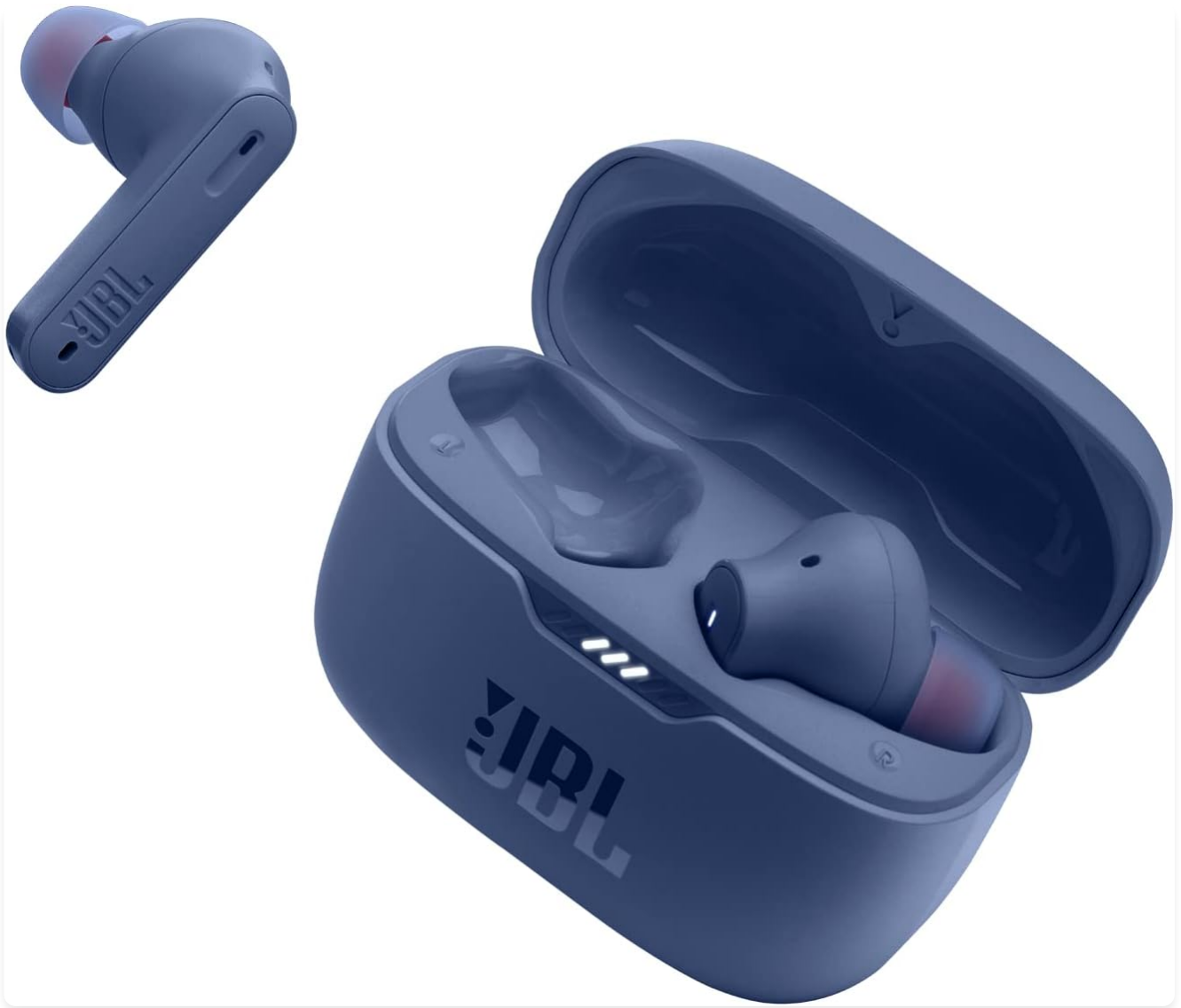
Image: JBL Tune 230NC TWS earbuds and their charging case, showcasing the sleek blue design.