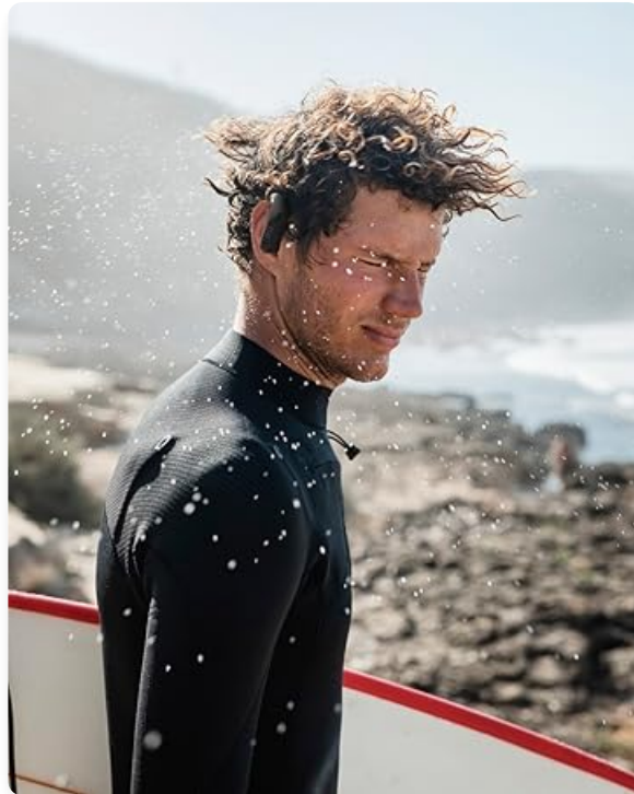
Image: A man with wet hair and face, indicating the earbuds' resistance to sweat and splashes during activities.

The JBL Tune 230NC TWS headphones are IPX4 water resistant and sweatproof, making them suitable for workouts and various weather conditions. While resistant to splashes and sweat, they are not designed for submersion.