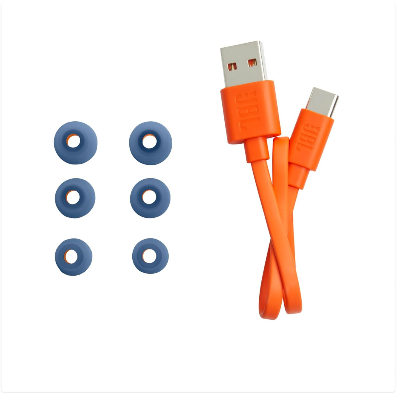
Image: A selection of different sized ear tips and the orange USB-C charging cable included with the JBL Tune 230NC TWS.