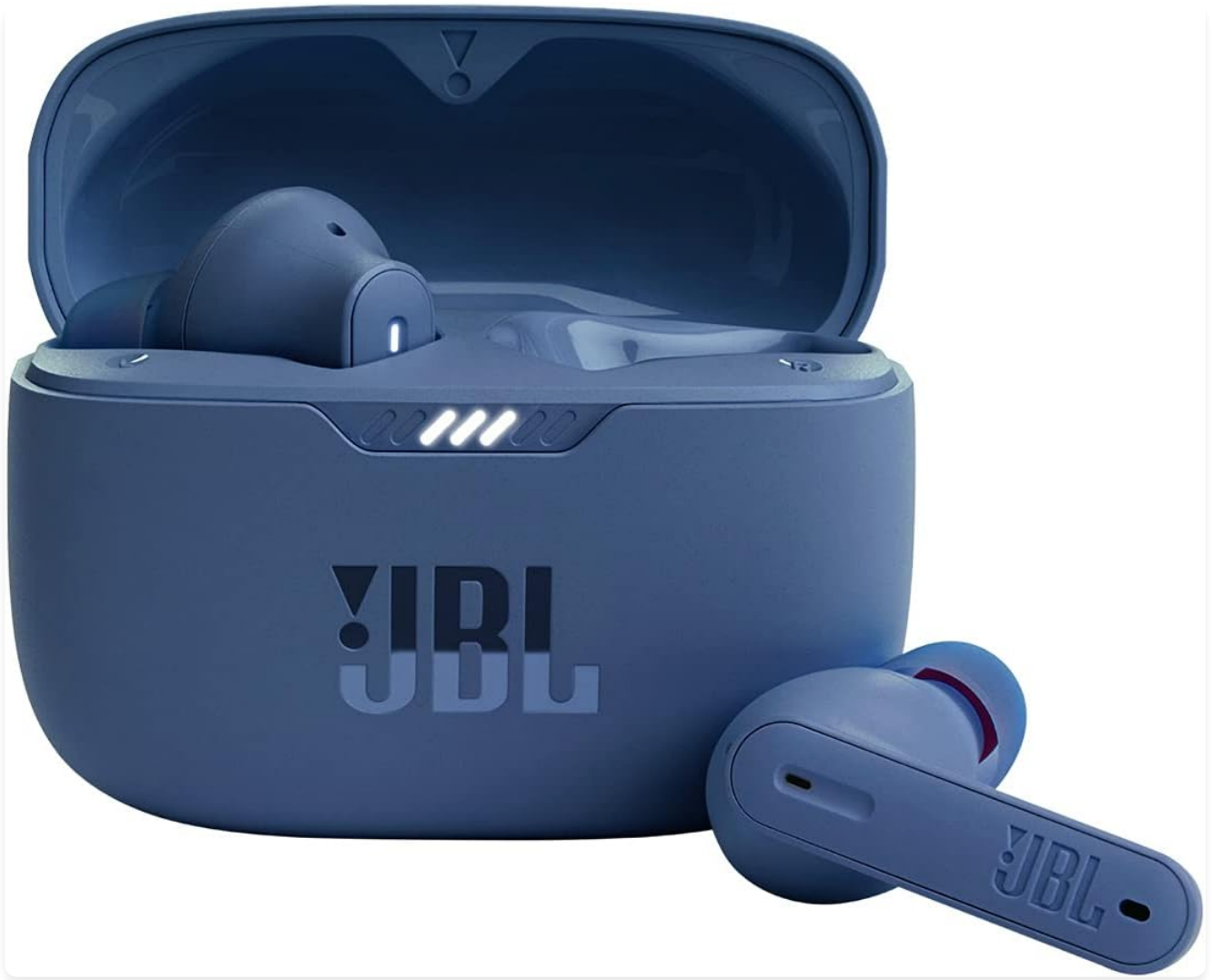
Image: The JBL Tune 230NC TWS earbuds resting in their open charging case, with visible charging indicator lights.