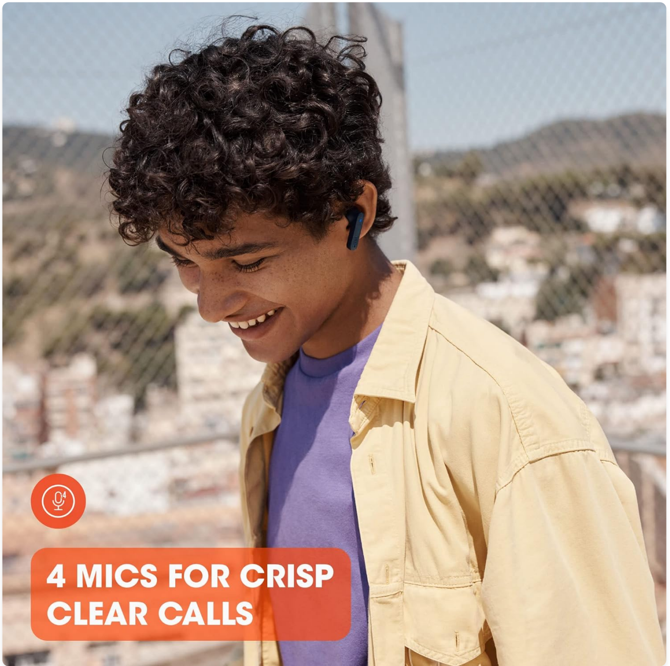
Image: A person smiling while wearing the earbuds, highlighting the clear call quality provided by the four integrated microphones.