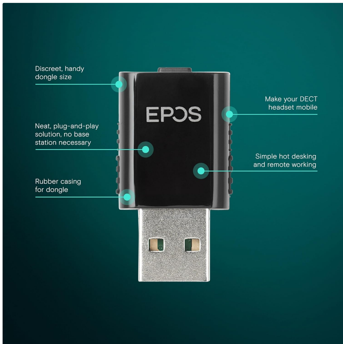
Image: A close-up view of the EPOS IMPACT SDW D1 USB Audio Receiver, with visual callouts pointing to its discreet size, plug-and-play nature, rubber casing, and its ability to make DECT headsets mobile for hot-desking and remote work.