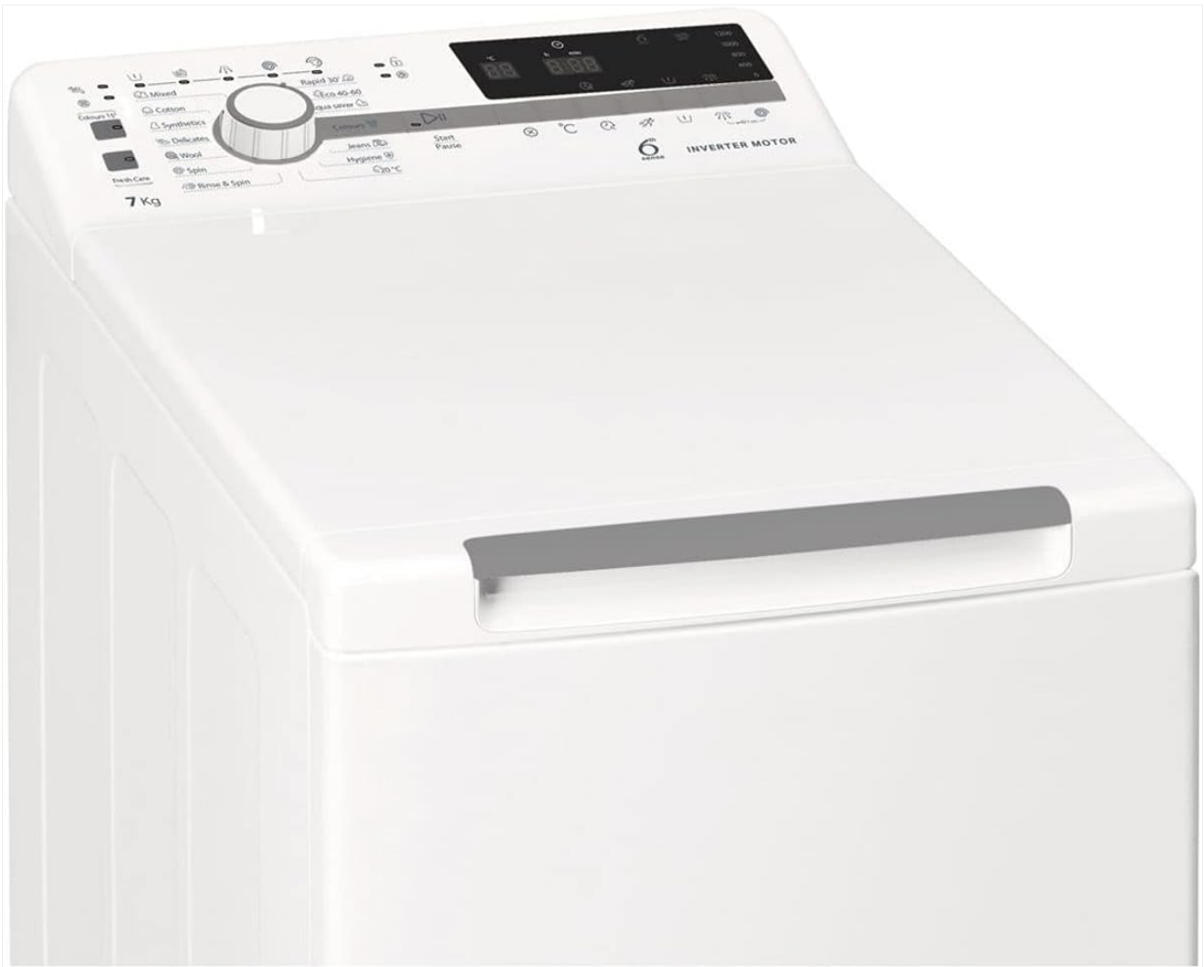
Figure 2: Close-up of the control panel. This image details the program selector knob, LED display, and various function buttons for cycle options like 'Colours 15', 'Mixed', 'Cotton', 'Synthetics', 'Delicates', 'Wool', 'Spin', 'Rinse & Spin', 'Jeans', 'Hygiene', 'Rapid 30', 'Eco 40-60', 'Aqua Saver', and 'Intensive/Outdoor'.