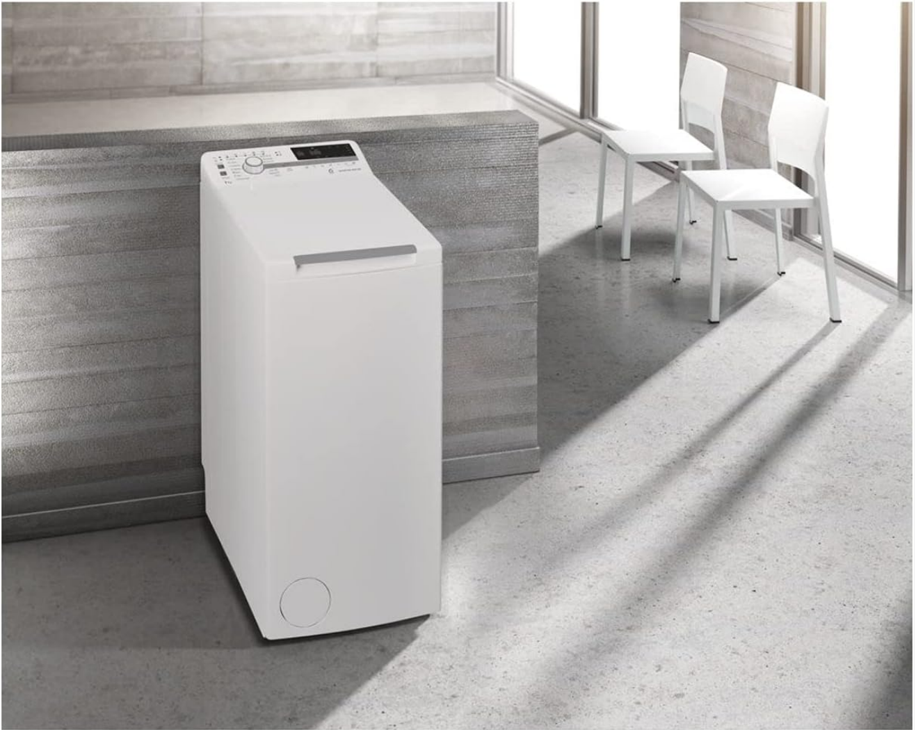
Figure 1: Full view of the Whirlpool TDLR 7221BS EU/N Top-Loading Washing Machine. This image shows the appliance in a modern laundry setting, highlighting its compact, freestanding design and white finish.

The Whirlpool TDLR 7221BS EU/N is a top-loading washing machine designed for efficient and convenient laundry care. It features a 7 kg capacity and a maximum spin speed of 1200 RPM. The control panel includes an LED display and intuitive button input for program selection and settings adjustment.