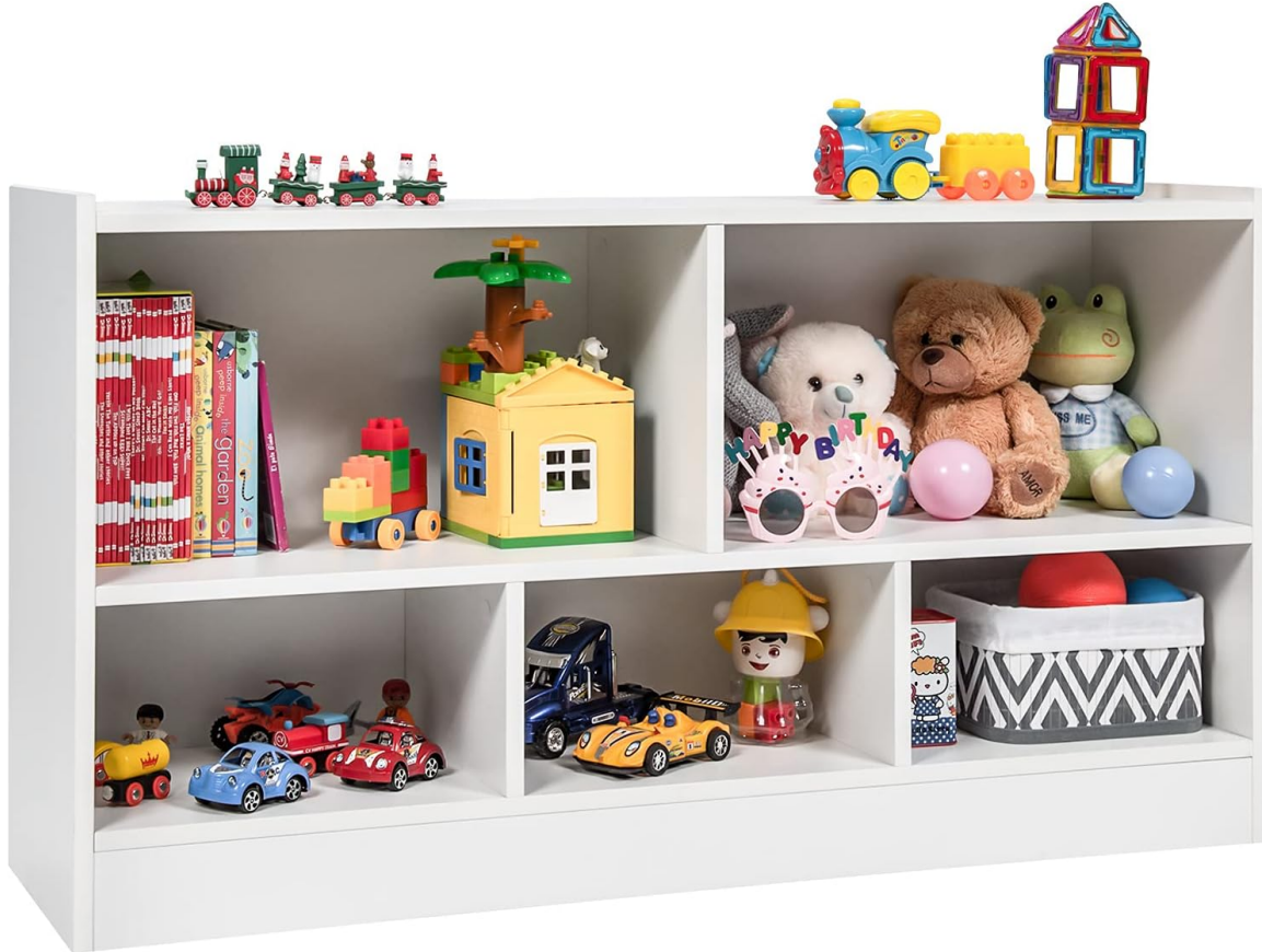
Figure 1: The Costzon Toy Storage Organizer in a typical playroom setting.