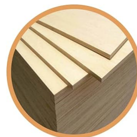
Thick & Odorless Boards