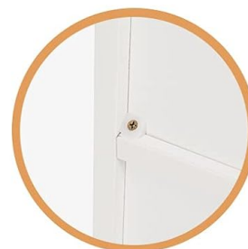
Reinforced Back Buckles