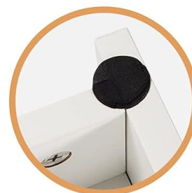
Non-slip Foot Pads