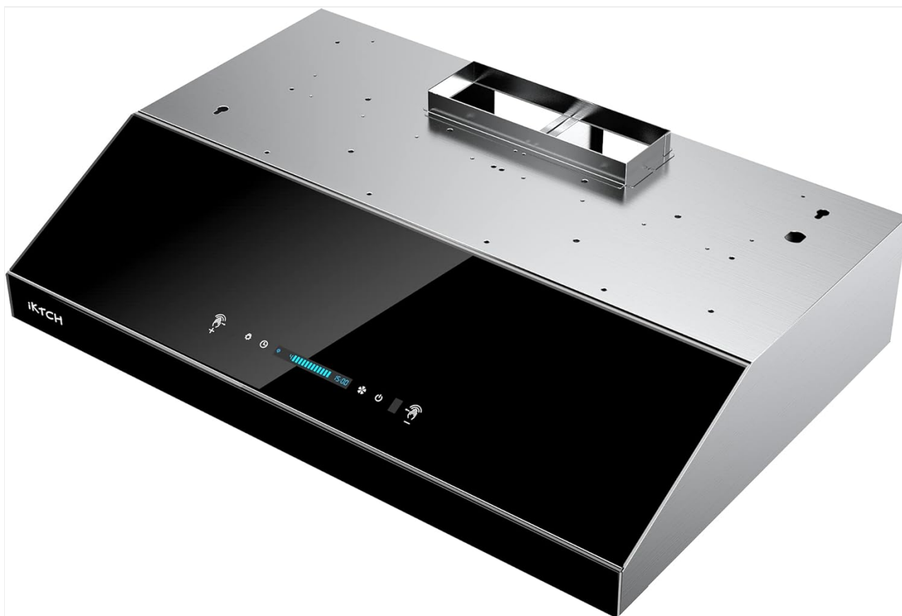
Figure 1: Front view of the IKTCH 30-inch Under Cabinet Range Hood.

This instruction manual provides detailed information for the safe and efficient operation of your IKTCH 30-inch Under Cabinet Range Hood, model IKC02-30B. Please read this manual thoroughly before installation and use, and retain it for future reference.