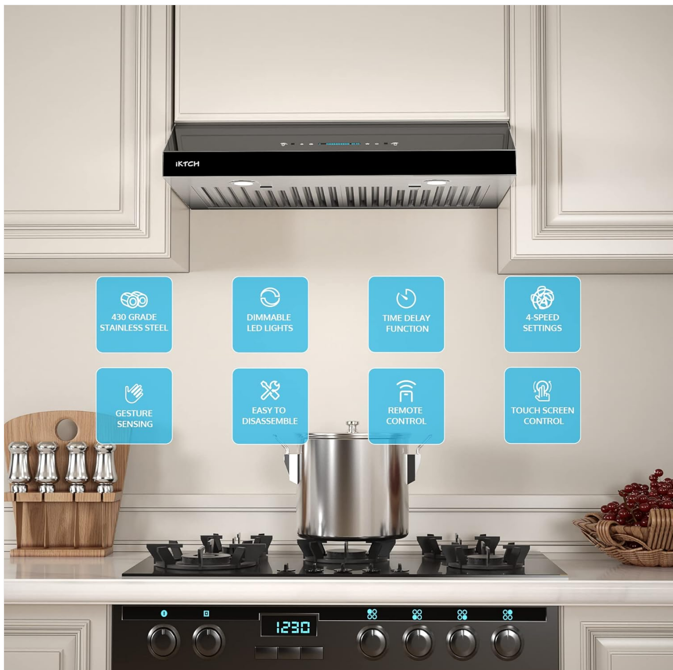
Figure 2: Overview of the control options including gesture sensing, touch, and remote control.