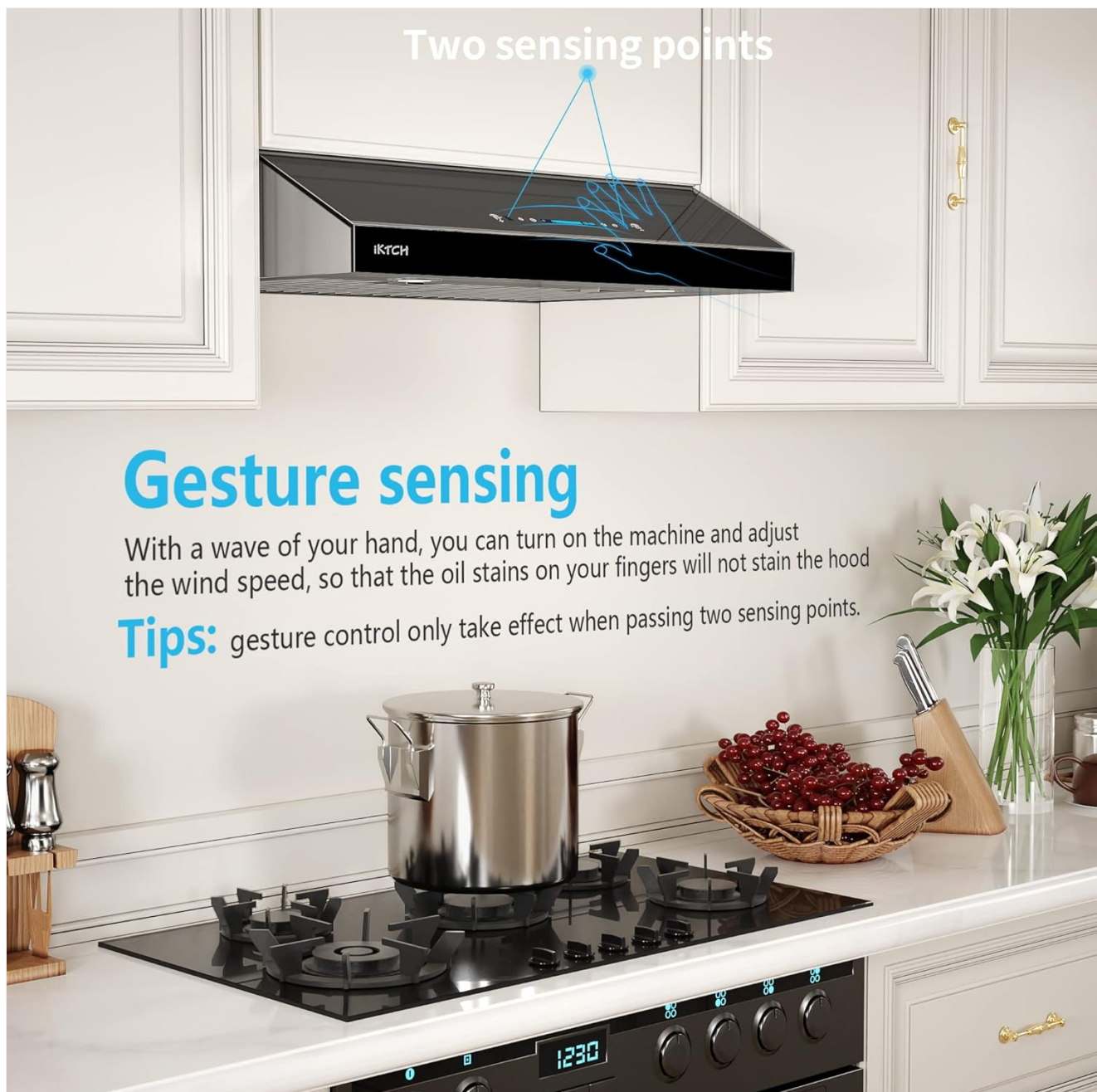
Figure 6: Illustration of gesture sensing for controlling fan speed without physical contact.