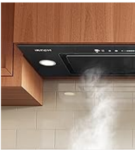
Figure 7: Detachable and washable baffle filter for easy maintenance.