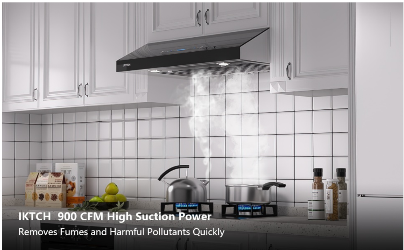
Figure 3: Visual representation of the 900 CFM airflow capacity effectively removing smoke.