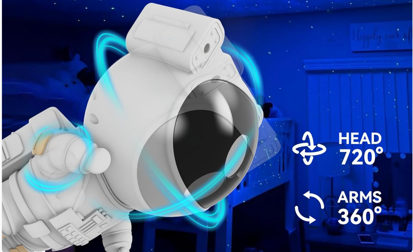
Image 4.2: The astronaut's head and arms can be adjusted for optimal projection.

Astronaut space projector head, arms are adjustable, the base can also be removed