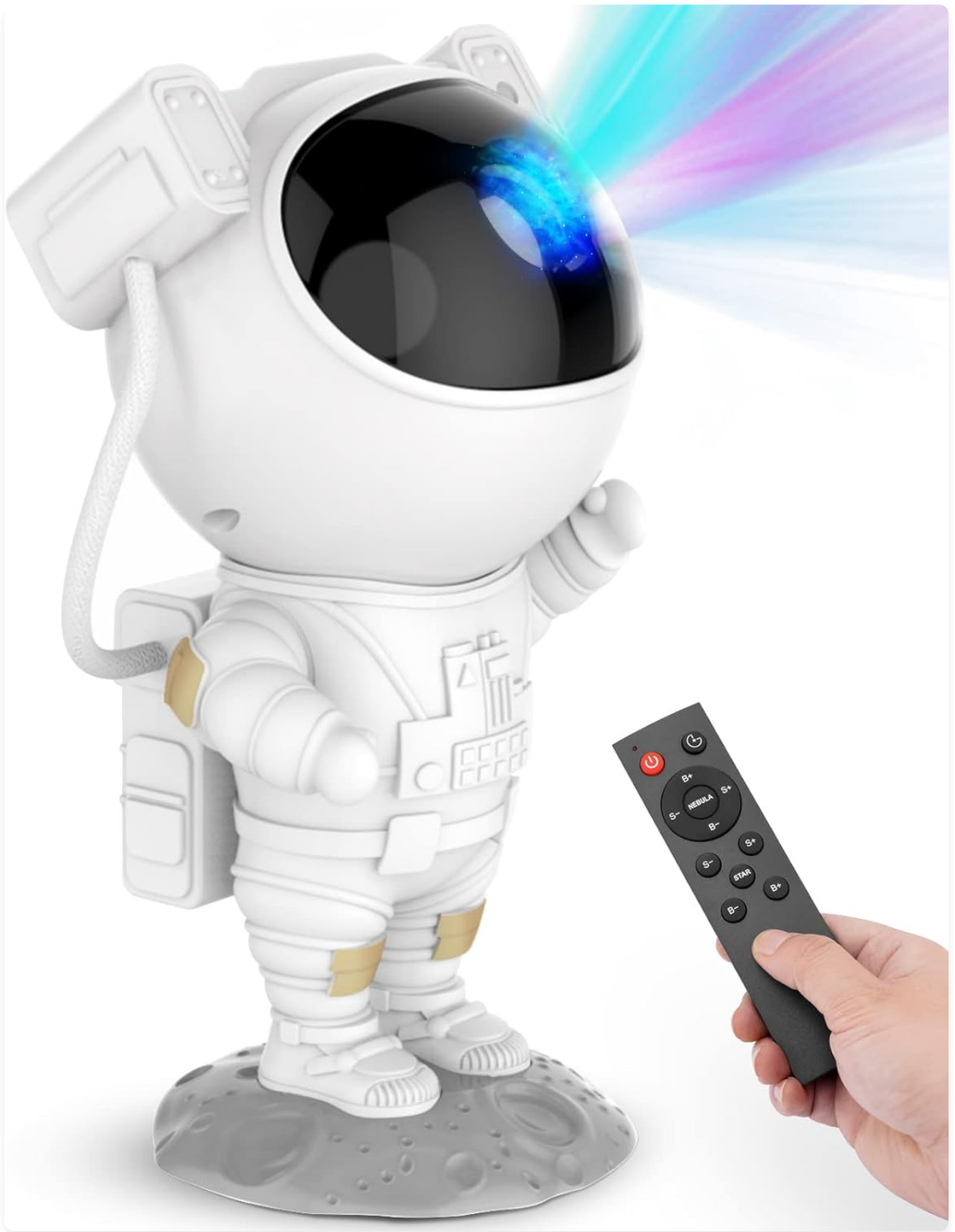
Image 1.1: The Mooyran Astronaut Star Projector and its remote control.