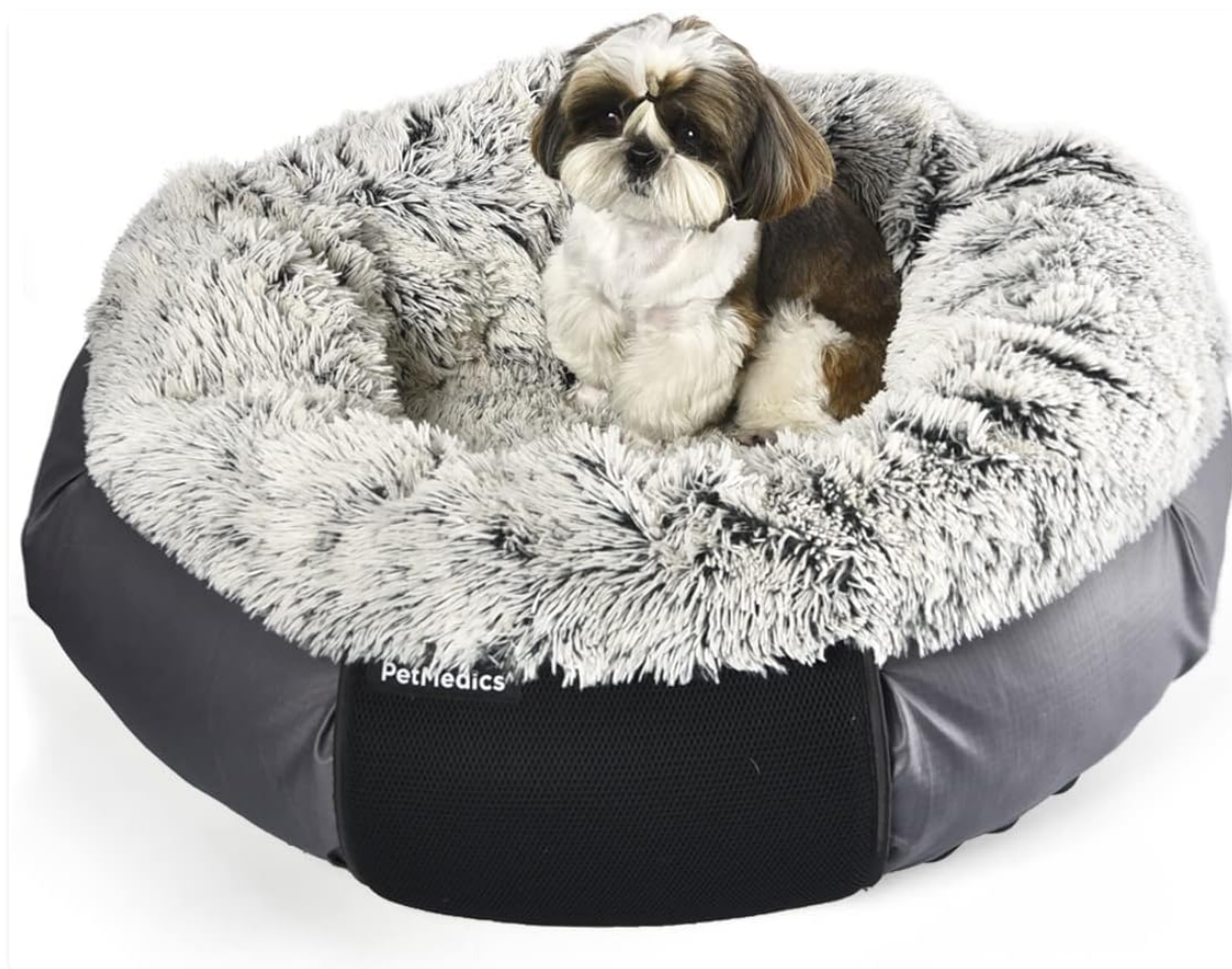
Image: The PetMedics Calming Orthopedic Donut Dog Bed, shown with a small dog comfortably resting inside. The bed features a plush, fluffy interior and a durable grey exterior with a black mesh pocket.

Thank you for choosing the PetMedics Calming Orthopedic Donut Washable Bolster Dog Bed. This manual provides essential information for the proper setup, operation, maintenance, and care of your new pet bed. Designed for comfort and durability, this bed aims to provide a secure and soothing resting place for your small to medium-sized dog or cat.