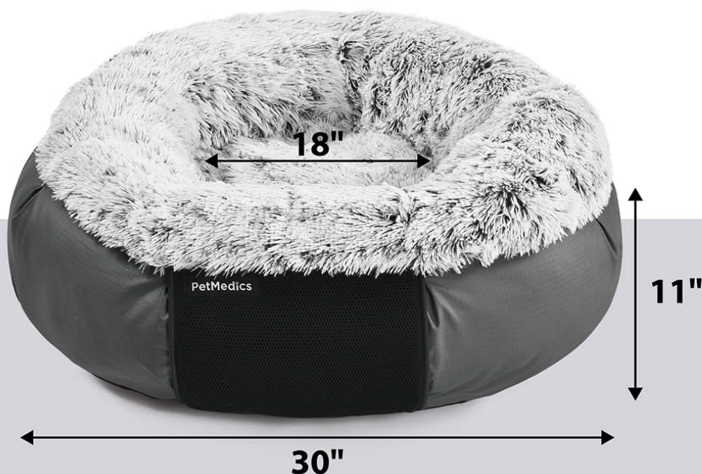
Image: A visual representation of the PetMedics dog bed's dimensions, indicating a 30"L x 30"W x 11"H overall size and an 18" sleeping surface, suitable for small to medium dogs up to 50 lbs.