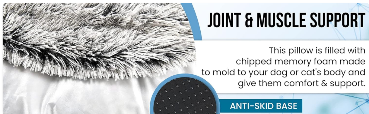
Image: A detailed view of the bed's plush faux fur surface and the anti-skid base, emphasizing its orthopedic benefits for joint and muscle support.

Image: An infographic illustrating the key features of the PetMedics dog bed, including memory foam, dog-tough construction, reversible pillow, machine washable cover, water-resistant liner, and a durable mesh pocket.