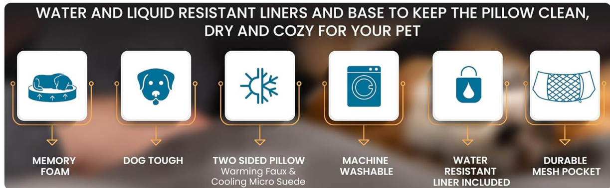
Image: An infographic illustrating the key features of the PetMedics dog bed, including memory foam, dog-tough construction, reversible pillow, machine washable cover, water-resistant liner, and a durable mesh pocket.