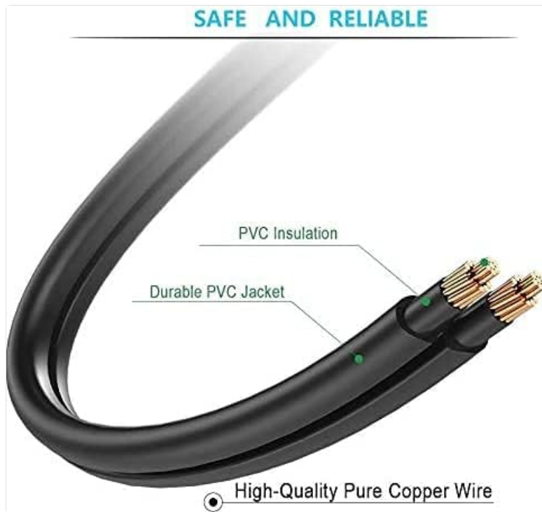
Image: A close-up view of the power cable, illustrating its internal structure with high-quality pure copper wire, PVC insulation, and a durable PVC jacket.