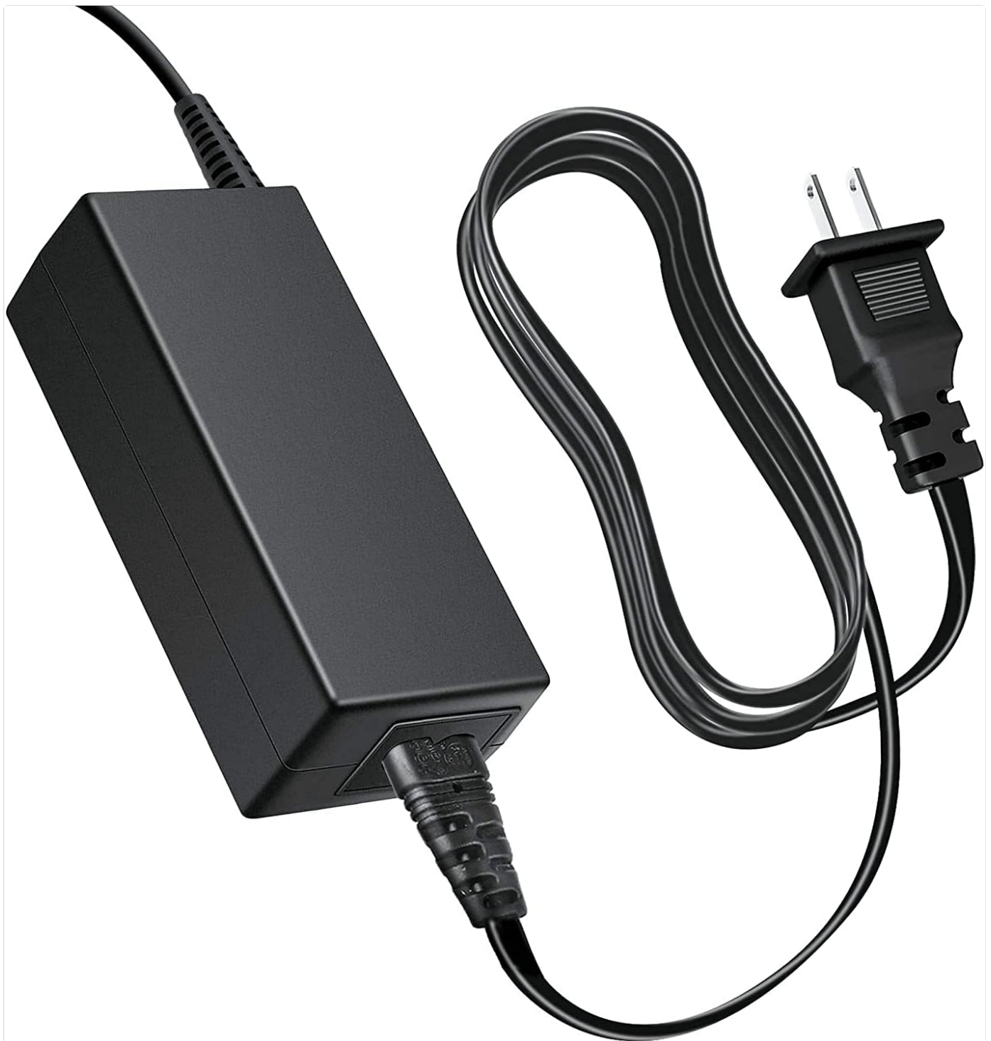
Image: The Marg AC Adapter, showing the main power brick unit connected to a power cord with a standard US plug.