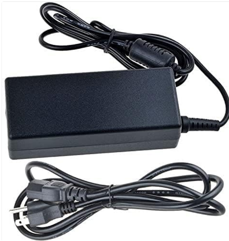
Image: The Marg AC Adapter unit with its detachable power cord and the output cable, showing how they connect to form a complete power supply.