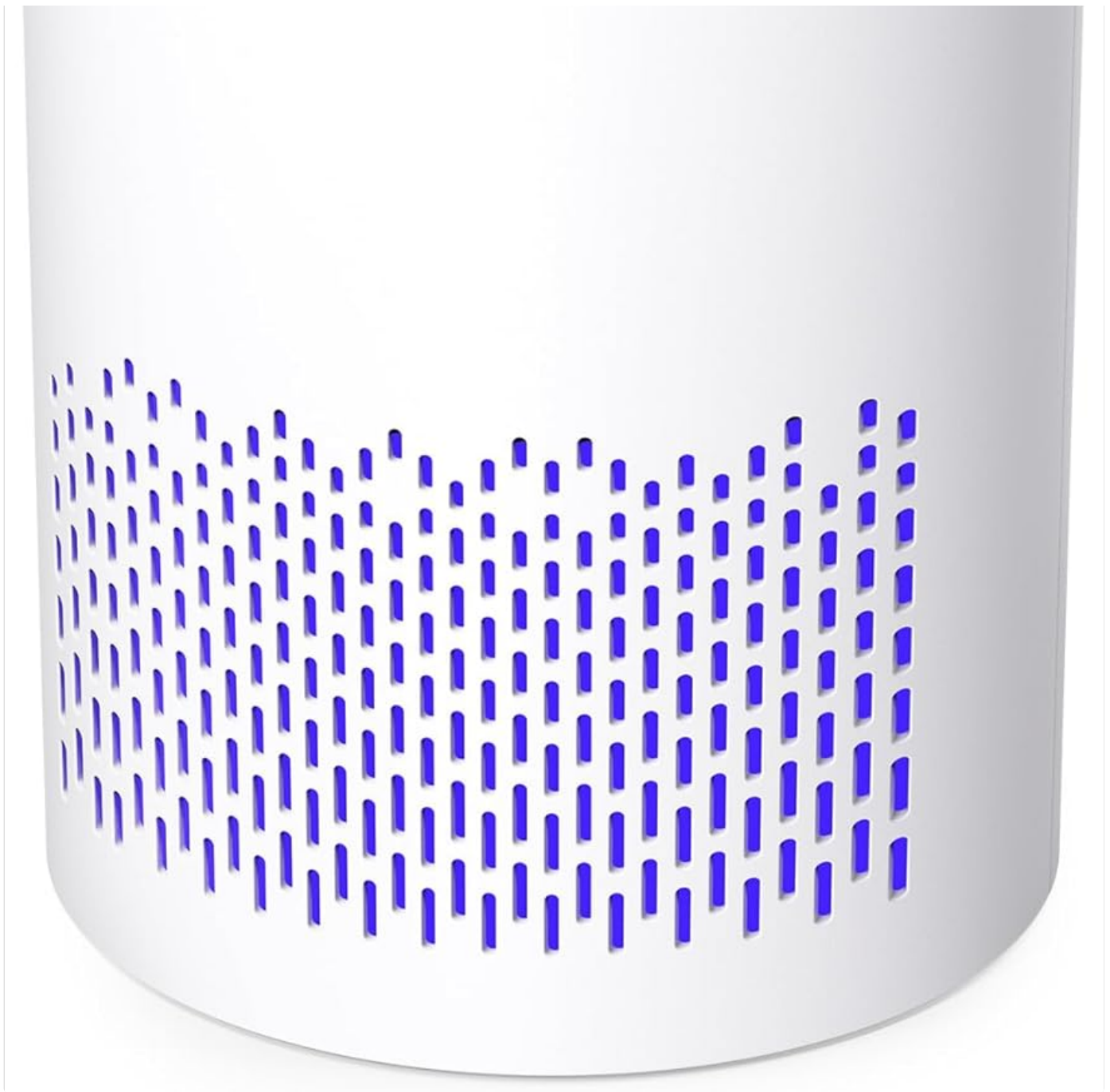
Image 1.1: The AROEVE Air Purifier MK01, a compact and efficient device for improving indoor air quality.