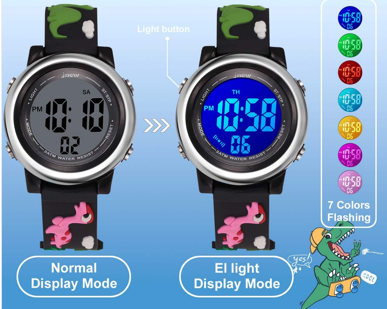
Figure 1: Watch Button Functions. This diagram illustrates the location and primary function of each button on the watch: Light, Mode, Start/Stop, and Reset.

Hold Down "Light Button" For 3s Will Change Different LED Color