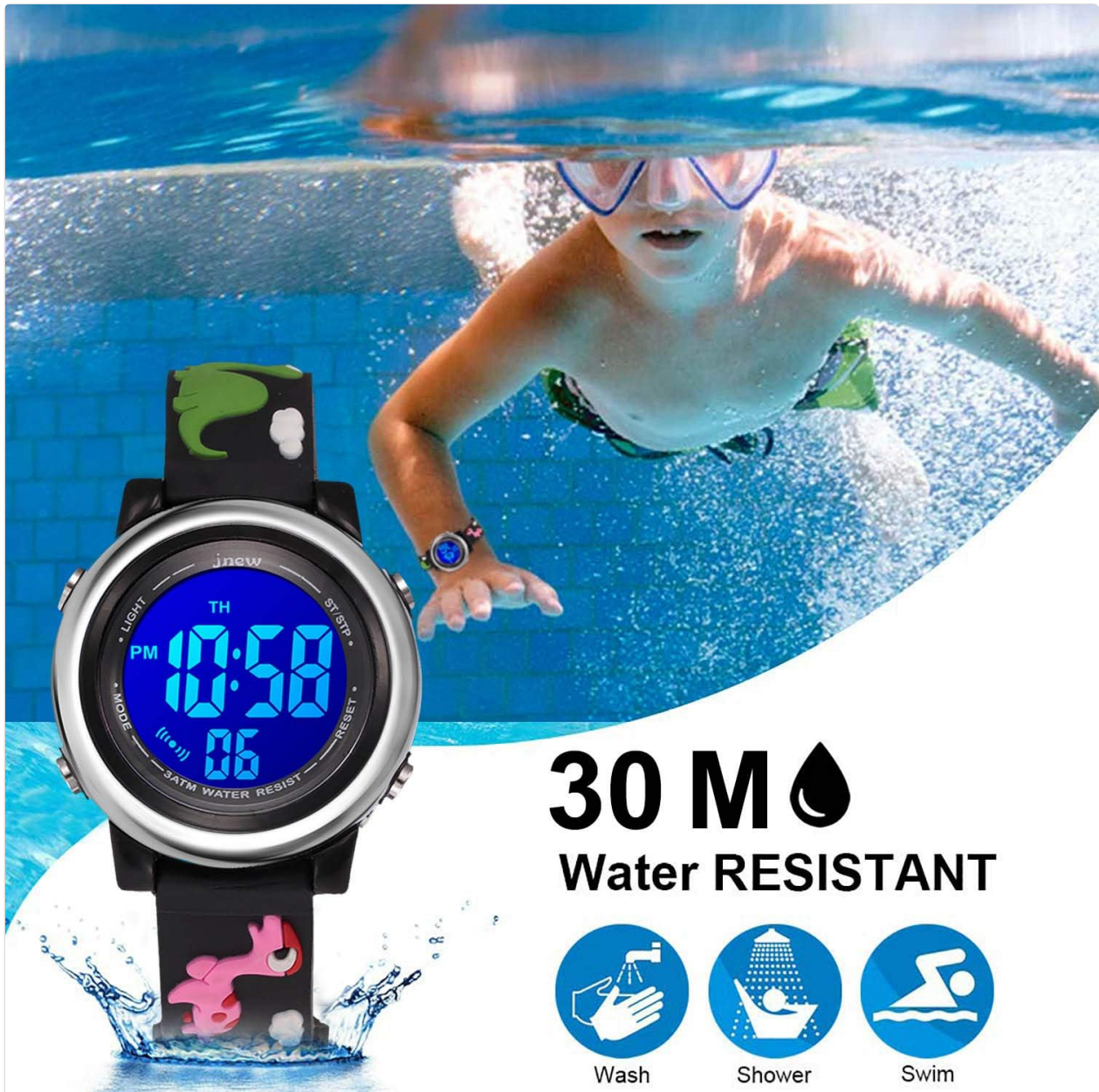
Figure 3: Water Resistance Features. This image highlights the watch's 30M water resistance, suitable for various water activities like washing hands, showering, and swimming.

The watch is 3 ATM (30 meters) water resistant, making it suitable for swimming, surfing, showering, hand washing, and rain. However, it is crucial to NOT press any buttons while the watch is submerged in water . Excessive water contact or use in extreme hot or cold temperatures can shorten the watch's lifespan.