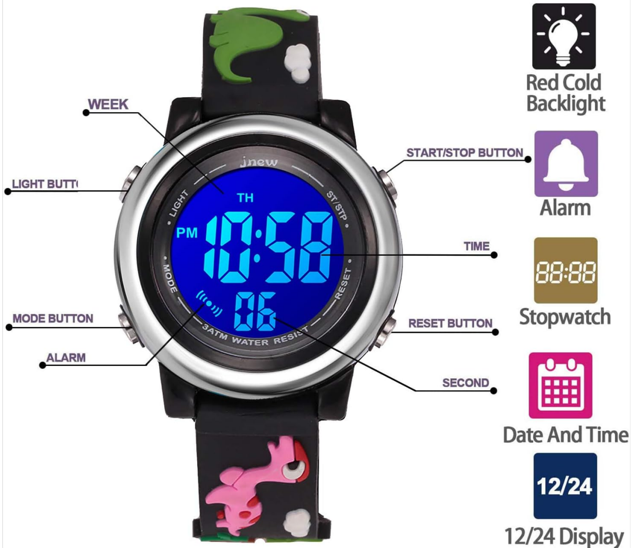
Figure 2: Backlight Functionality. This image demonstrates the watch's normal display and the vibrant EL light display with its seven adjustable colors.