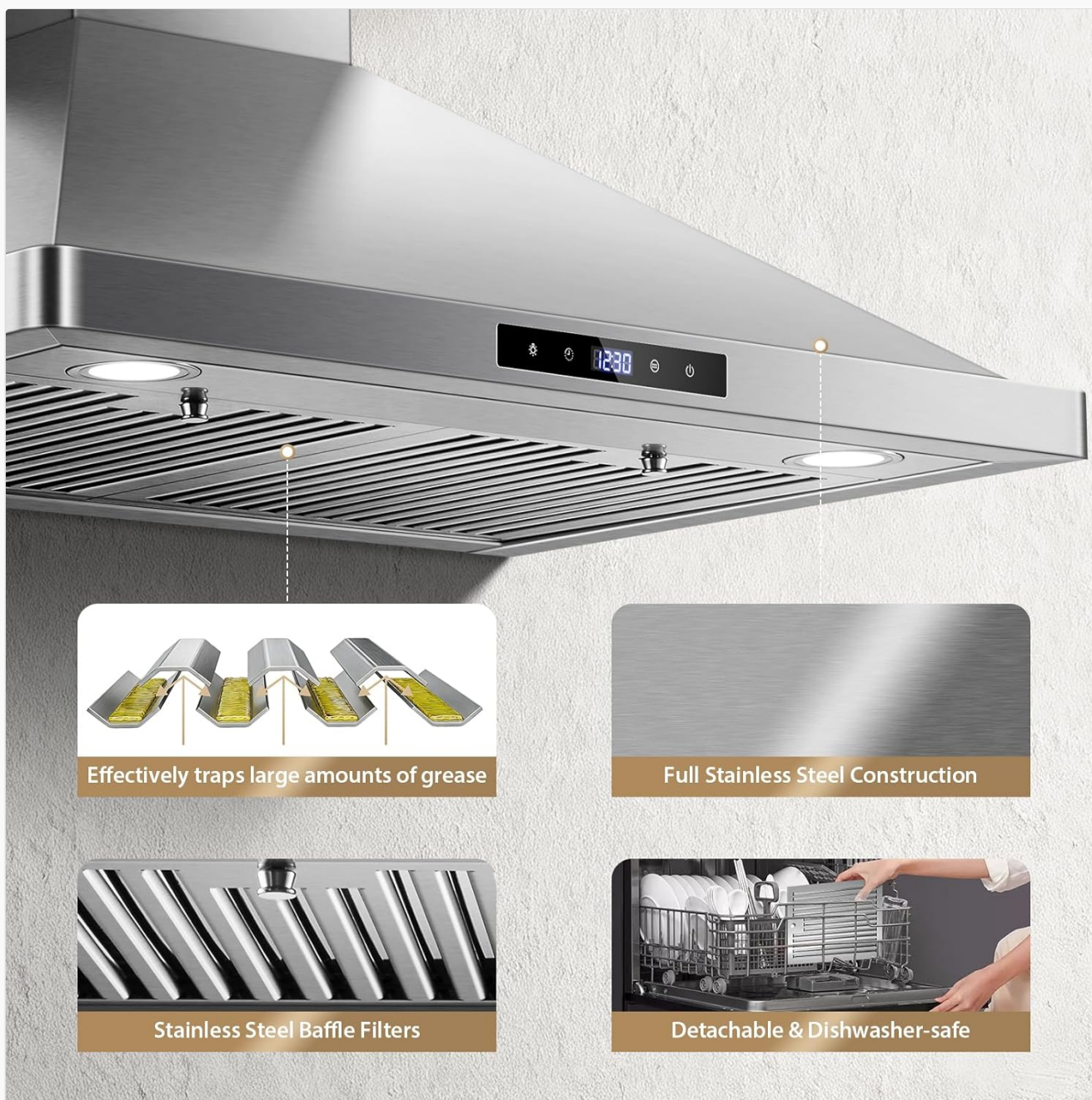
Figure 6: Dishwasher-Safe Baffle Filters and Stainless Steel Construction

The range hood is constructed from premium 430-grade, 20-gauge brushed stainless steel, which is resistant to fingerprints and easy to clean. Use a soft cloth with a non-abrasive stainless steel cleaner. Always wipe in the direction of the grain.