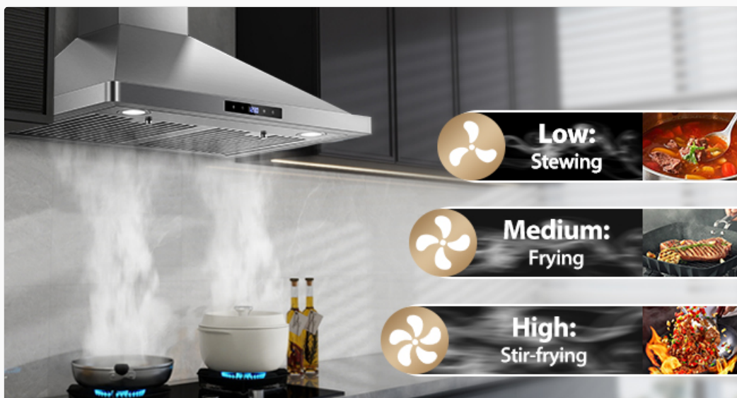
Figure 5: Fan Speed Settings for Various Cooking Tasks