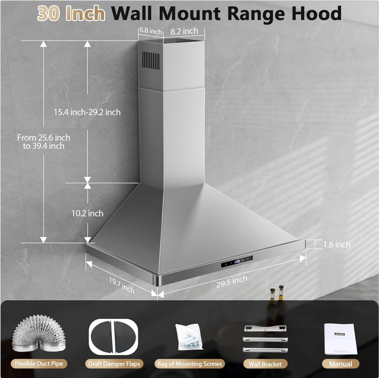
Figure 1: Dimensions and Included Components