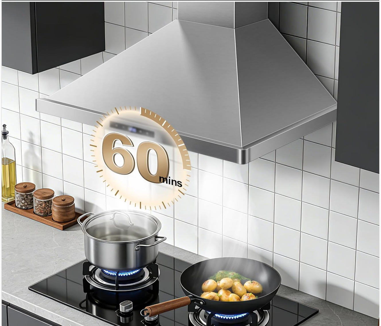
Figure 4: Delayed Shutdown Function