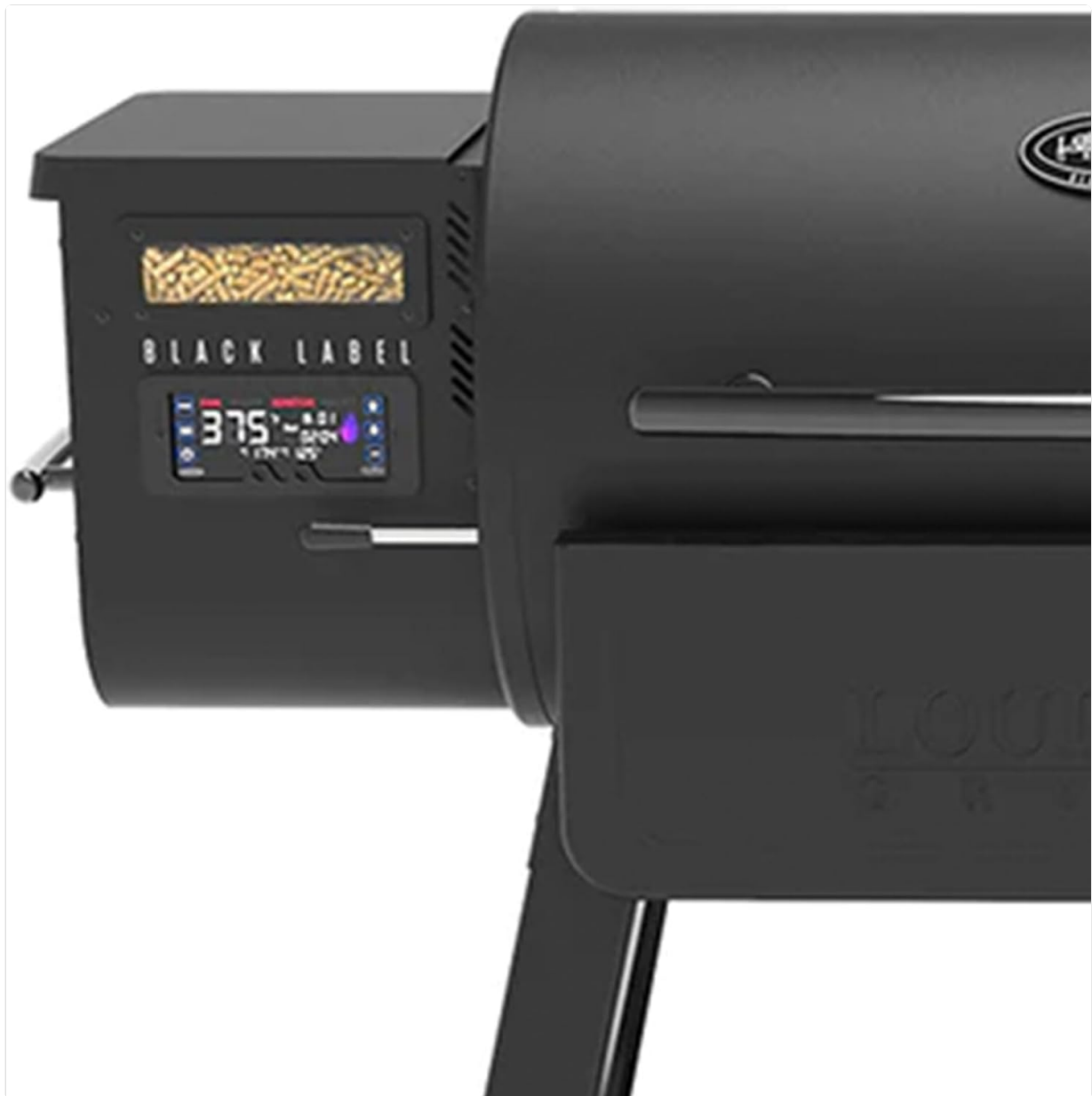
Figure 3.2: Close-up view of the digital control panel and the pellet hopper window. The control panel allows for precise temperature adjustments and displays current grill status, while the window provides visibility into the pellet level.