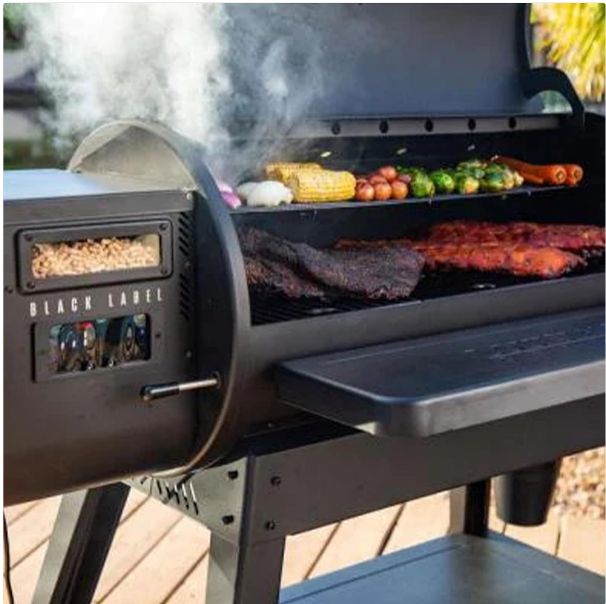
Figure 6.1: The LG1000BL grill in operation, demonstrating its capacity to cook a variety of foods simultaneously, including ribs, corn, and vegetables, utilizing both the main and upper racks.