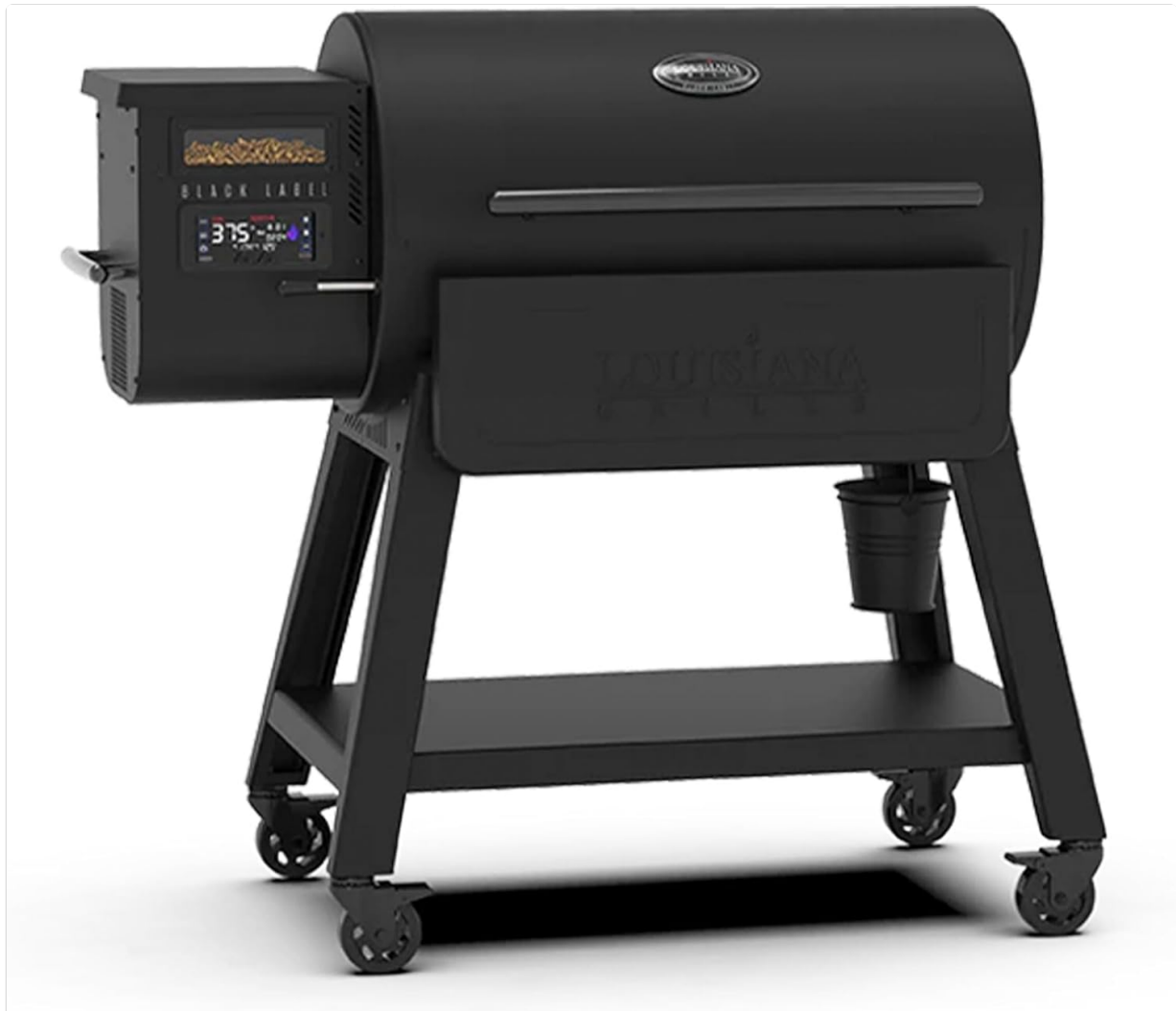
Figure 3.1: Overall view of the Louisiana Grills LG1000BL 1000 Black Label Series Wood Pellet Grill. This image displays the grill's main body, pellet hopper on the left, digital control panel, and the sturdy cart with wheels.

The Louisiana Grills LG1000BL is a robust wood pellet grill designed for versatile outdoor cooking. It features a large cooking area, a digital control board with WiFi connectivity, and a durable powder-coated steel construction.