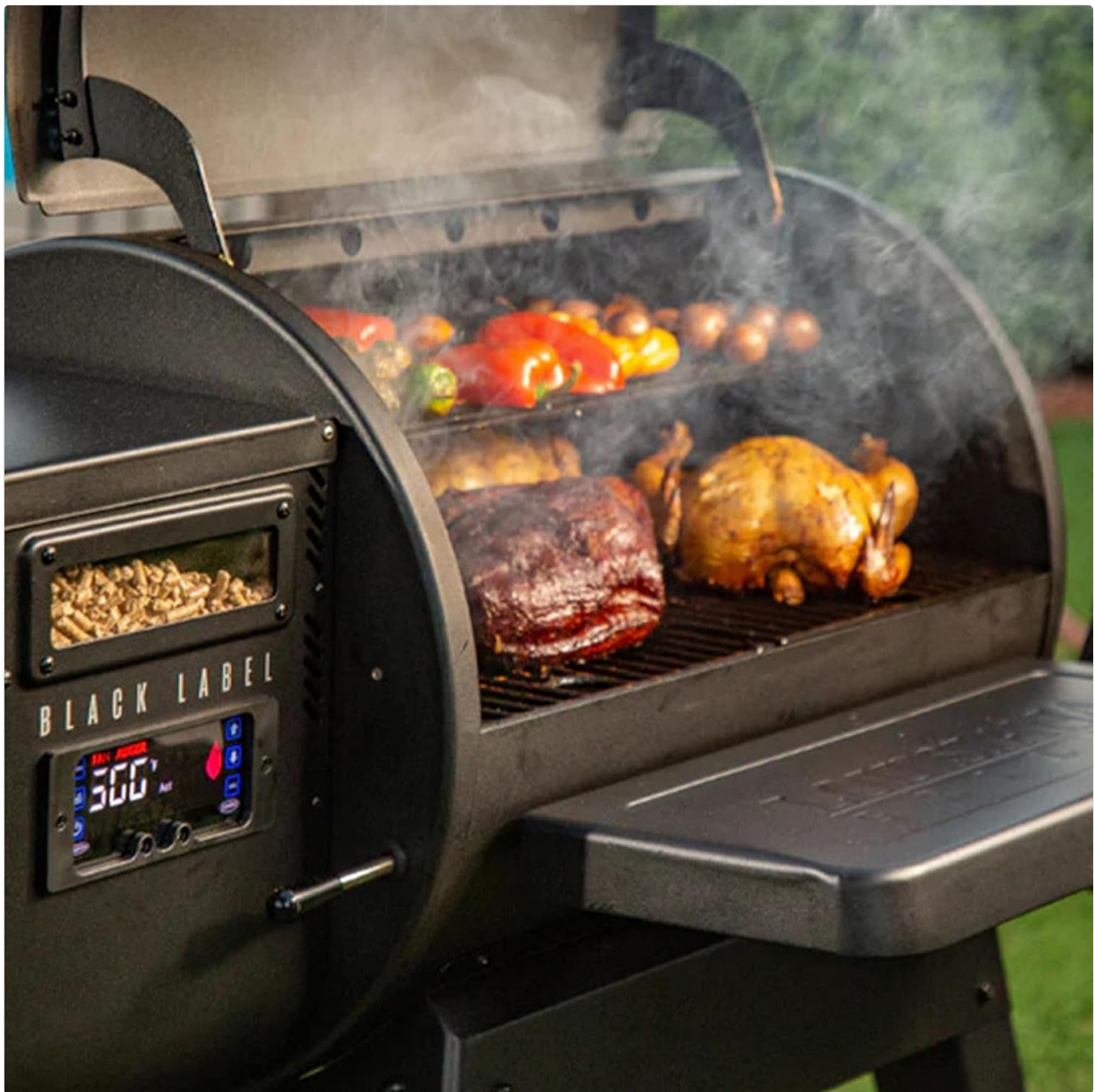
Figure 6.2: A closer view of the grill's interior during cooking, showing whole chickens and a large roast on the grates, with smoke visible, indicating the wood-fired cooking process.