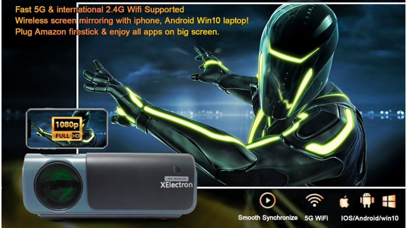
Image: A graphic illustrating the XElectron C50 projector supporting AirPlay and Miracast for wireless screen mirroring from iOS, Android, and Windows devices, including a phone displaying content mirrored to a large screen.

Plug Amazon Firestick & enjoy all apps on big screen.