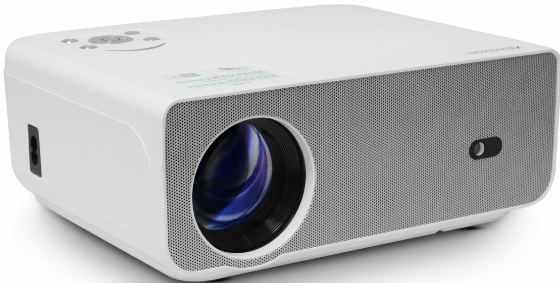
Image: The front of the XElectron C50 Plus projector, highlighting its main lens.