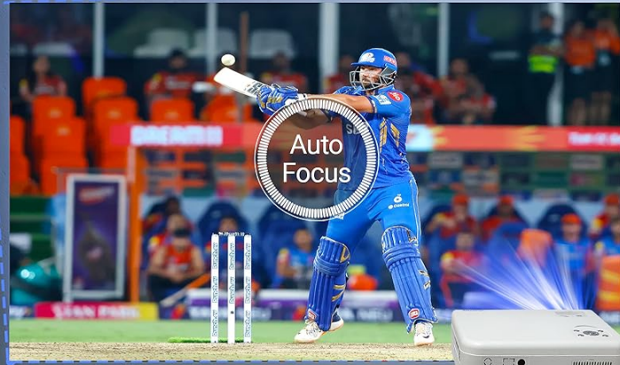
Image: Visual representation of the projector's instant auto-focus and auto-keystone correction in action.

Experience a large display with screen sizes up to 300 inches, providing an immersive viewing experience.