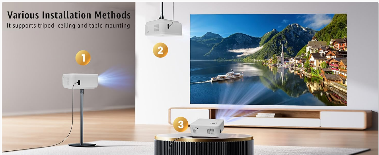
Image: Illustration of different projector mounting options: on a tripod, ceiling-mounted, and tabletop placement.