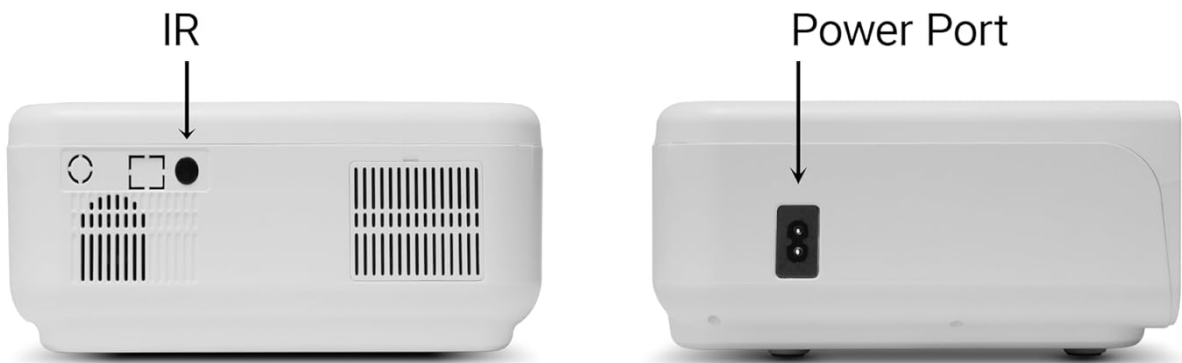
Image: Detailed view of the projector's rear and side panels, indicating the location of the 3.5mm port, AV port, HDMI 1, HDMI 2, USB 1, USB 2, IR receiver, and Power Port.

The projector features various ports for connectivity: