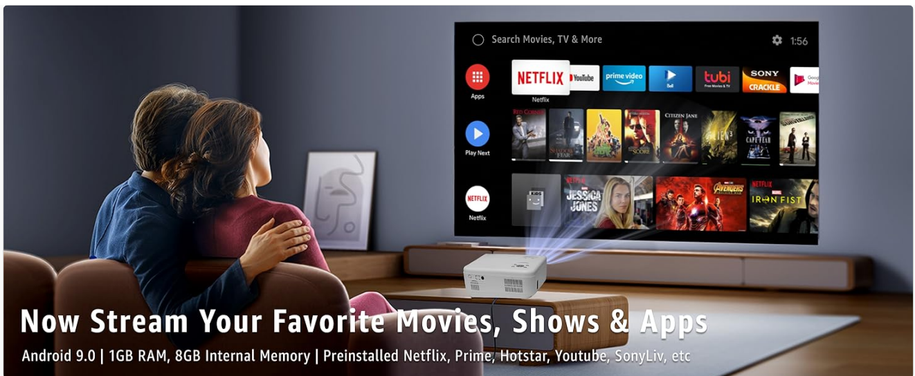
Image: The projector displaying its smart interface with pre-installed streaming applications.