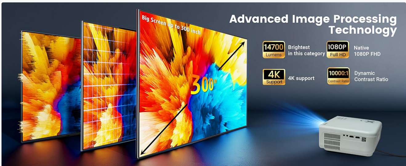
Image: A visual comparison of projected screen sizes, demonstrating the capability of up to a 300-inch display.

Experience a large display with screen sizes up to 300 inches, providing an immersive viewing experience.