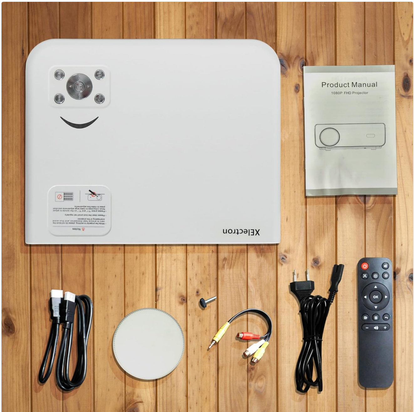
Image: Box contents of the XElectron C50 Plus projector, showing the main unit, remote, power cord, HDMI cable, AV cable, and user manual.