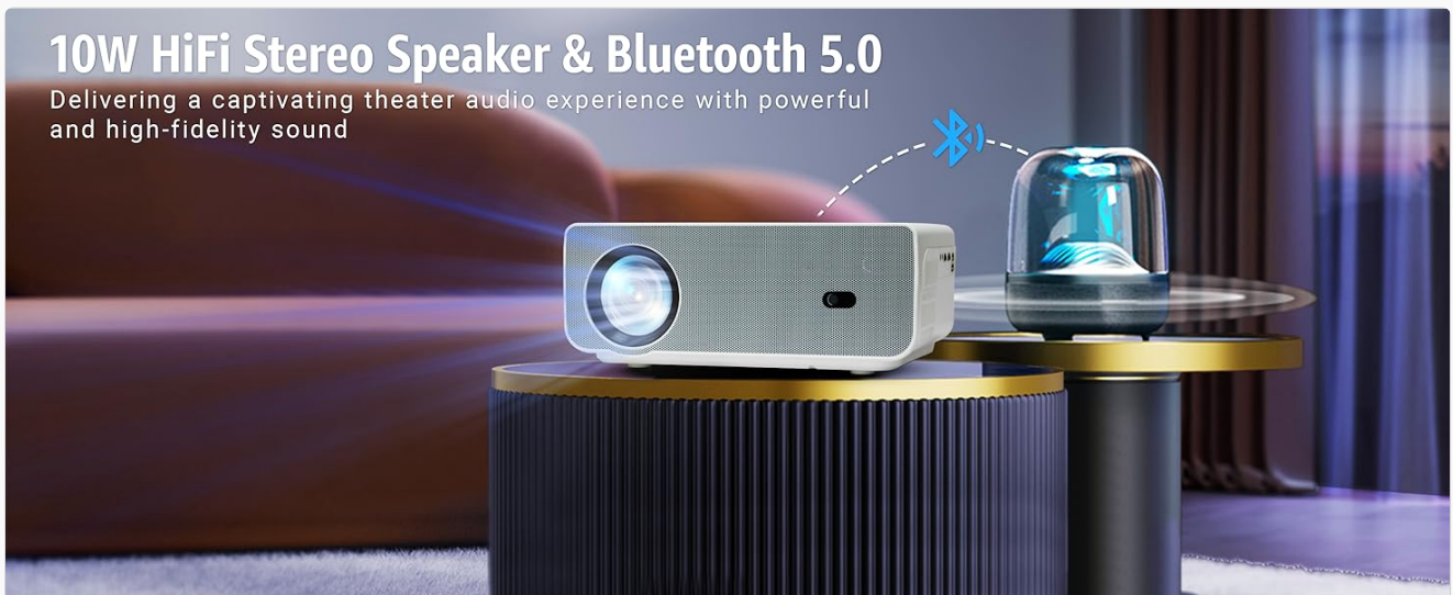
Image: The projector wirelessly connected to a Bluetooth speaker, demonstrating its audio capabilities.