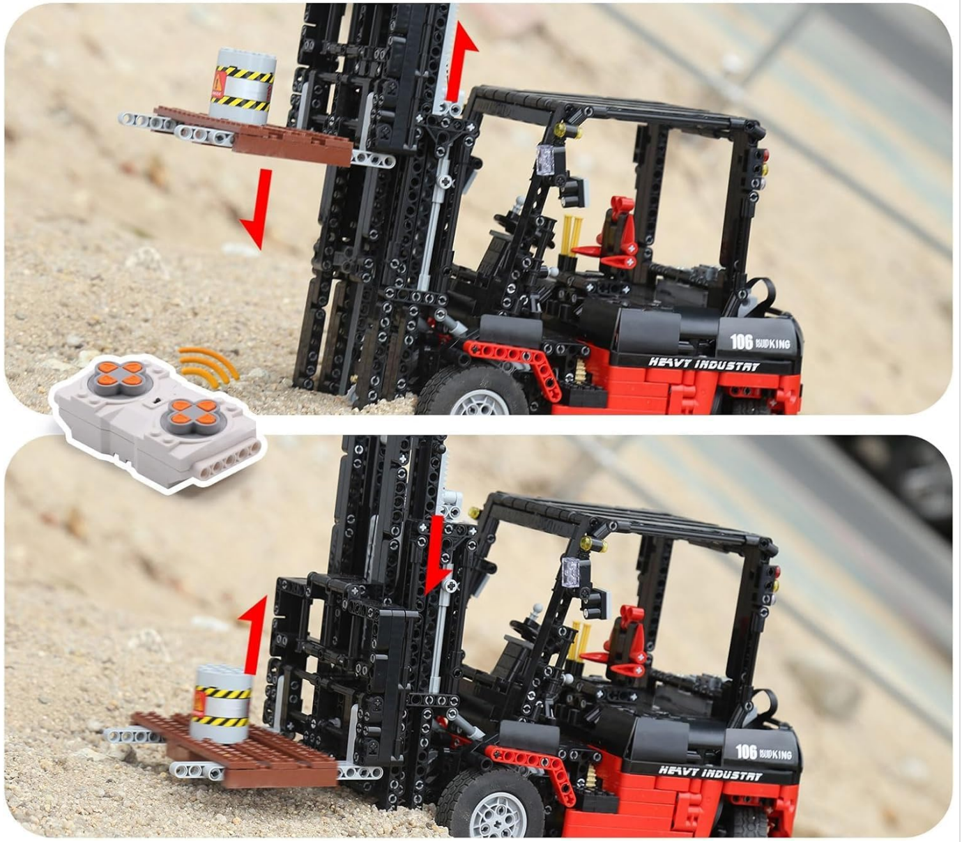
Image: Two panels demonstrating the electric lift and fall function of the forklift forks. The top panel shows the forks moving upwards, and the bottom panel shows them moving downwards, controlled by the remote.