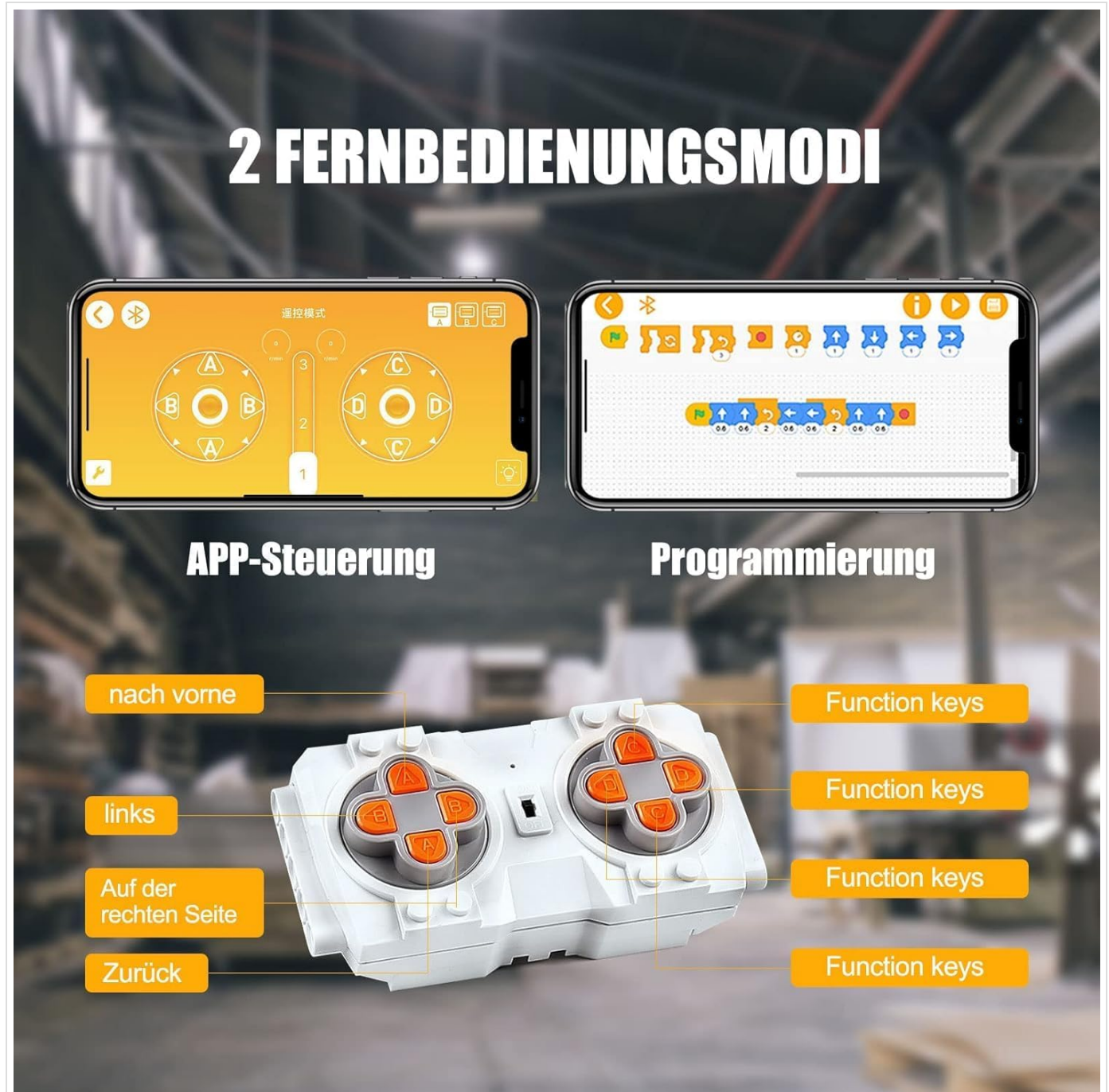
Image: Illustration showing two control methods: a mobile application interface for control and programming, and the physical 2.4GHz handheld remote control with labeled function keys for forward, backward, left, and right.