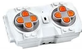
1x Remote Control Requires 2AAA Batteries (not included)