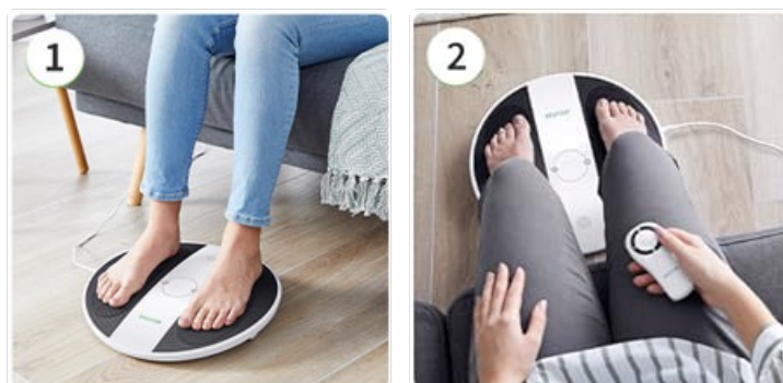
Images: (Left) Close-up of feet being placed on the device. (Right) A user seated, operating the device with the remote control.

Sit comfortably in a chair. Place both bare feet on the textured footpads of the device. Ensure full contact for optimal performance. Do not stand on the device.