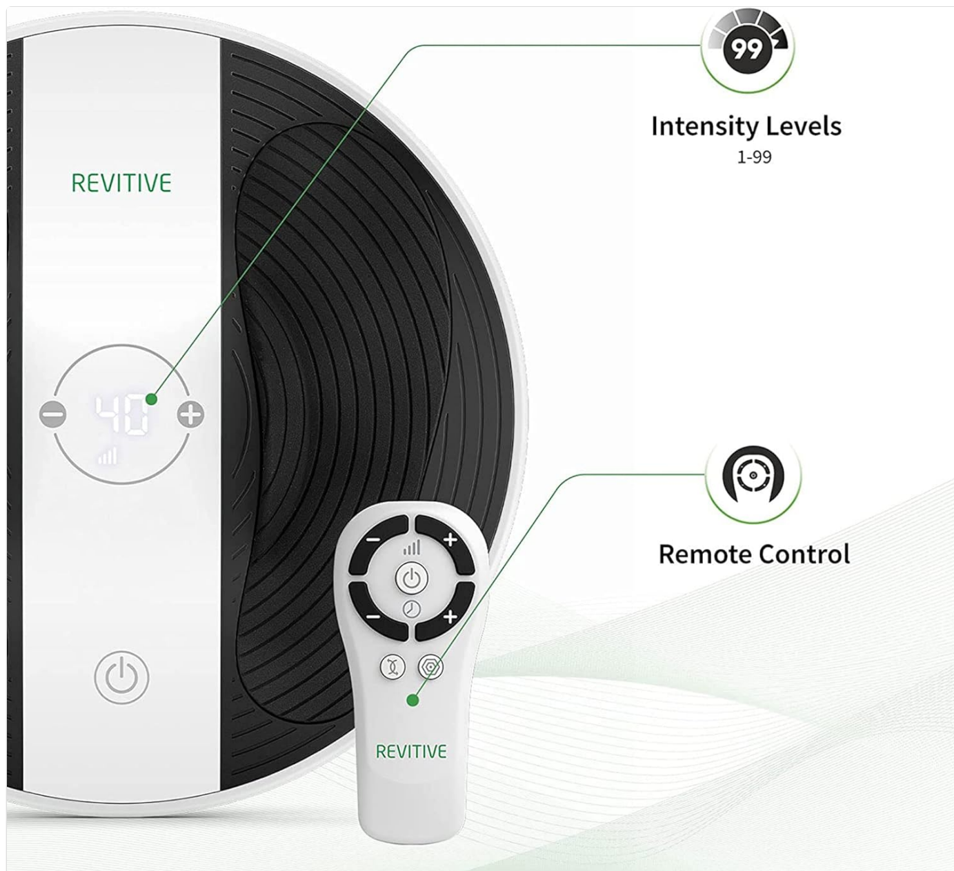
Image: A close-up of the Revitive ProHealth display showing intensity level '40' and the remote control used for adjustments.

Use the remote control to turn on the device and adjust the intensity level. The device offers 99 intensity levels. It is recommended to start at intensity level 30 and gradually increase it over time to maximize benefits, based on your foot sensitivity. You should feel a comfortable muscle contraction.