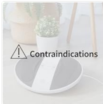
Image: A warning symbol overlaid on the Revitive device, emphasizing the importance of reviewing contraindications before use.