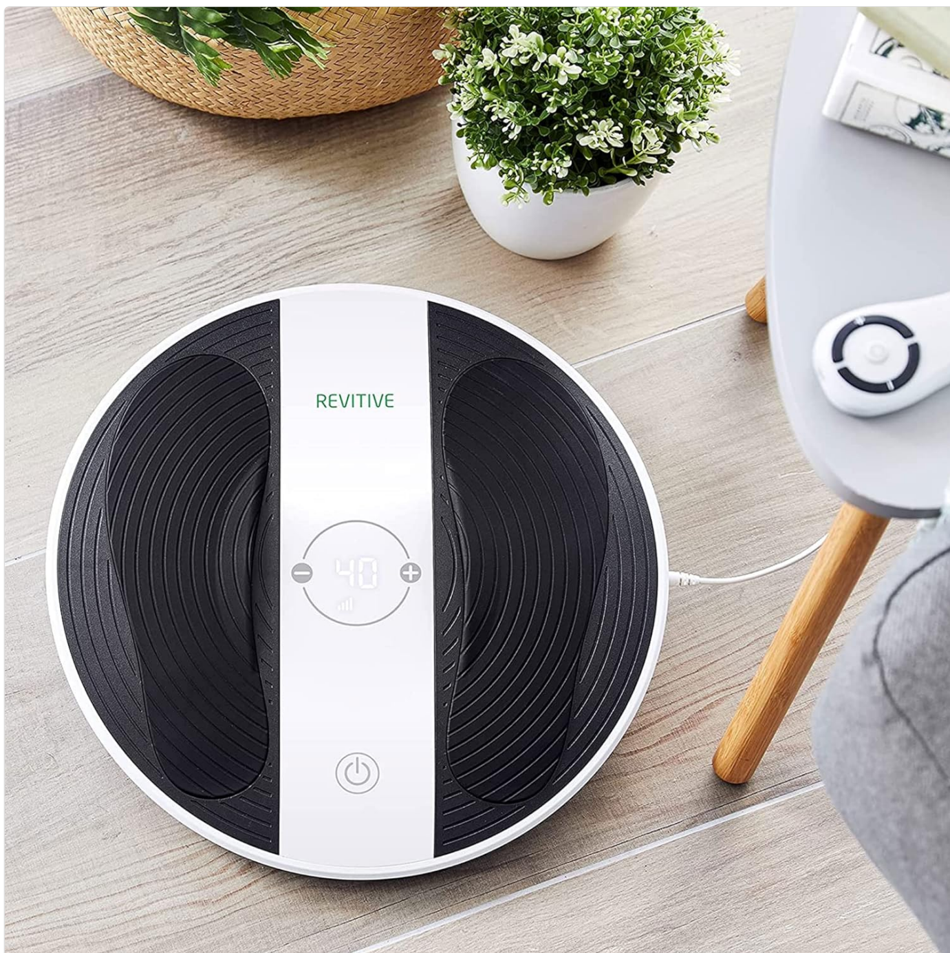
Image: The Revitive ProHealth device positioned on the floor, ready for use while seated.