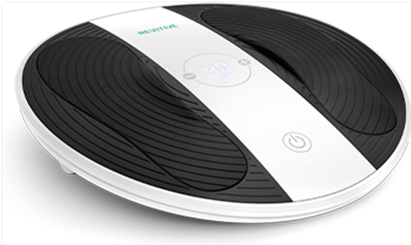
Image: The Revitive ProHealth Circulation Booster, a compact, oval-shaped device with a white central panel and black textured footpads.

The Revitive ProHealth Circulation Booster is an FDA-cleared medical device designed to alleviate symptoms of tired, aching, and heavy-feeling legs and feet, with or without occasional foot and ankle swelling. It utilizes advanced Electromagnetic Muscle Stimulation (EMS) technology to improve blood circulation in the lower extremities.