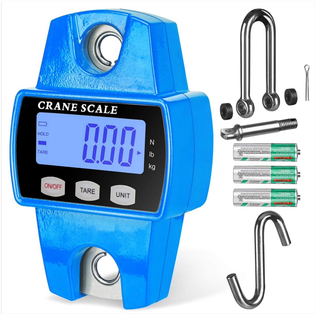
This image displays the main components of the RoMech Digital Hanging Scale, including the scale unit, S-shape hook, shackle, and batteries.