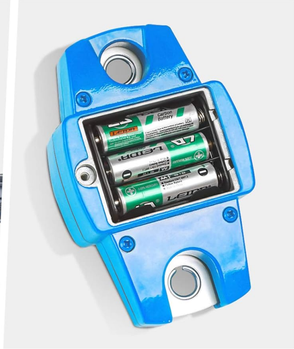
Install 3 AA Batteries

To install batteries, unscrew the battery cover on the back of the unit and insert 3 AA batteries, ensuring correct polarity.