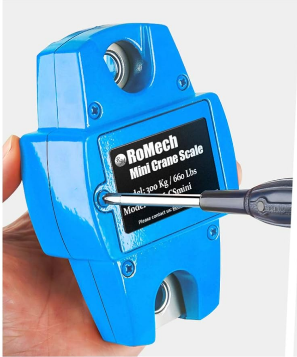
Open Battery Cover