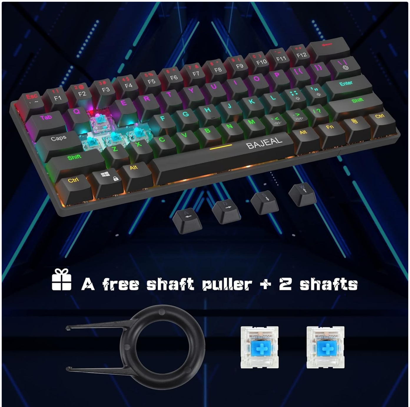
Figure 7.1: The keyboard comes with a free shaft puller and two additional blue switches, enabling users to easily replace or customize their mechanical switches.