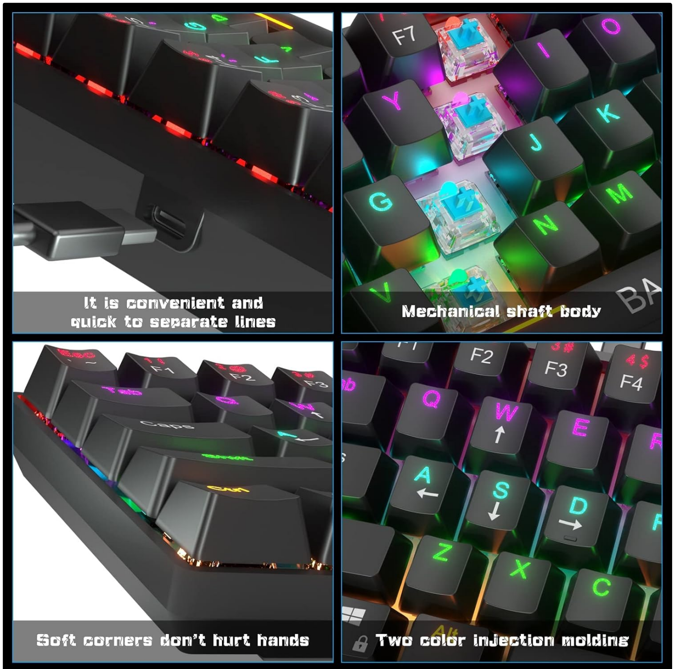
Figure 5.1: Detailed views of the keyboard's features, including the convenient and quick-to-separate Type-C cable, the mechanical shaft body (switches), soft corners for ergonomic comfort, and the durable two-color injection molding keycaps.

swappable switch feature and various RGB lighting effects.