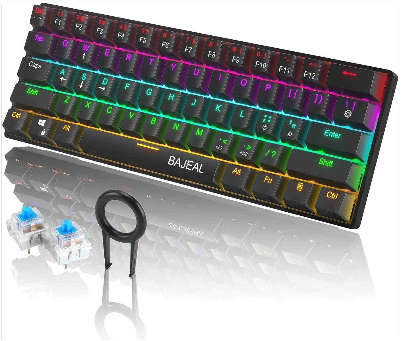
Figure 2.1: The BAJEAL 61-Key Wired Gaming Mechanical Keyboard, showcasing its compact design and vibrant RGB backlighting. The image also displays the included switch puller and two extra blue switches, highlighting the hot-swappable feature.