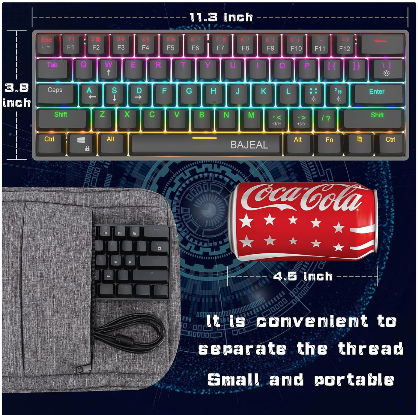
Figure 4.1: Visual representation of the keyboard's compact dimensions (11.3 inches length, 3.8 inches width) and the convenience of its detachable Type-C cable, making it small and portable.