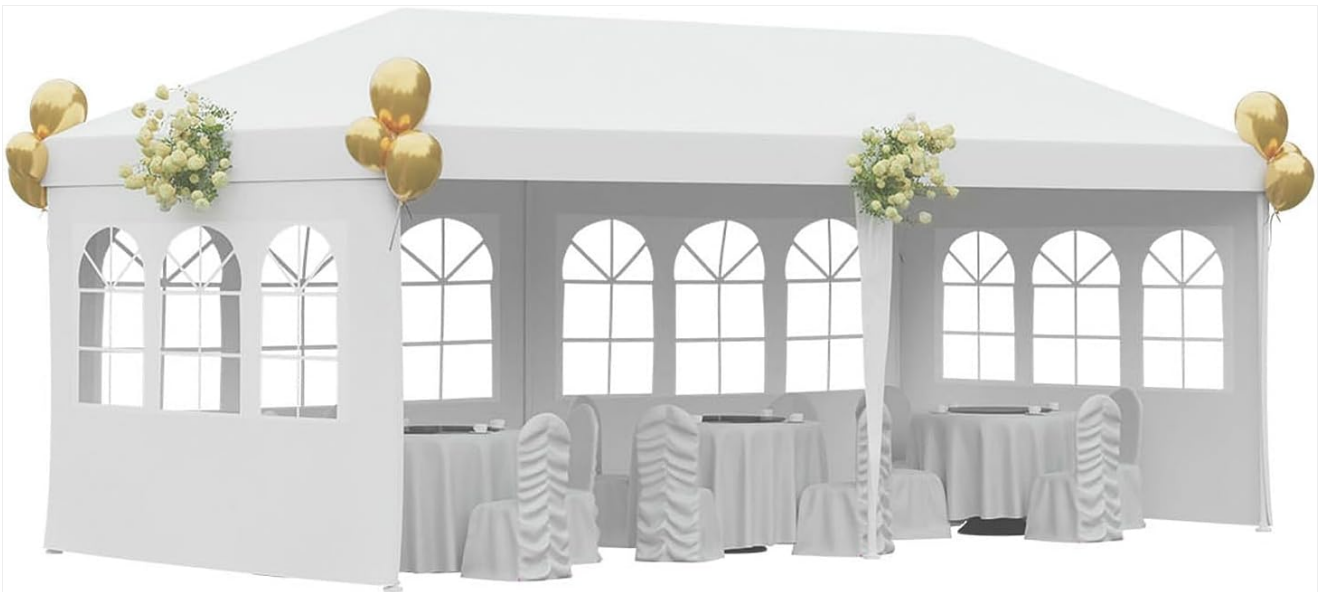
Image 1: The FDW 10x20 Outdoor Gazebo Wedding Party Tent, fully assembled and ready for use in an outdoor setting.

This manual provides comprehensive instructions for the assembly, operation, and maintenance of your FDW 10x20 Outdoor Gazebo Wedding Party Tent. Designed for versatility and durability, this canopy tent offers shelter and a comfortable space for various outdoor events. Please read these instructions carefully before setup to ensure safe and correct usage.