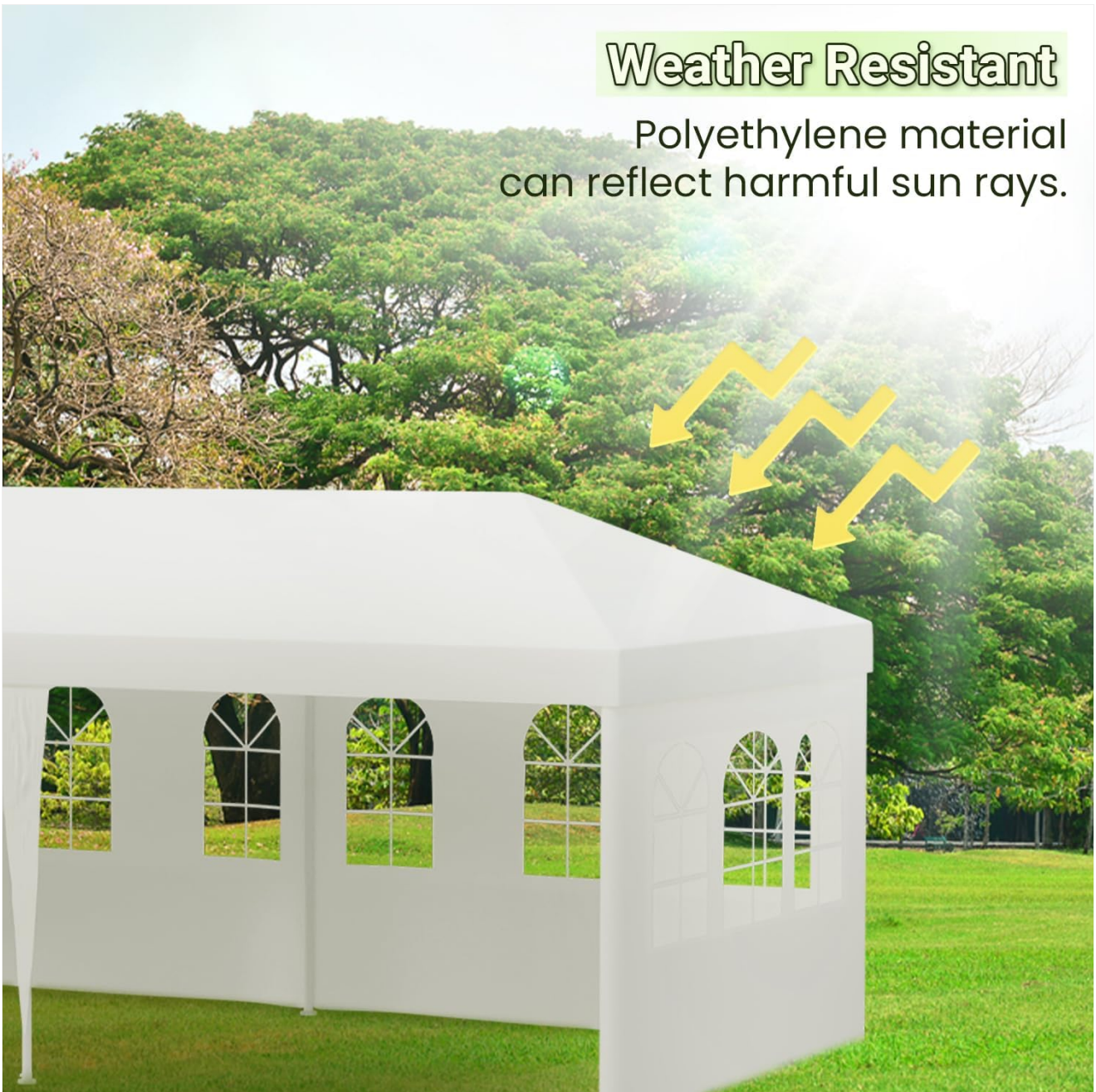
Image 3: The white polyethylene canopy top being installed over the tent frame, illustrating its weather-resistant properties.

Polyethylene material can reflect harmful sun rays.