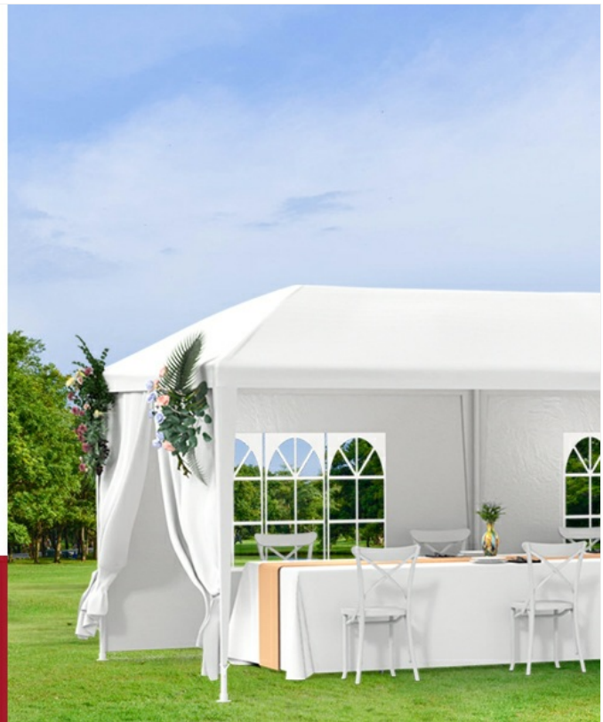
Image 6: The gazebo with some sidewalls removed or rolled up, illustrating its adaptability for different events and weather.