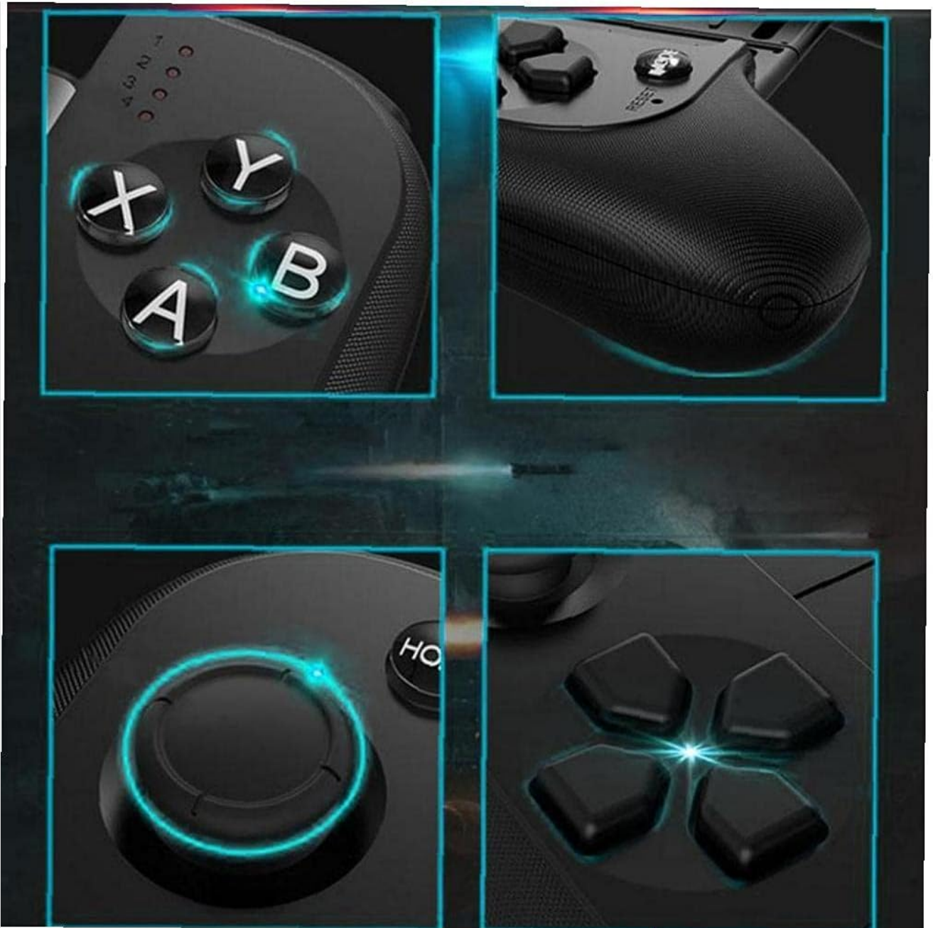
Image: A multi-panel view showcasing the controller's key components: the action buttons (A, B, X, Y), the textured grip for comfort, the responsive analog joystick, and the precise D-pad.