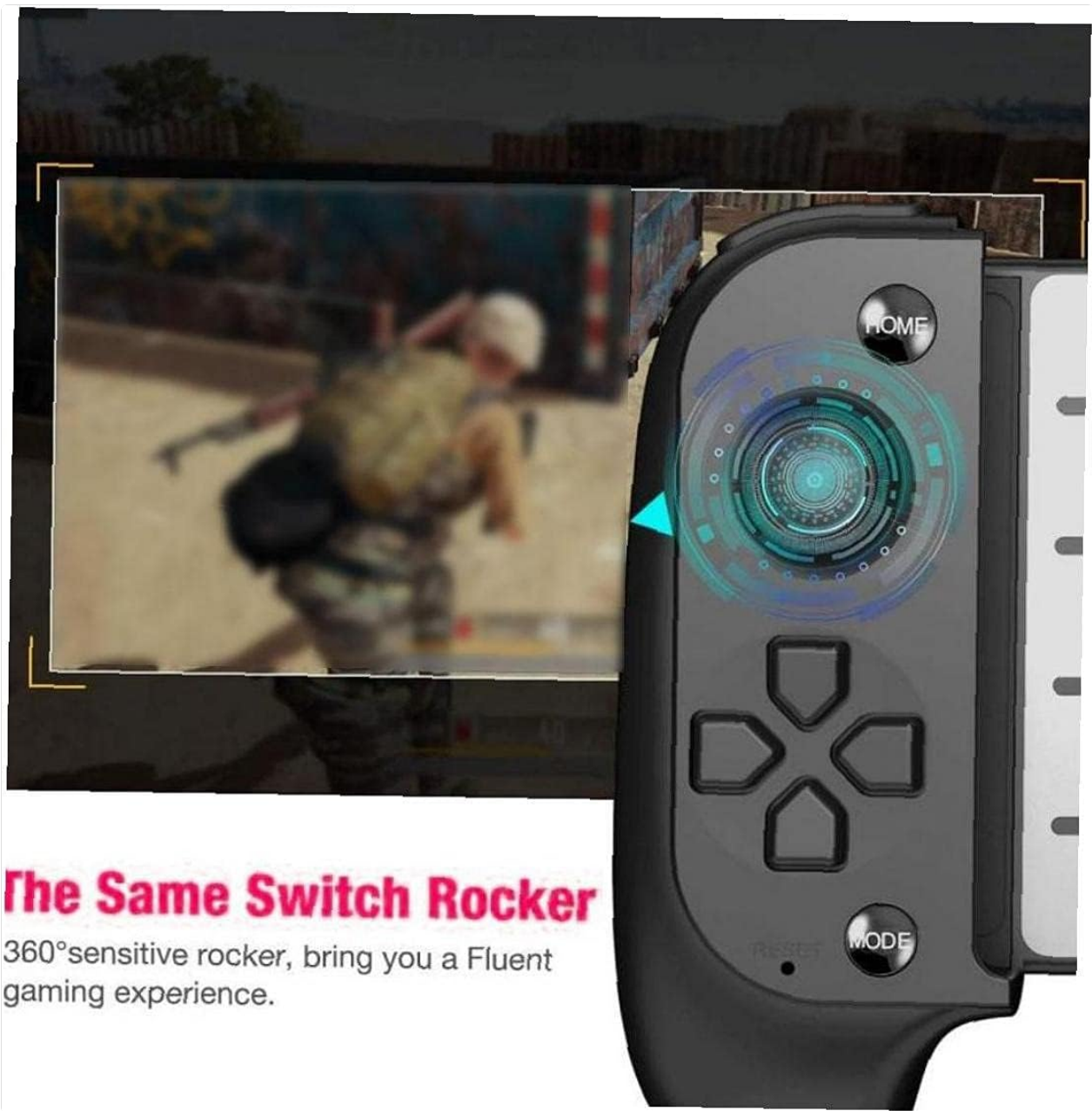
Image: A close-up view of the left side of the controller, highlighting the HOME button and the responsive joystick, which is crucial for precise in-game movements.