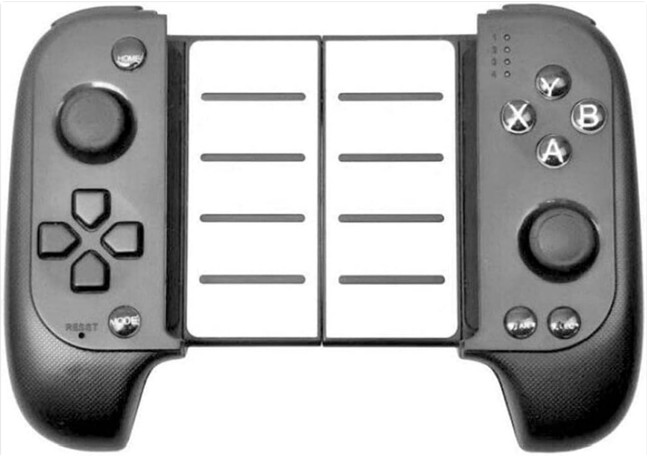
Image: The Luomo STK-7007F Wireless Game Controller in its compact, collapsed state, showcasing its black finish and button layout.