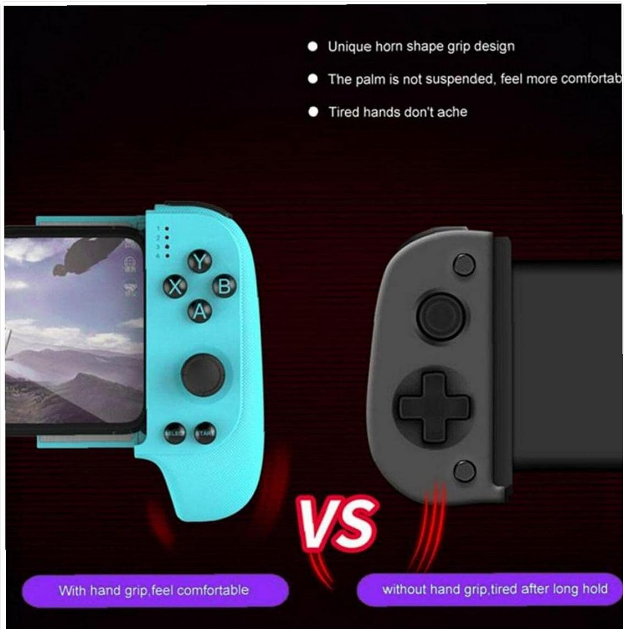
Image: A visual comparison demonstrating the comfort provided by the controller's ergonomic grip design versus a standard flat grip, emphasizing reduced hand fatigue during long playtimes.