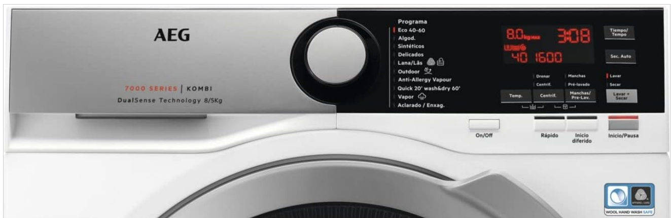
Figure 2: Detailed view of the LCD control panel and program selector.

The control panel features a central program selector knob, an LCD display, and touch buttons for various options such as temperature, spin speed, and special functions. Refer to the display for cycle information and status.