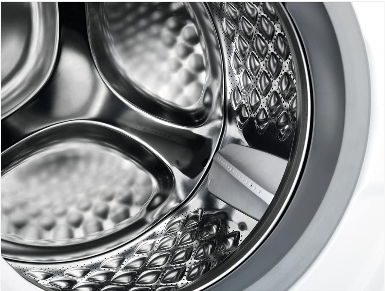
Figure 7: The stainless steel drum interior, designed for gentle fabric care.