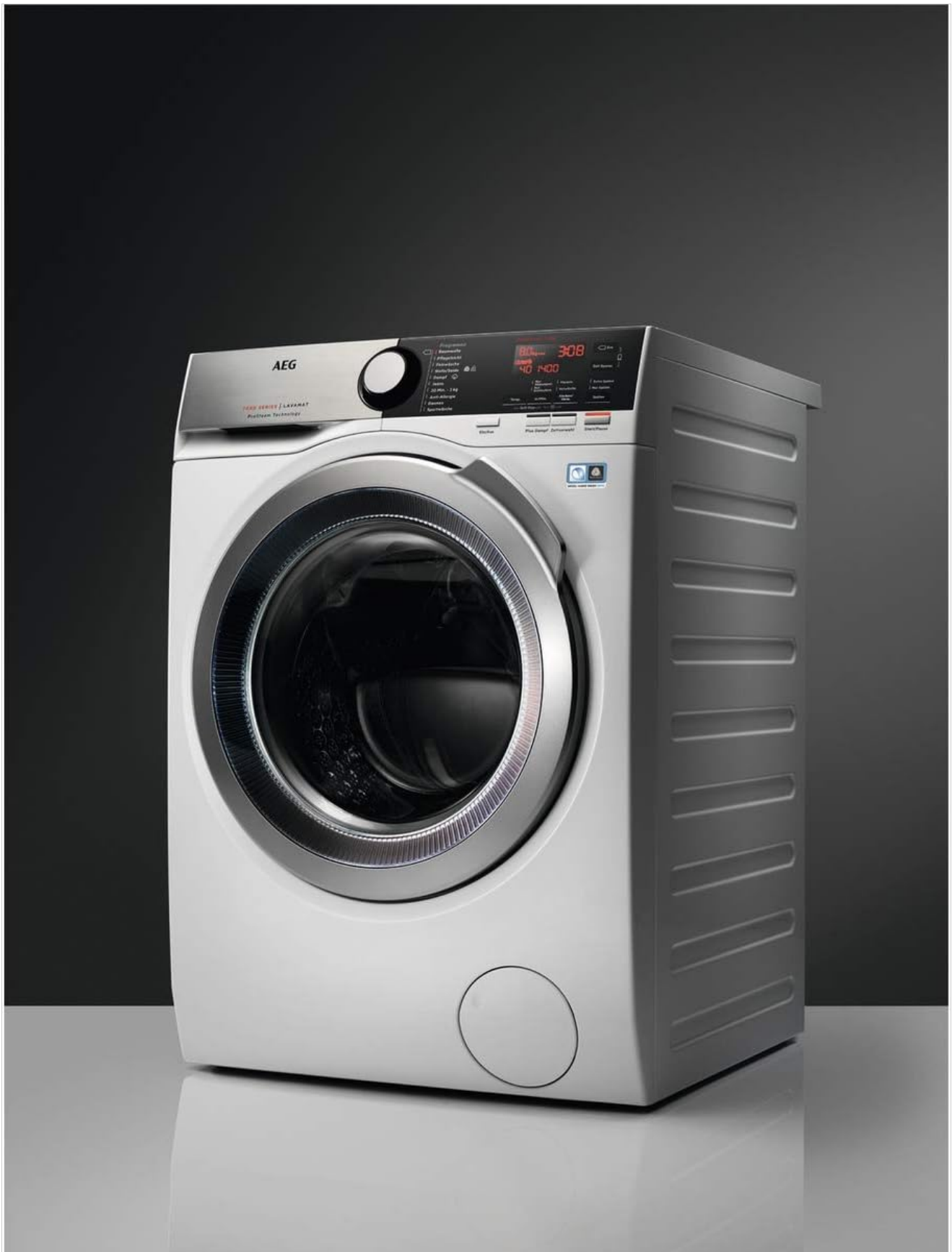
Figure 1: Front view of the AEG L7WEE852 Washer Dryer.