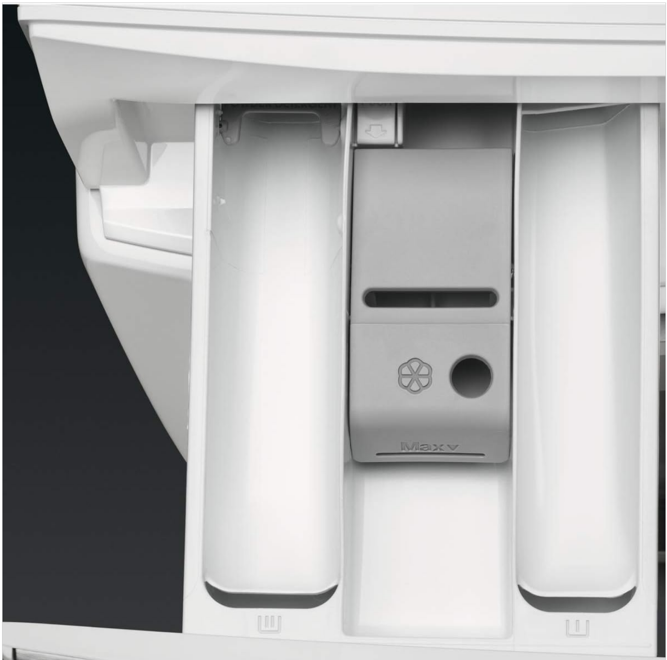
Figure 4: The detergent dispenser with compartments for pre-wash, main wash, and fabric softener.