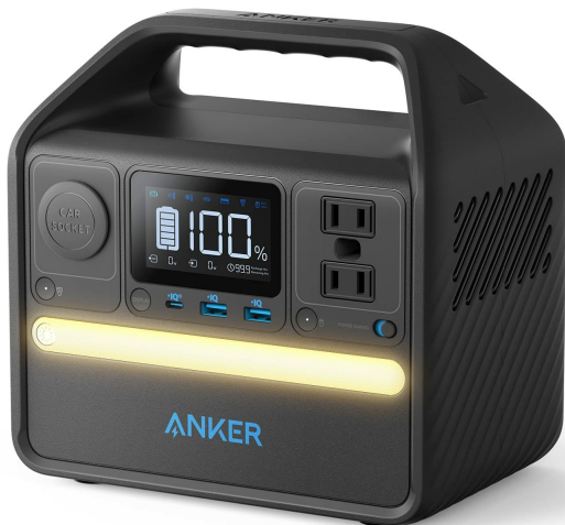
The Anker 521 Portable Power Station, showcasing its compact design and integrated handle.