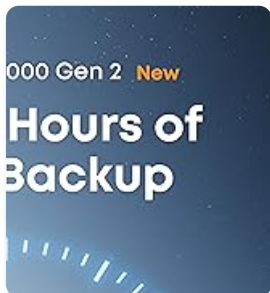
Demonstration of the 256Wh total capacity, providing enough power for a weekend getaway, charging phones, laptops, lamps, and fans.