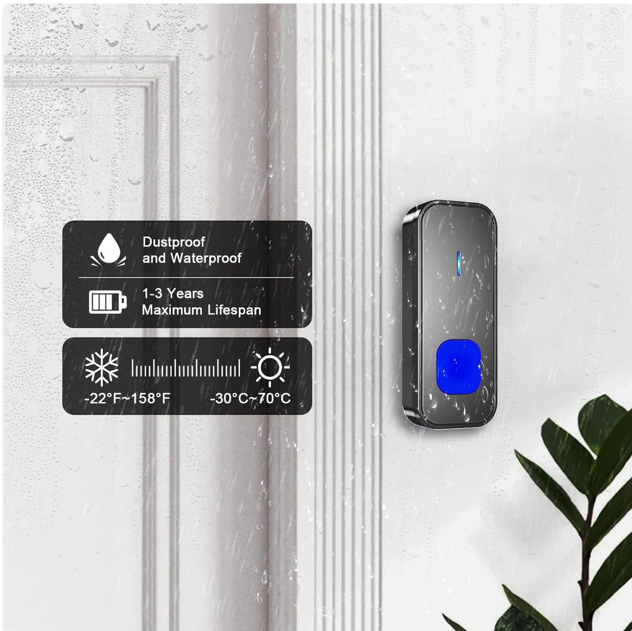
A doorbell transmitter is mounted on a door, with text indicating its dustproof and waterproof design, a maximum lifespan of 1-3 years, and an operating temperature range of -30°C to 70°C (-22°F to 158°F), suitable for various weather conditions.