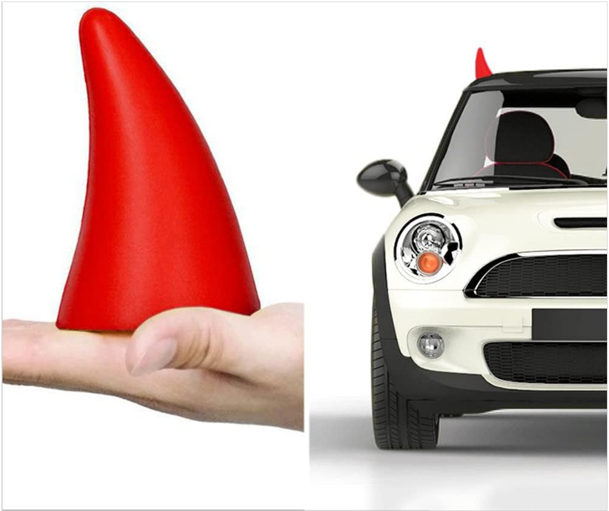
Figure 3: Example of a red horn sticker held in hand, with an illustration of a white car featuring similar red horn decorations on its roof.