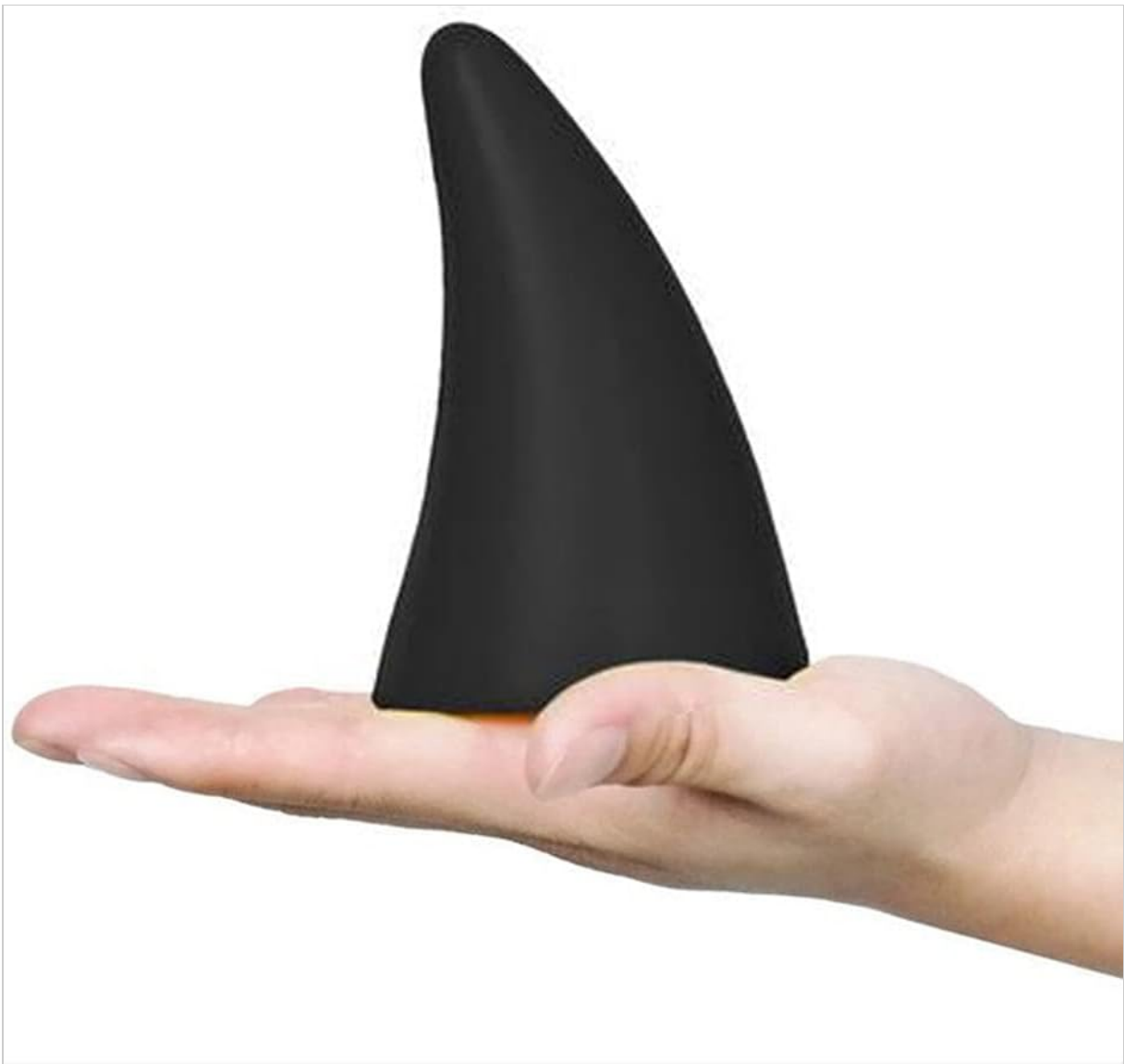
Figure 1: The iSpchen 3D Horn Decoration Sticker, black color, held in a hand, illustrating its size relative to a human hand.