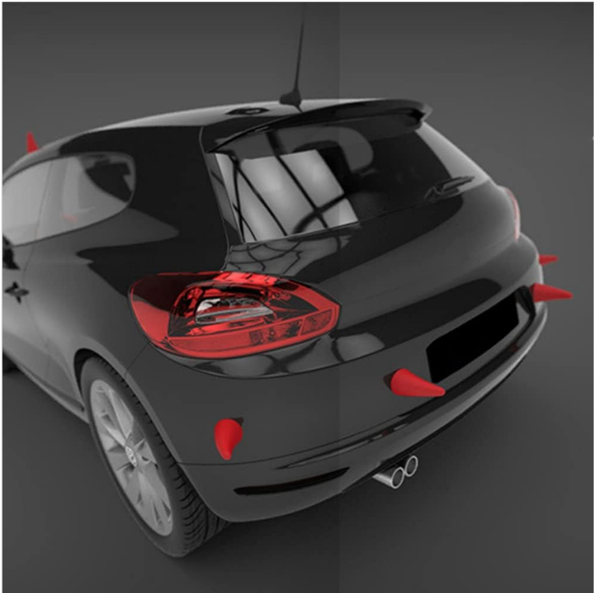
Figure 6: A black car adorned with red iSpchen 3D Horn Decoration Stickers on its roof and rear bumper, showcasing a full vehicle application.