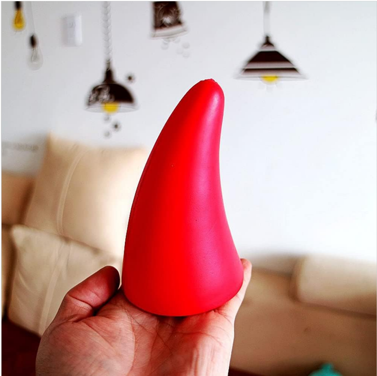
Figure 4: A red iSpchen 3D Horn Decoration Sticker held in a hand, demonstrating its form and color in an indoor setting.