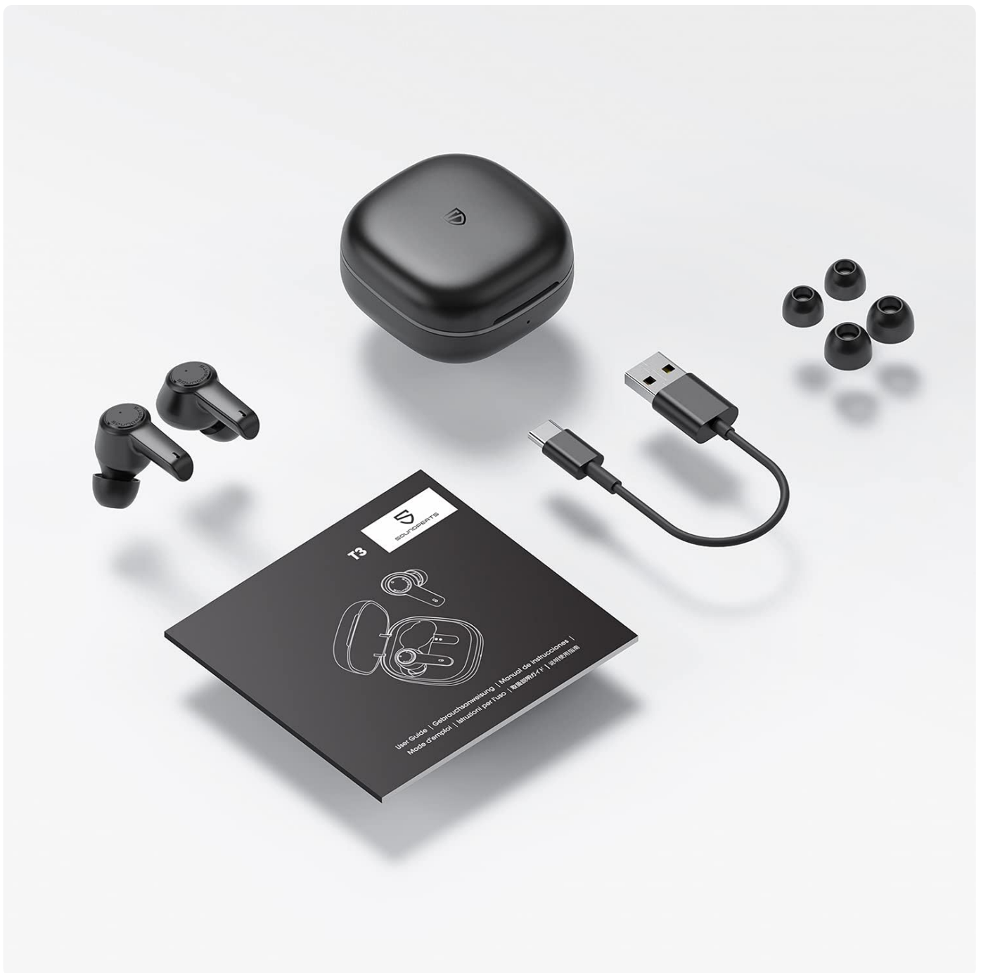
Image: The SoundPEATS T3 earbuds, charging case, USB-C charging cable, user manual, and three sizes of ear tips are included in the package.