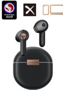
Image: A visual representation of the SoundPEATS T3 earbuds connecting to a mobile device via Bluetooth.