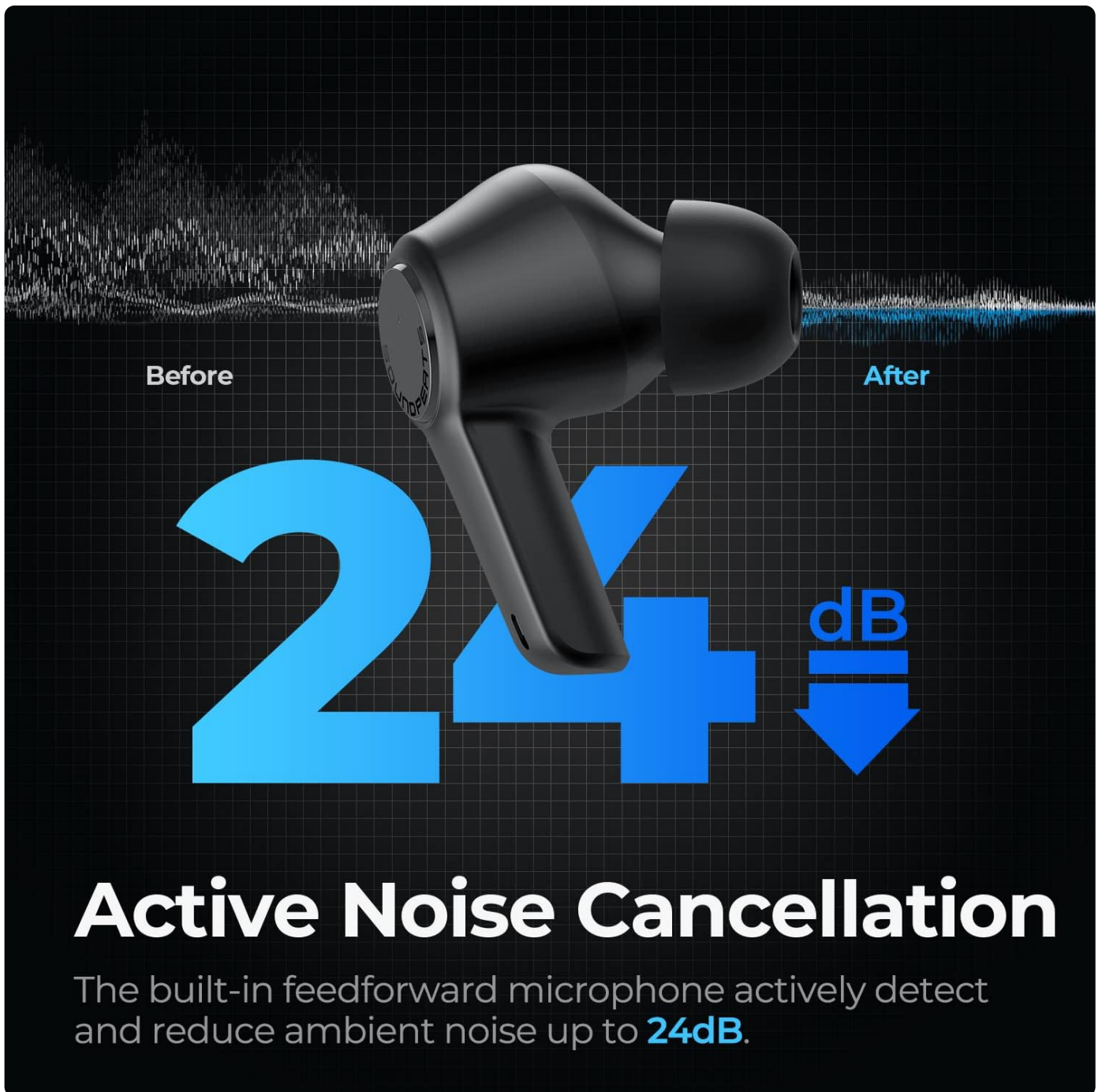
Image: A visual representation of how Active Noise Cancellation reduces ambient sound by up to 24dB.

Your browser does not support the video tag.