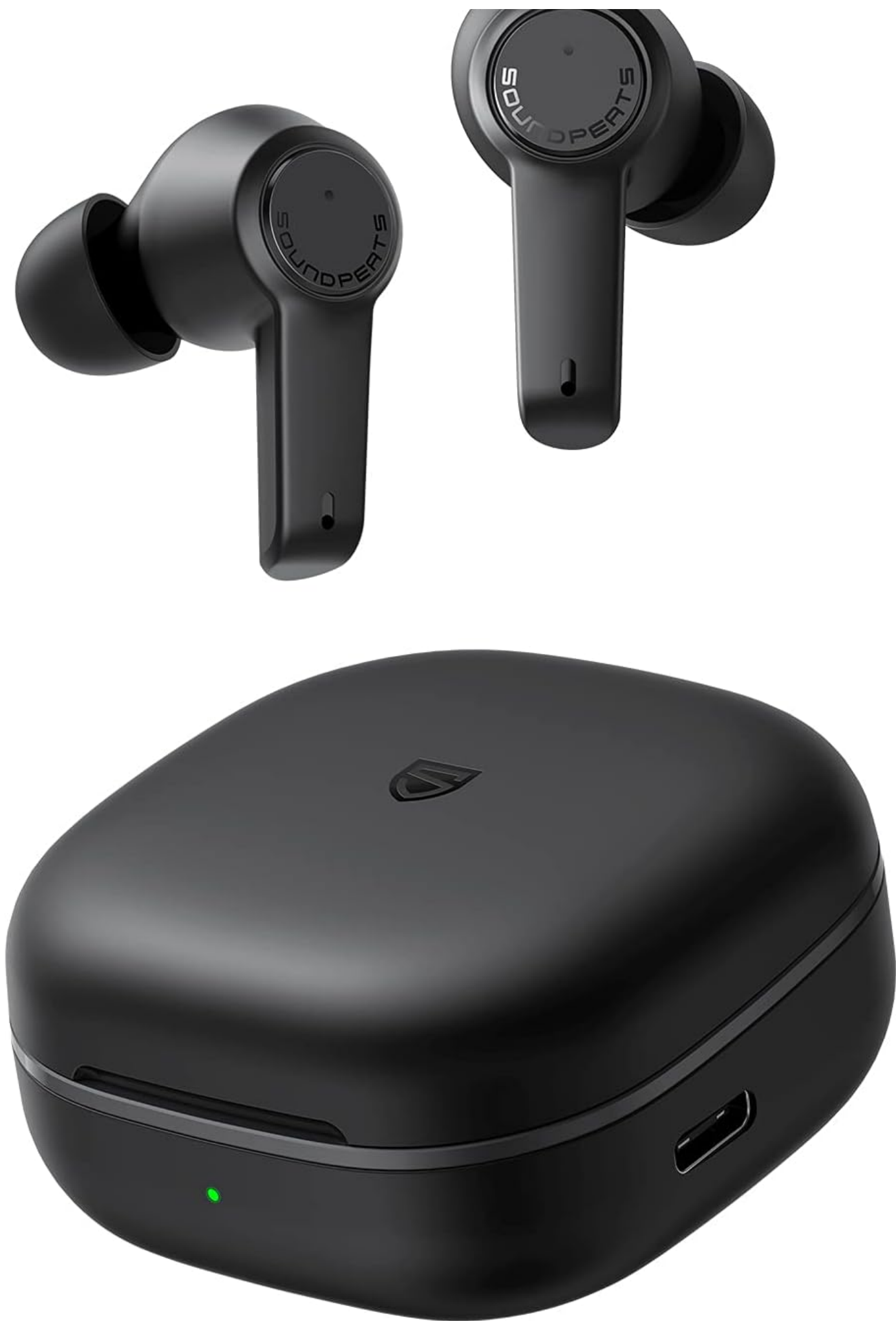
Image: The SoundPEATS T3 earbuds in their charging case, indicating charging status via an LED light.