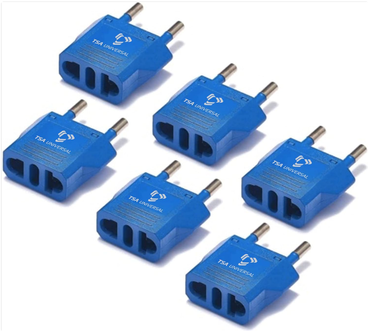
Image: A set of six blue TSA Universal travel power adapters, ready for use.