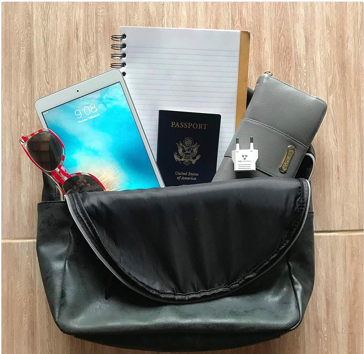
Image: The compact adapter fits easily into a travel bag alongside other essentials.