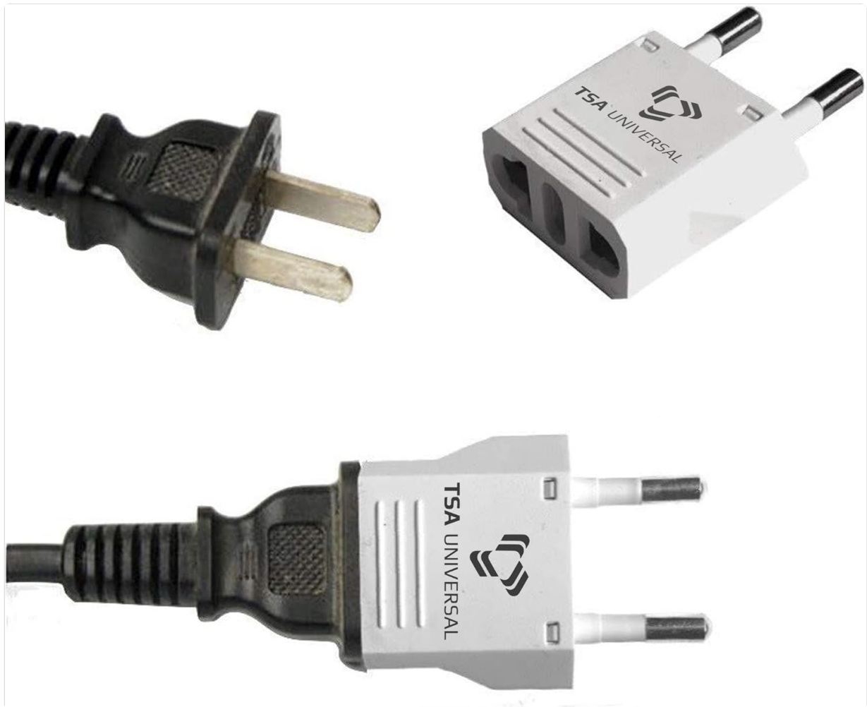
Image: A North American plug and the TSA Universal adapter, demonstrating the connection method.