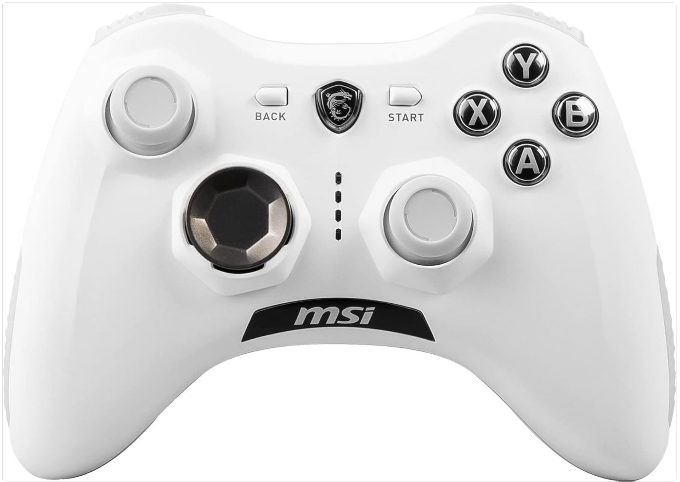
Figure 5: The MSI Force GC30 V2 controller showcasing an alternative D-pad, which can be easily interchanged due to its magnetic design.