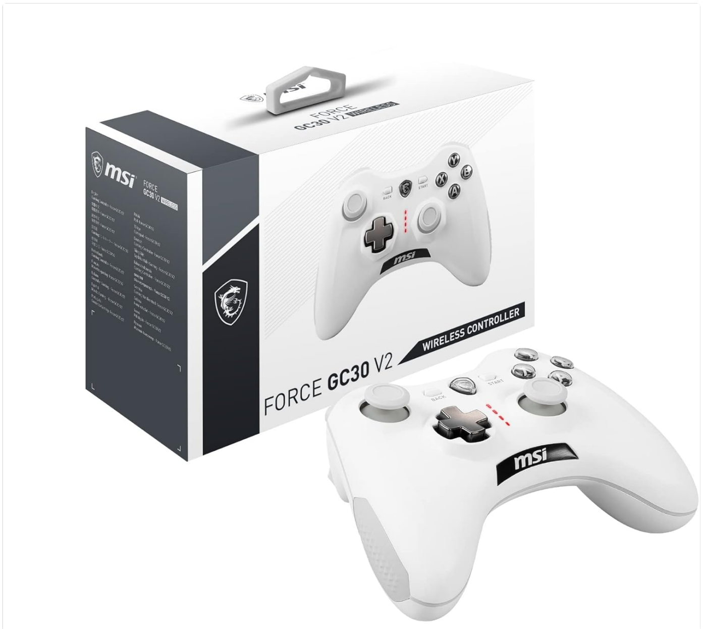
Figure 2: The MSI Force GC30 V2 controller displayed alongside its retail packaging, illustrating the product and its box.