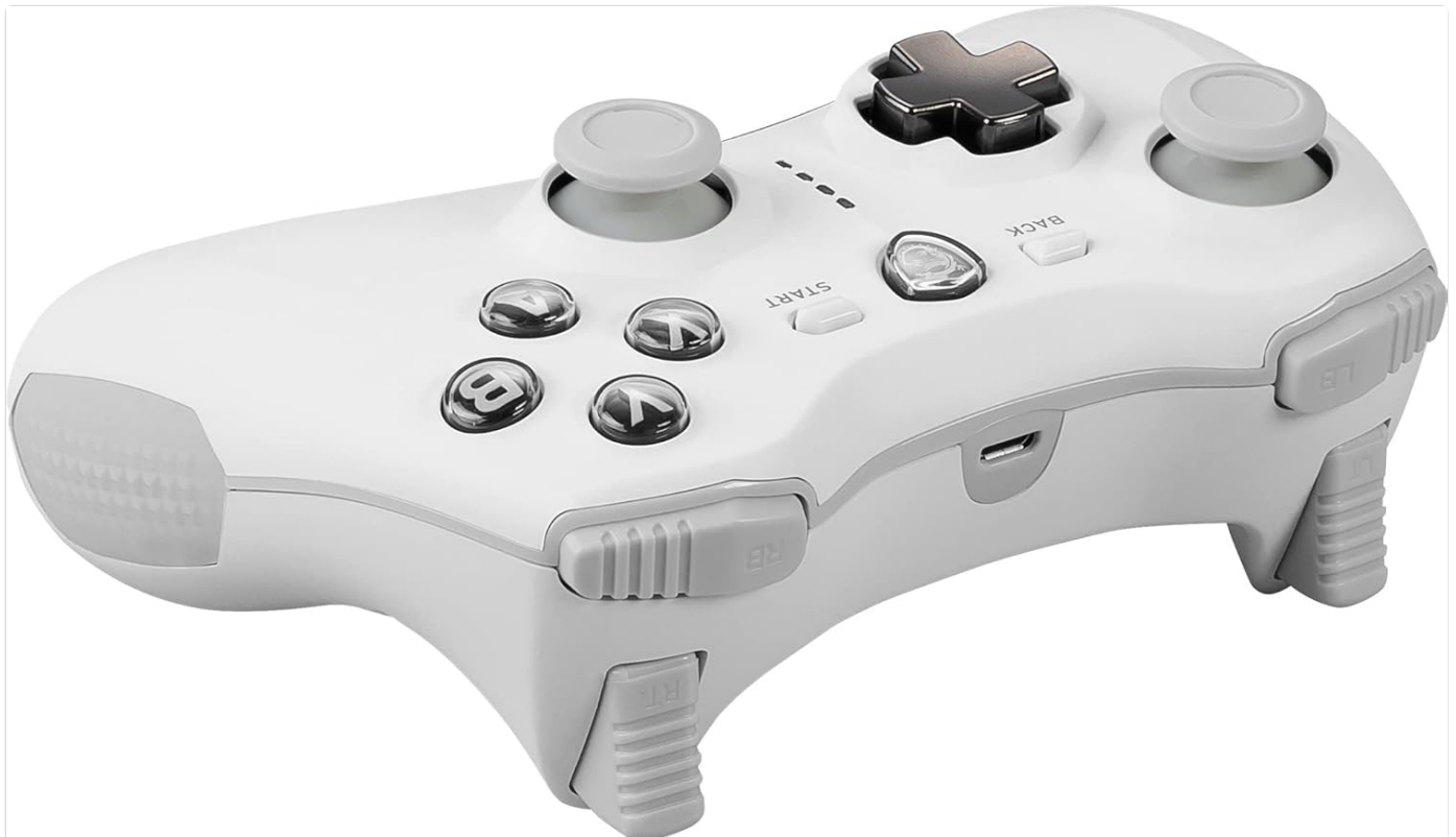
Figure 3: Bottom view of the MSI Force GC30 V2 controller, highlighting the micro-USB port for wired connection or charging.