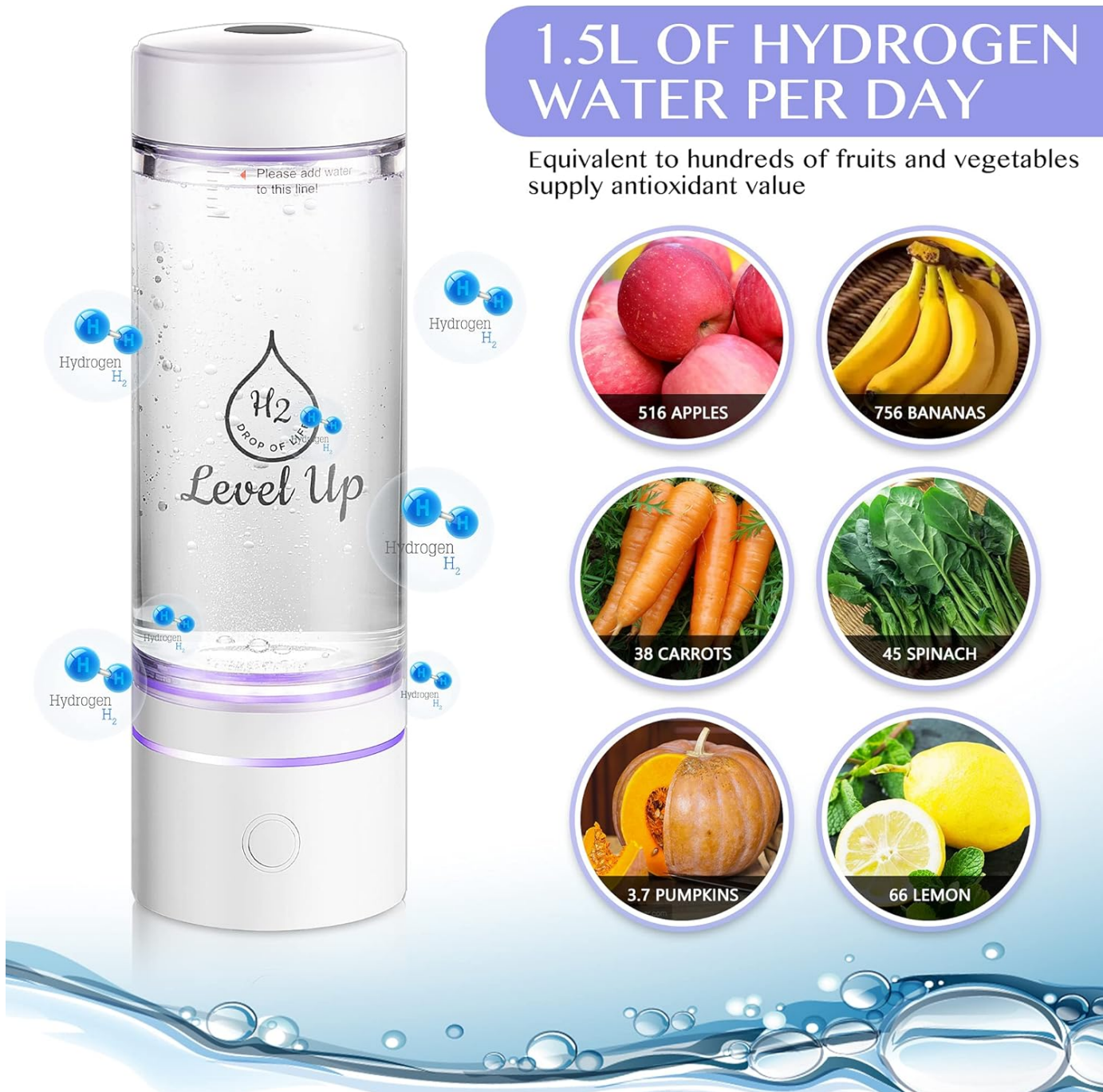
Figure 3: Ensure water is filled to the designated line for optimal performance.

Fill the bottle with potable water up to the indicated water line. Do not overfill, as this may affect the electrolysis process and potentially cause leaks.