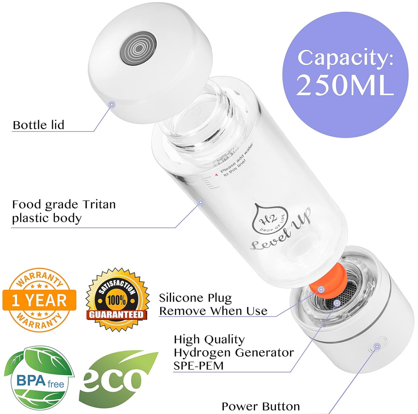
Figure 2: Exploded view of the hydrogen water bottle, showing the bottle lid, food-grade Tritan plastic body, silicone plug, high-quality hydrogen generator (SPE-PEM), and power button.