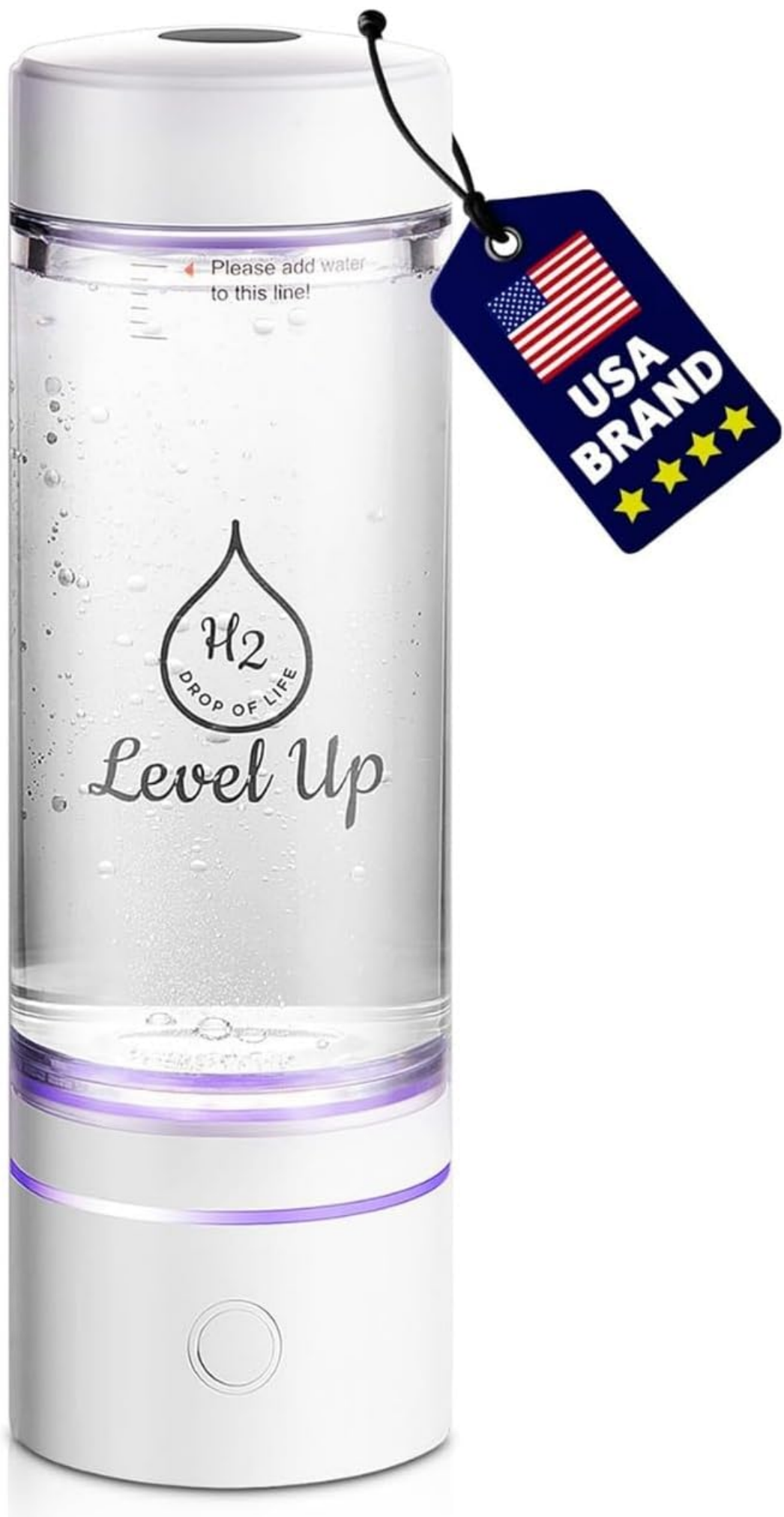
Figure 1: LevelUpWay 2025 Hydrogen Water Bottle Generator.