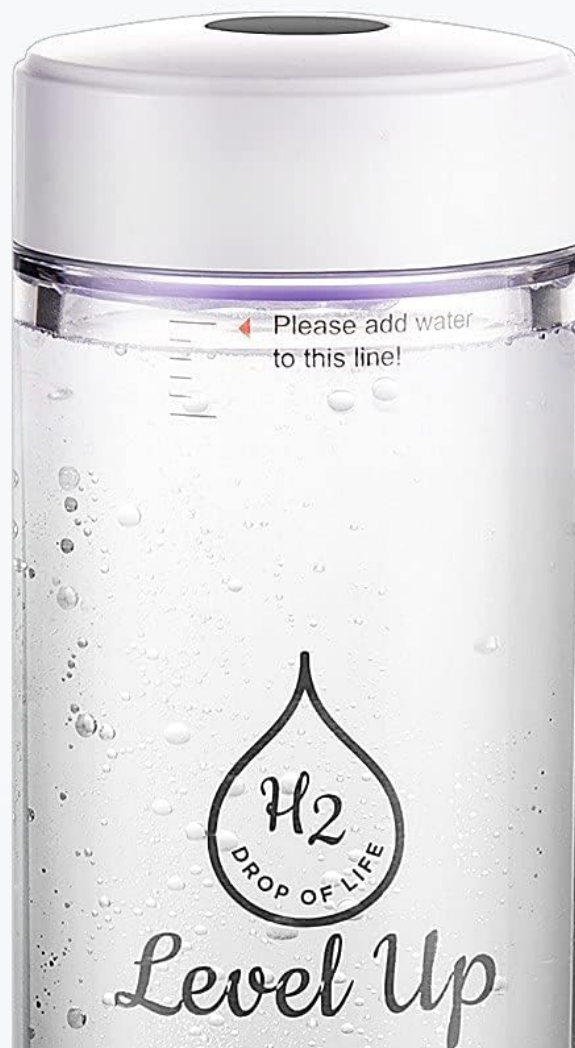
Figure 5: Detailed view of the high-quality 2-chamber, 7-layer system with platinum PEM technology, designed for efficient hydrogen generation.