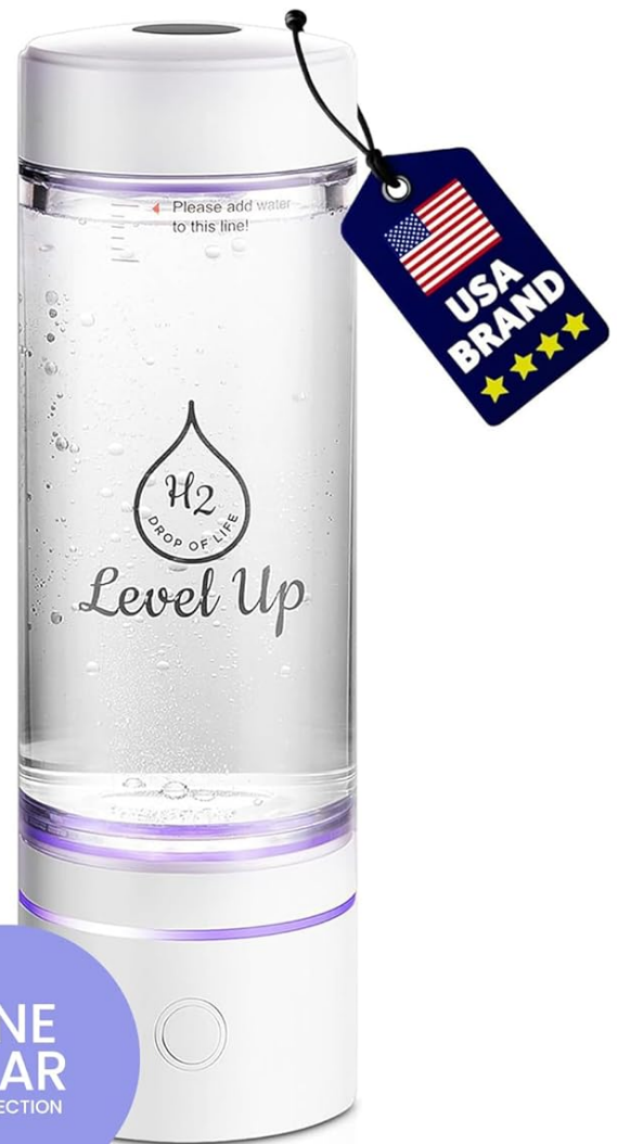
Figure 6: Level Up Way is a trusted American brand offering one year of product protection.

Your LevelUpWay Hydrogen Water Bottle Generator comes with a 1-year protection . For any inquiries, technical assistance, or to order spare parts, please contact our dedicated customer support team.