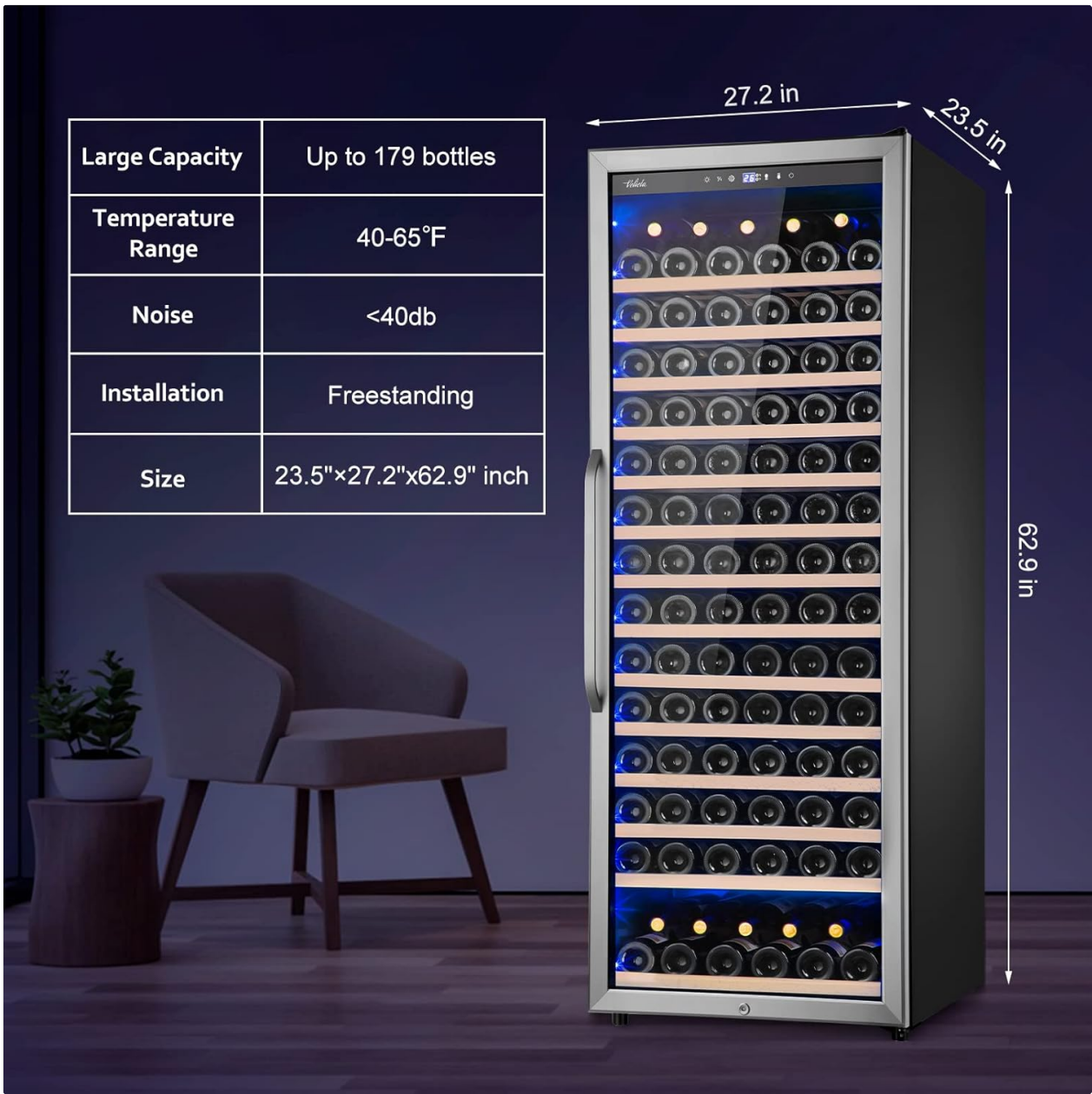
Figure 5: Overview of the wine cooler's dimensions and key specifications.