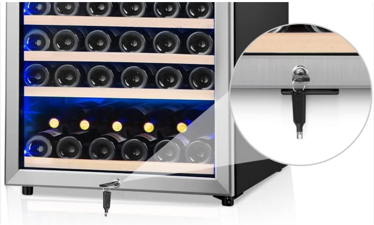
Figure 1: Front view of the Velieta wine cooler, showing the full unit, glass door, internal shelves with bottles, and the integrated key lock at the bottom.