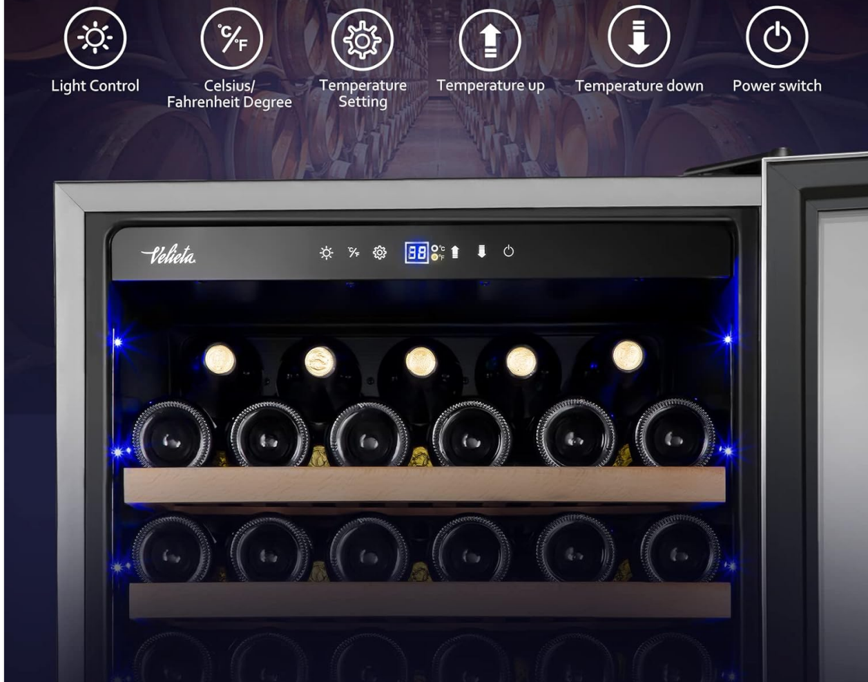
Figure 3: Close-up of the inductive touch control panel with LED display, showing icons for light control, Celsius/Fahrenheit, temperature setting, temperature up, temperature down, and power switch.