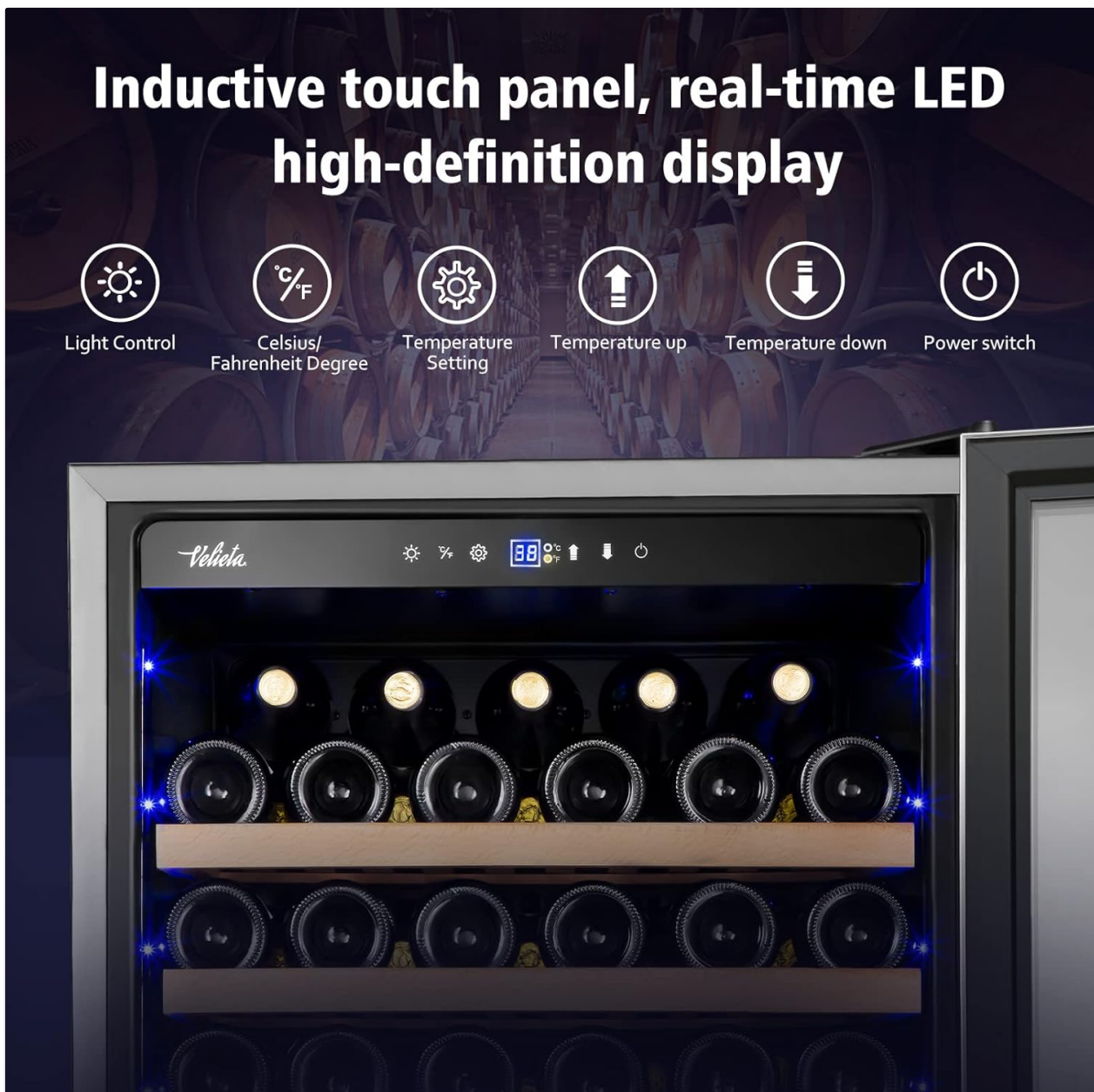
Figure 4: The control panel features touch-sensitive buttons for various functions.