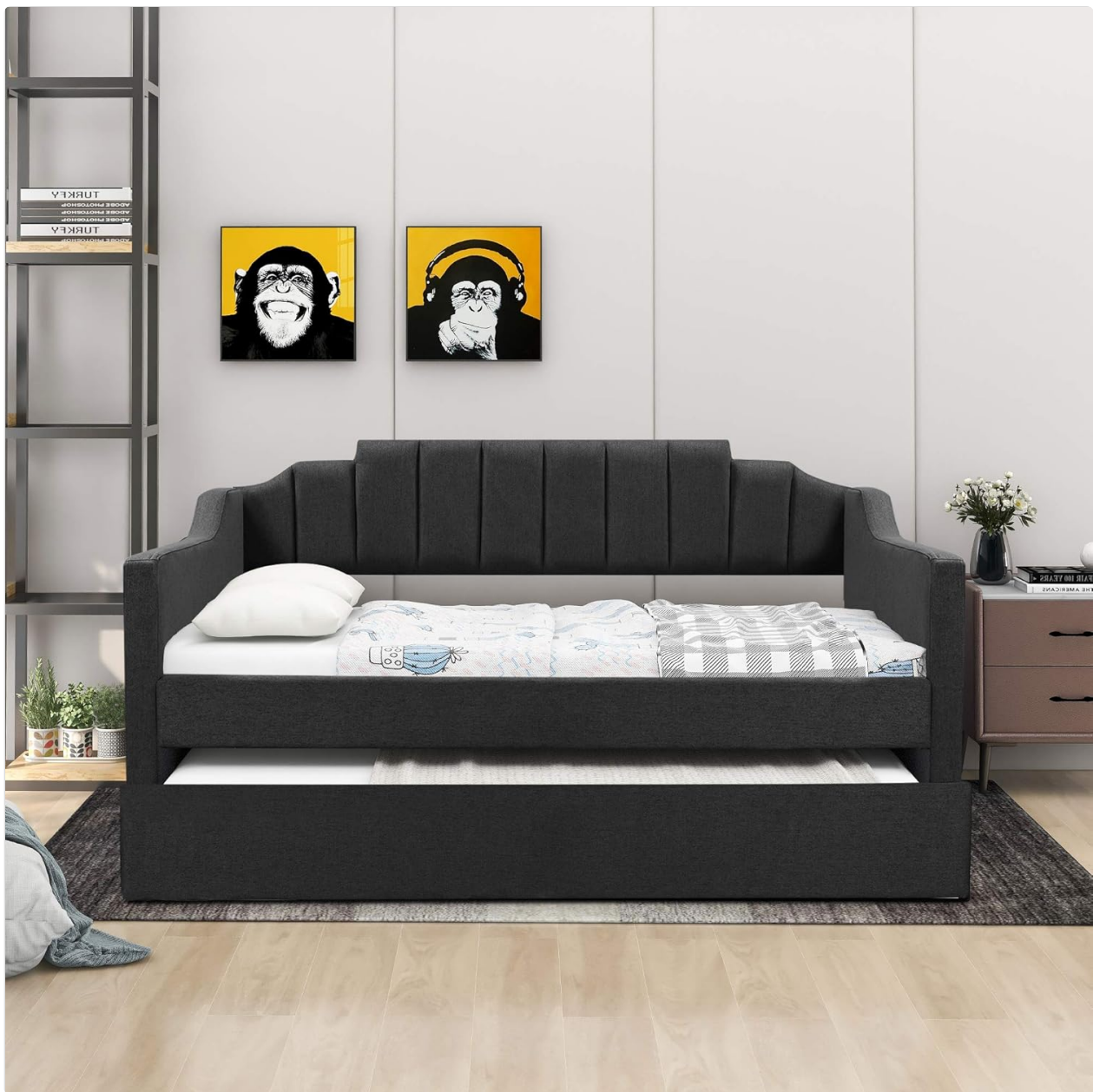
Image: The Merax Upholstered Twin Daybed with Trundle, shown in a living space with the trundle bed neatly tucked underneath.