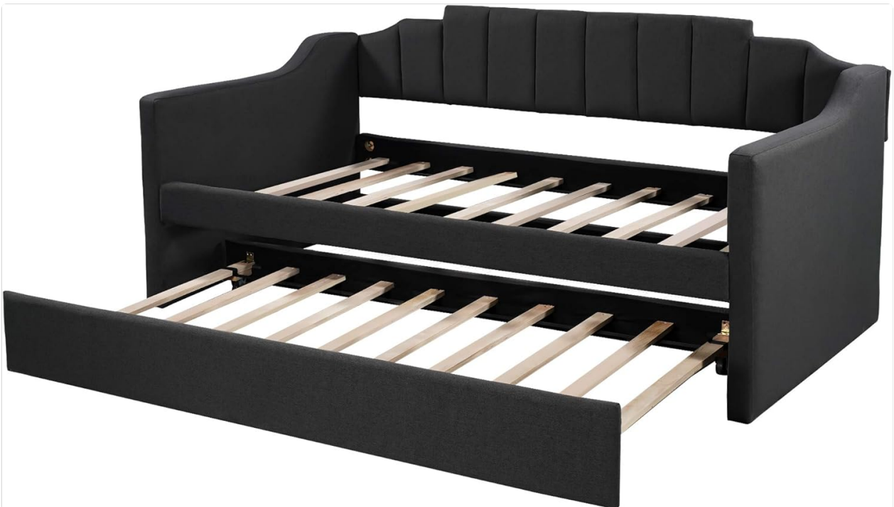
Image: An angled view of the daybed frame with the trundle unit extended, showing its internal structure and slats.