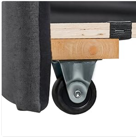
Image: A close-up view of one of the trundle bed's wheels, designed for smooth movement.