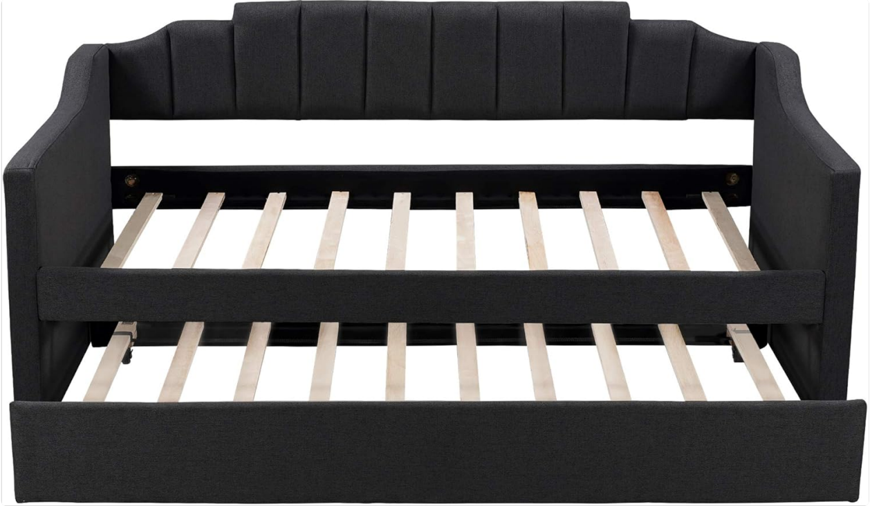
Image: A top-down view of the daybed frame, illustrating the wooden slat support system for the mattress.