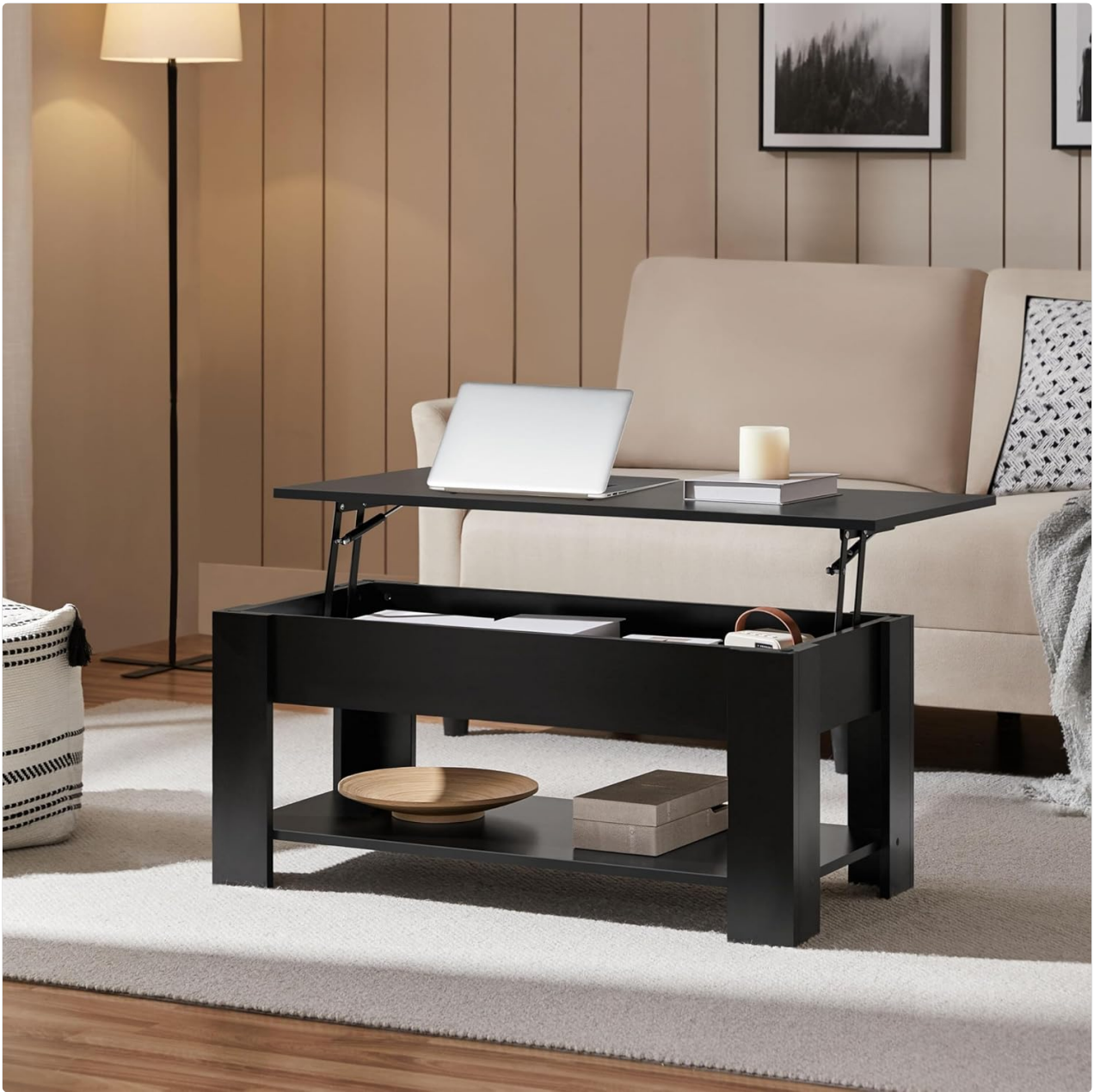
Figure 2.2: The fully assembled coffee table with its lift-top feature.