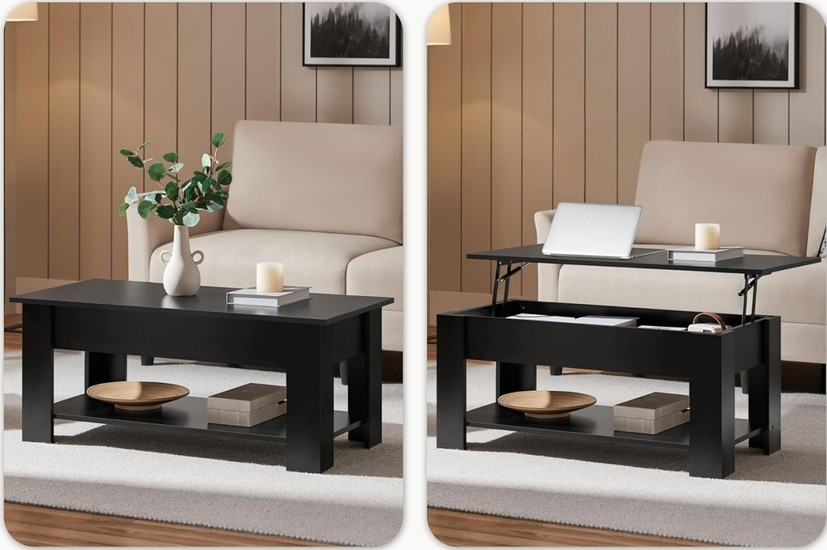
Figure 3.1: The versatile lift-top design, allowing for adjustable height for various uses.

Customize the tabletop to your desired height with ease