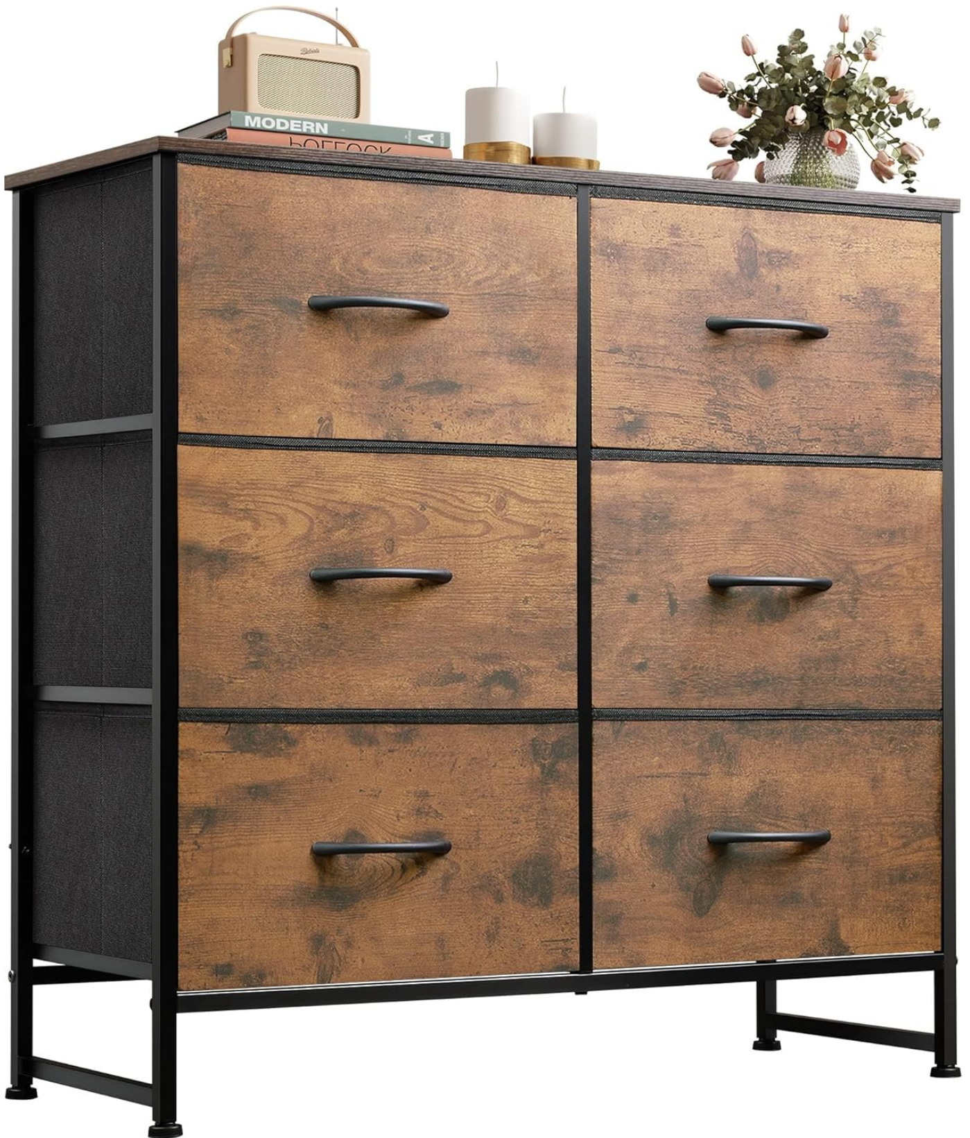
Image 1.1: The WLIVE 6-Drawer Fabric Dresser, showcasing its rustic brown wood grain print and six spacious drawers.