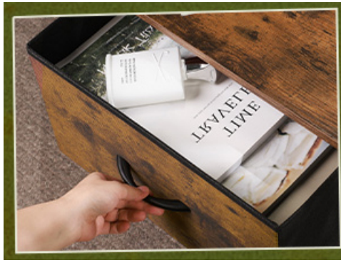
Image 4.3: Guide for inserting the fabric drawers into the dresser frame.