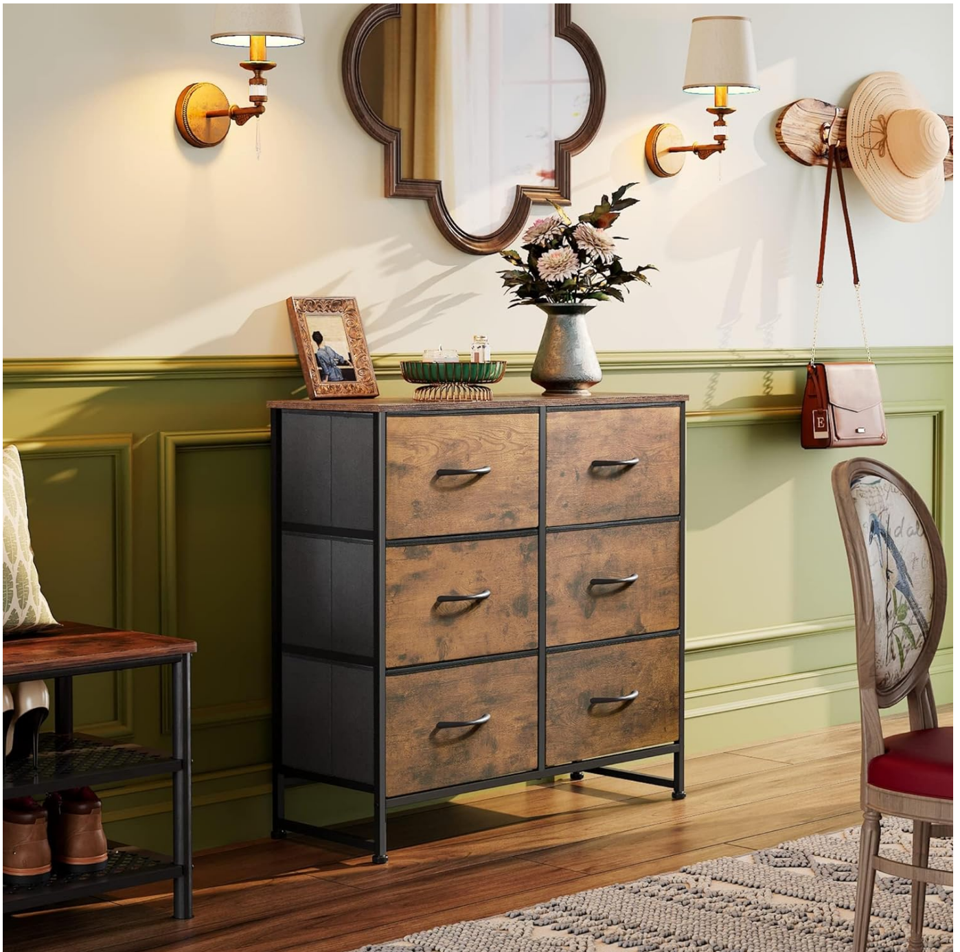
Image 5.2: The dresser in a typical home environment, demonstrating its functional use.