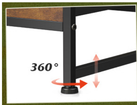
Image 4.4: Illustration of the adjustable feet and their function.

Screw the adjustable feet into the bottom of the dresser frame. These feet help protect your floor from scratches and allow you to level the dresser on uneven surfaces.