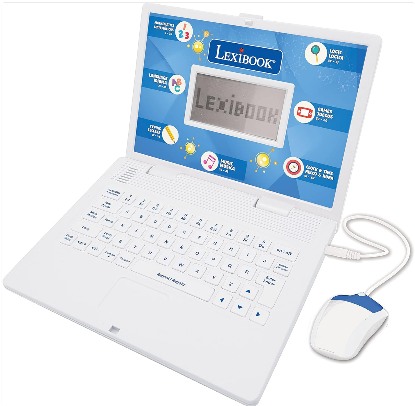
Figure 1: The Lexibook Educational and Bilingual Laptop, showcasing its open design, interactive screen, and connected mouse.