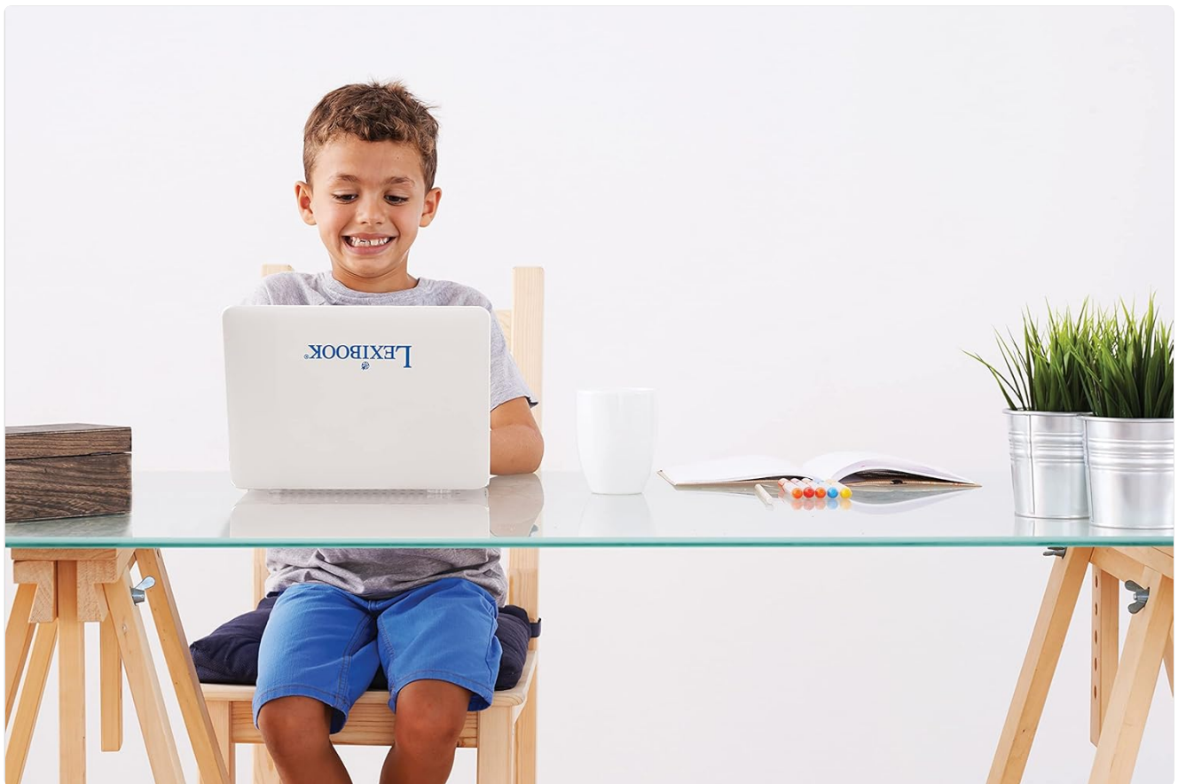
Figure 3: Child engaging with the Lexibook laptop, demonstrating its user-friendly design.

Interact with activities and games using the realistic keyboard for typing answers or navigating. The connected mouse can be used for selection and interaction in compatible activities.