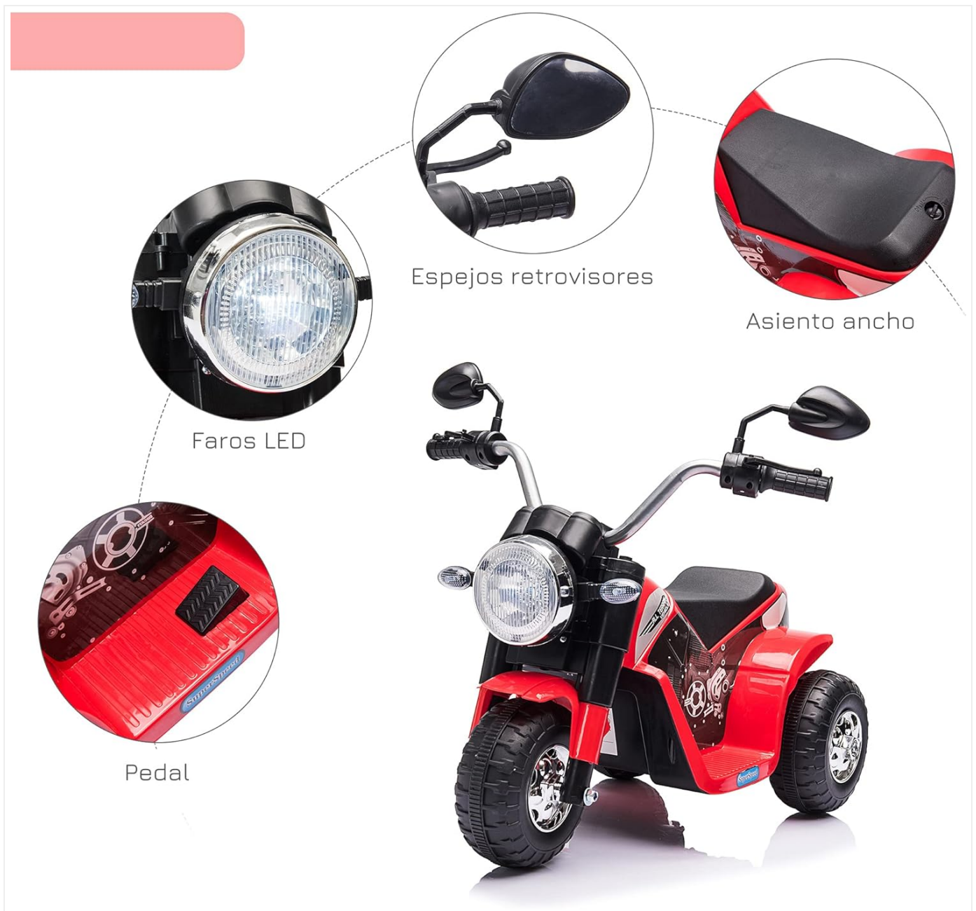
Figure 4: Detailed view of the LED headlights, rearview mirrors, wide seat, and foot pedal for operation.