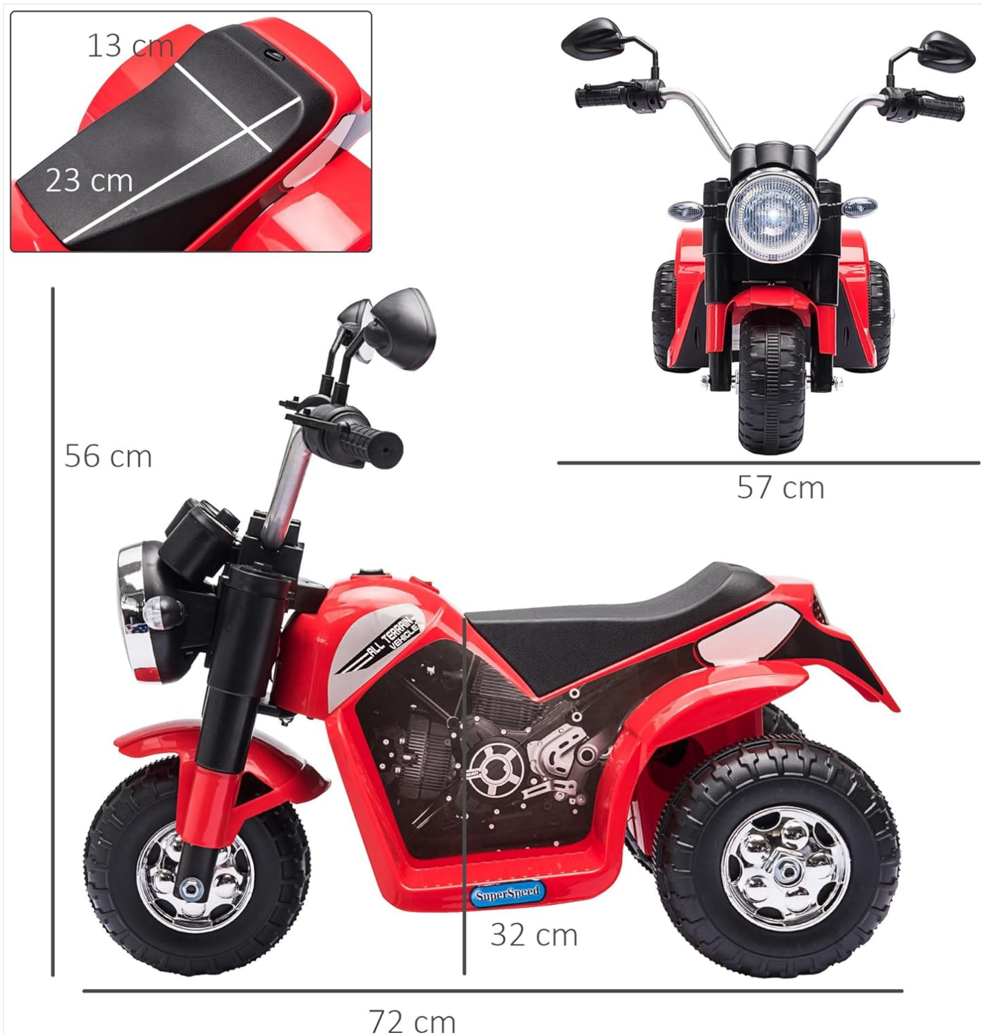
Figure 5: Detailed dimensions of the electric motorcycle.