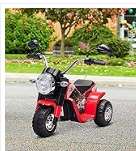
Figure 6: The red 3-wheel electric motorcycle, highlighting its design and features.