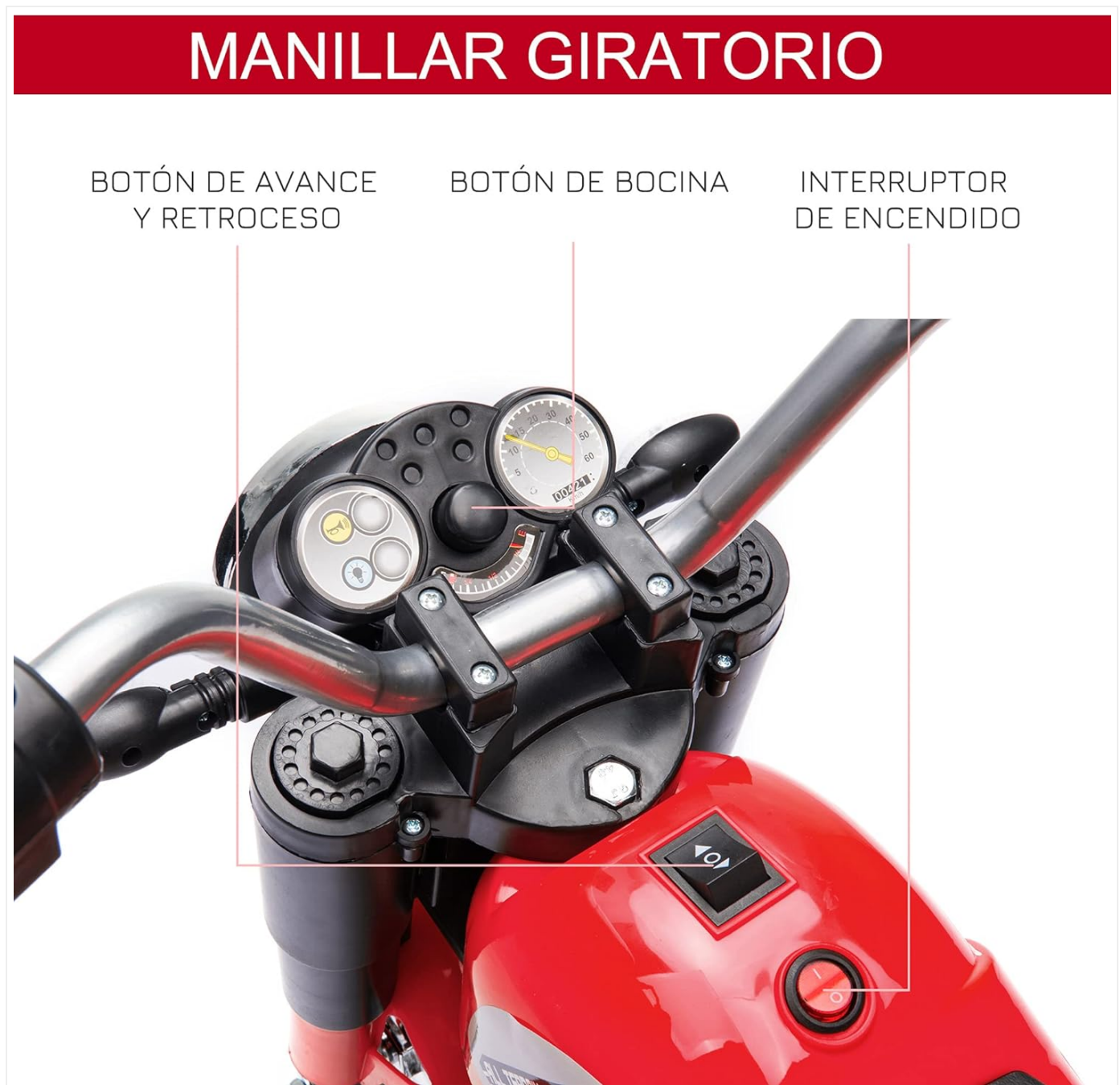
Figure 3: Close-up of the handlebar showing the forward/reverse button, horn button, and power switch.