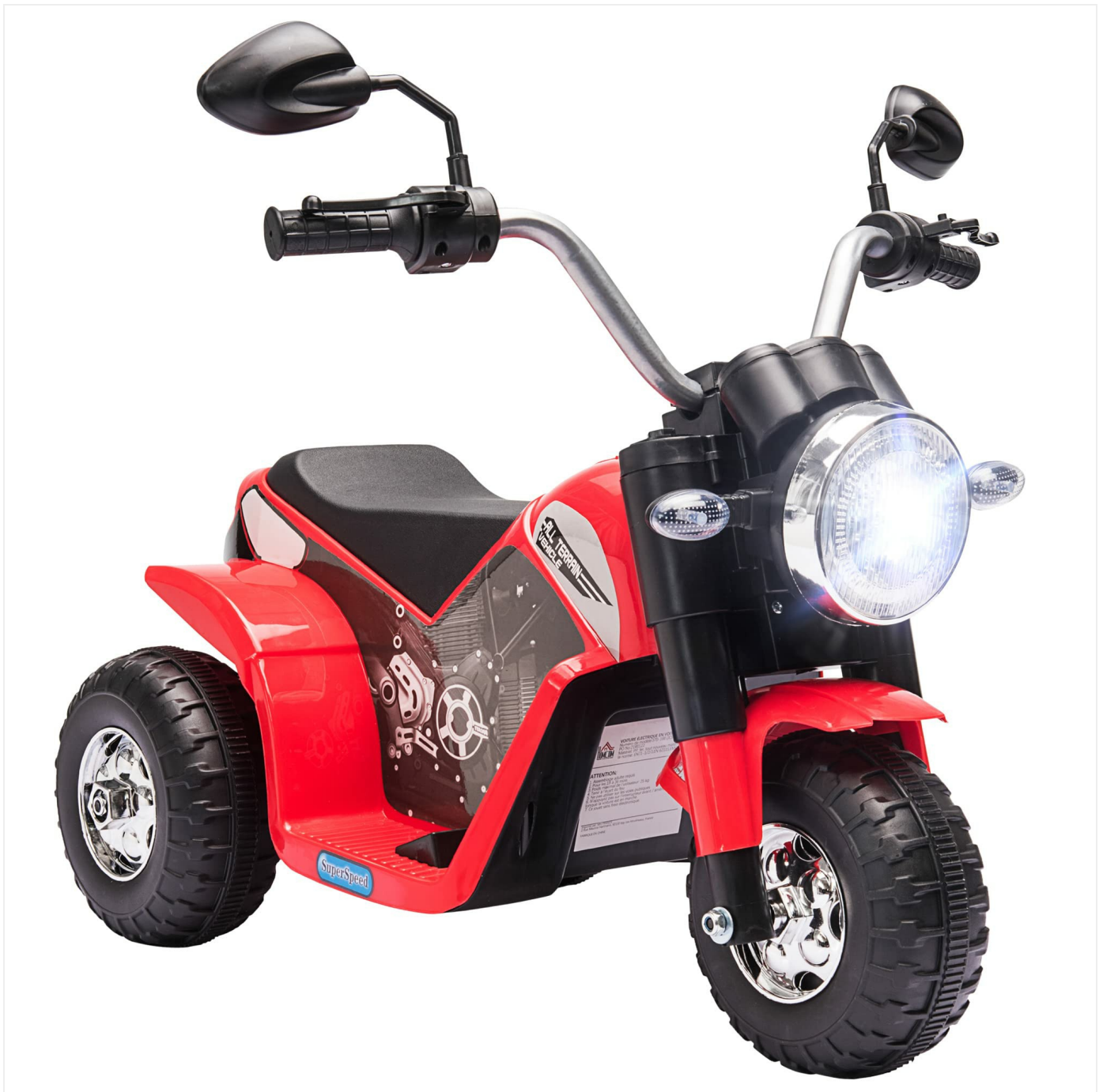
Figure 1: Front view of the HOMCOM 3-Wheel Electric Motorcycle.