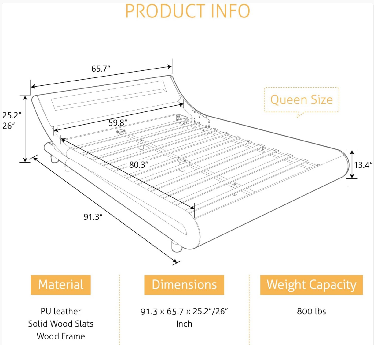
Figure 1: Product Dimensions and Material Information. Material: PU leather, Solid wood slats, Wood Frame. Dimensions: 91.3"L x 65.7"W x 25.2"H. Weight Capacity: 800 lbs.

The bed frame features a sunken design that securely holds the mattress in place, preventing movement. Its low-profile sleigh design and round edges enhance safety, particularly for households with children.