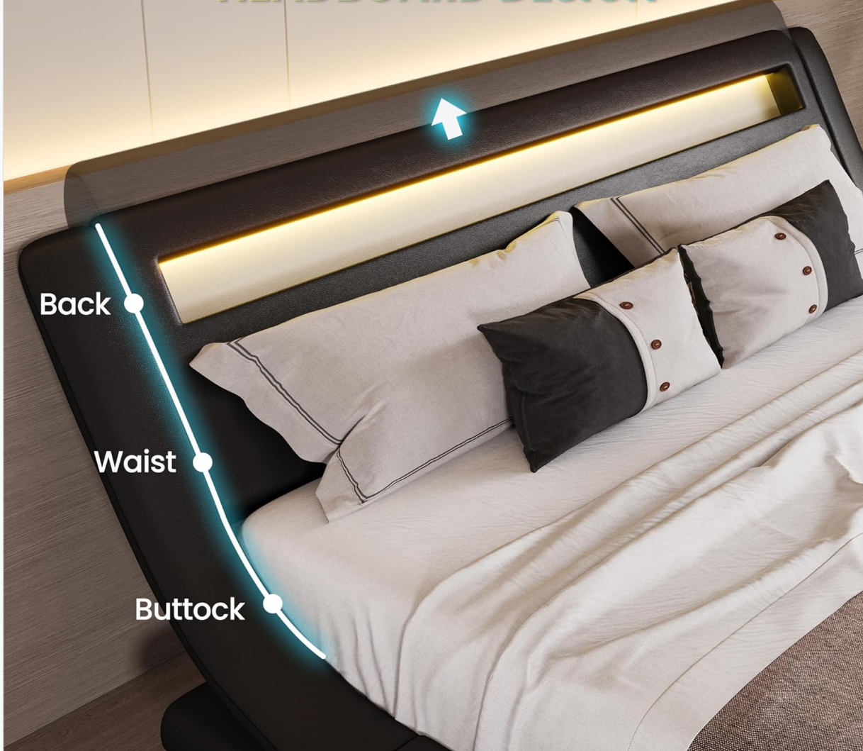
Figure 4: 120° Ergonomic & Adjustable Headboard Design. The headboard can be adjusted to provide comfortable support for various activities.