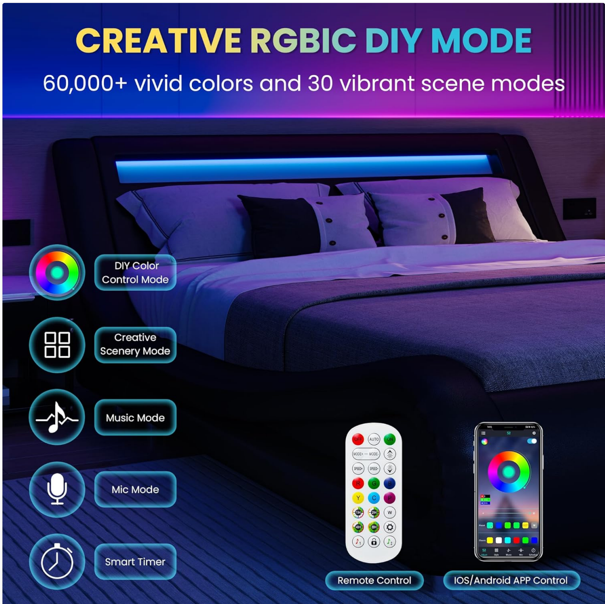
Figure 3: Creative RGBIC DIY Mode. Control LED colors, brightness, and patterns via remote or app, including music sync and smart timer functions.