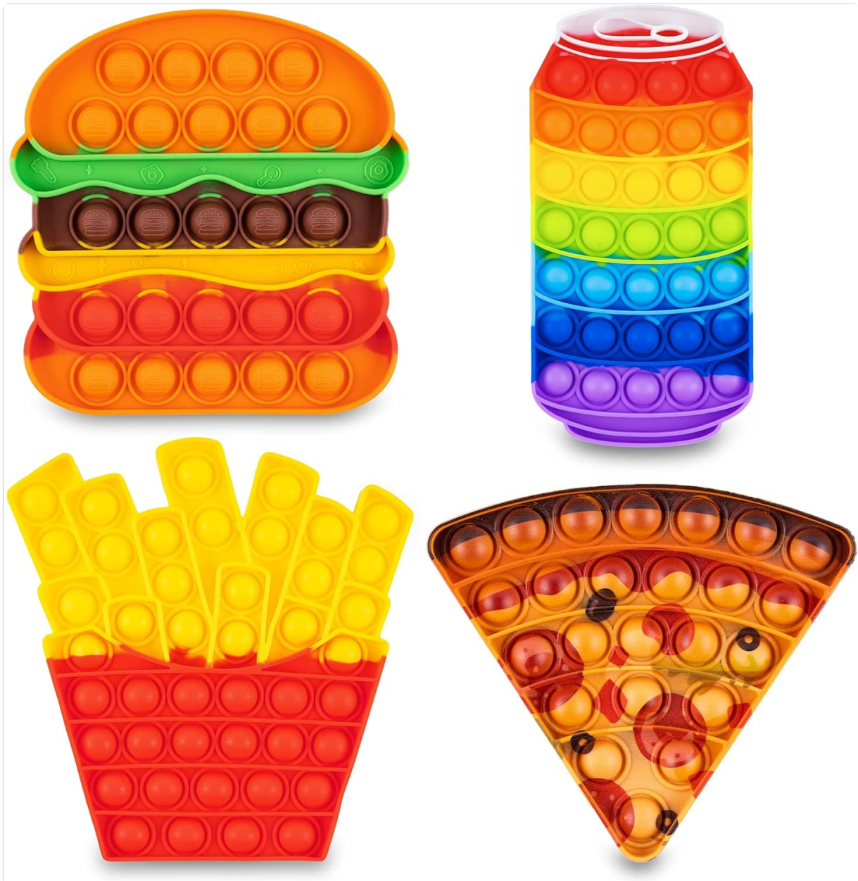
Image: The Ronton Pop Its Fidget Toys Pack 4, featuring a hamburger, a rainbow-colored soda can, french fries, and a pizza slice. Each toy has multiple bubbles designed for pressing.