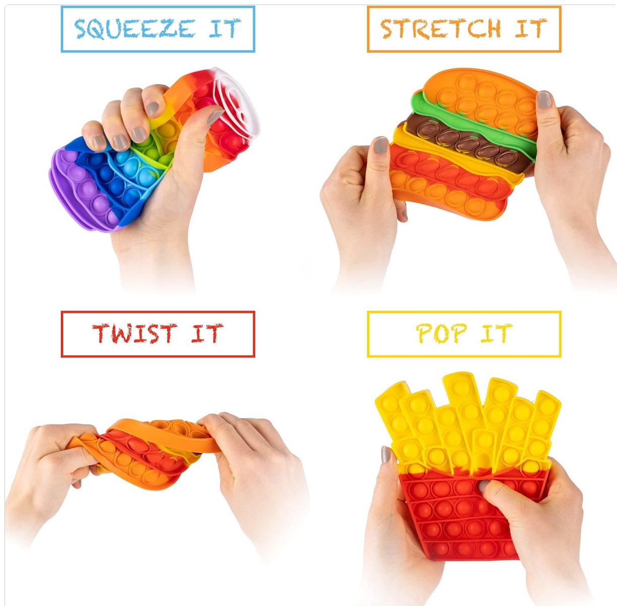
Image: A visual guide showing various interactions with the Pop It toys, including squeezing the soda can, stretching the hamburger, twisting the hamburger, and pressing the bubbles on the french fries.