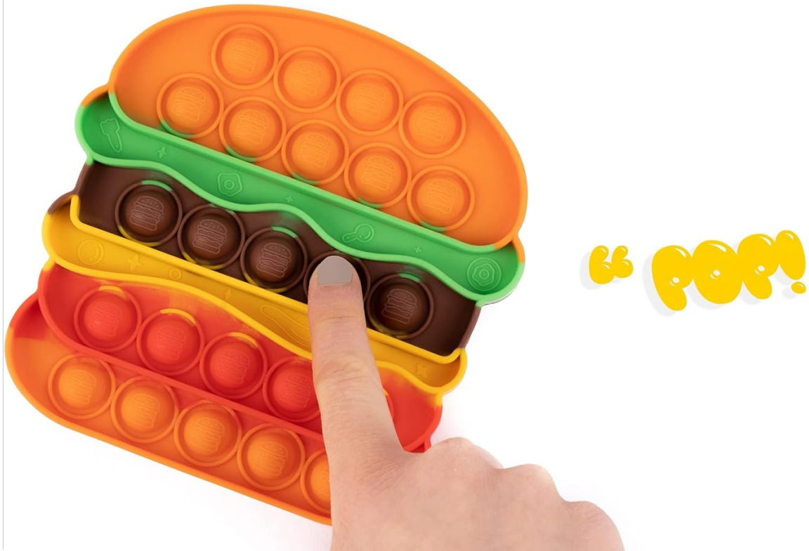
Image: A hand demonstrating the pressing action on a hamburger Pop It toy. Text highlights benefits such as relieving stress, anti-anxiety, stabilizing mood, passing time, and bringing happiness.