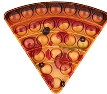
Image: A diagram explaining a game played with Pop It toys. It shows players taking turns pressing bubbles in a single row, pressing 1 or more connected pieces, and the player who presses the last bubble losing.

3 THE ONE WHO PRESSES THE LAST BUBBLE LOSES THE ROUND!