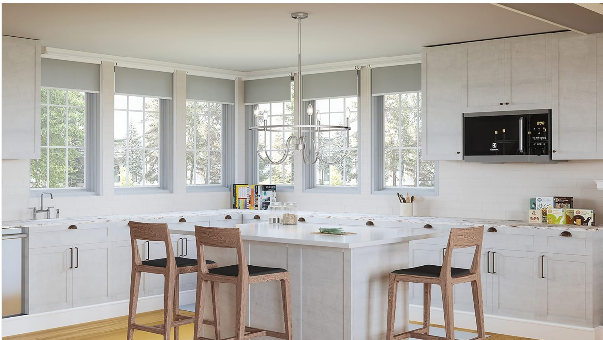
Image 4.2: Front view of the assembled chandelier, illustrating the five light sockets and brushed nickel finish.