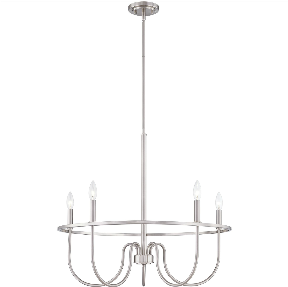
Image 1.1: The Lianna Chandelier in a kitchen setting, showcasing its design and brushed nickel finish.