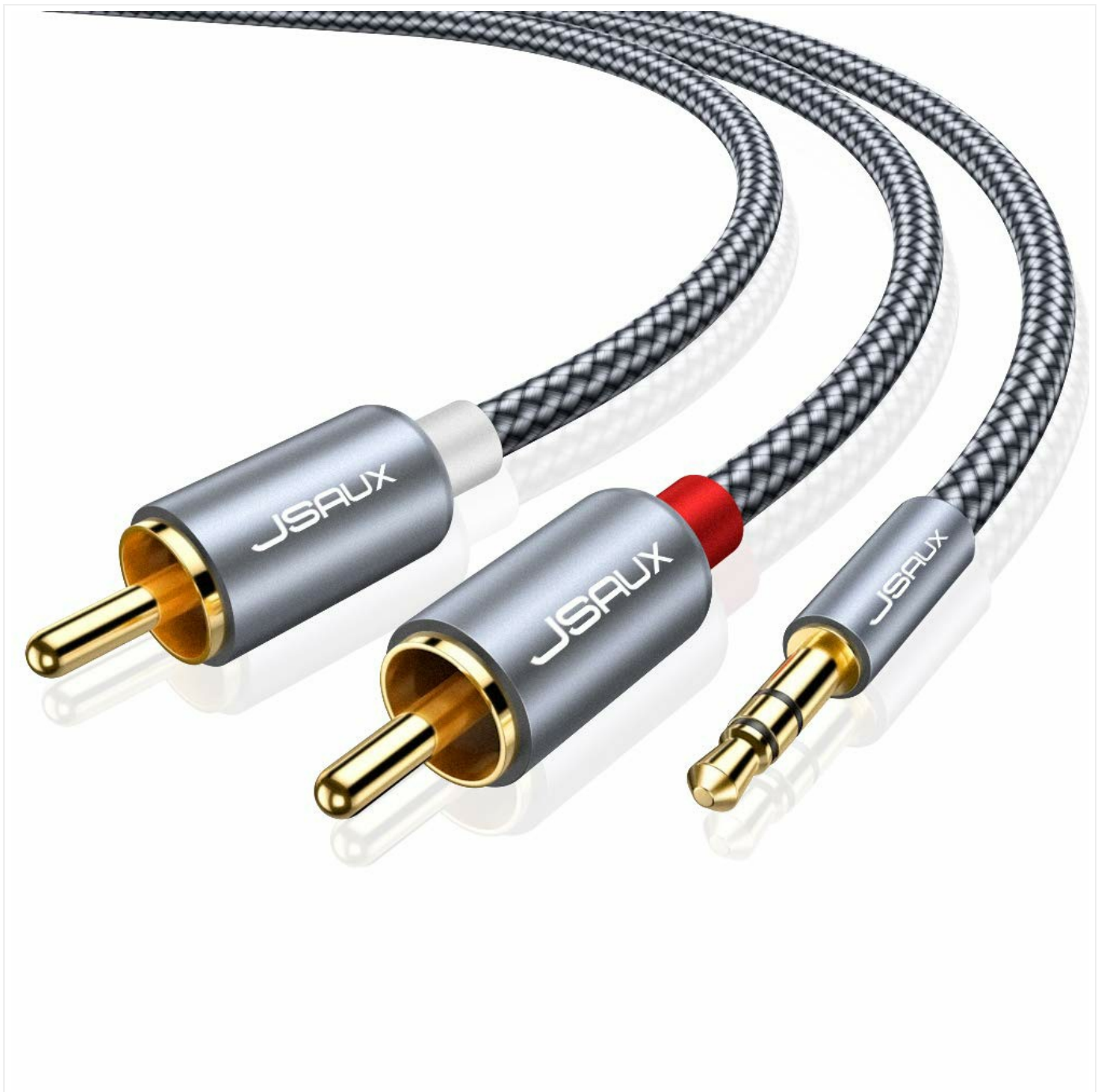
Image: The JSAUX 25ft/7.5M Aux to RCA Audio Cable, featuring a braided grey cable with gold-plated 3.5mm and RCA connectors.