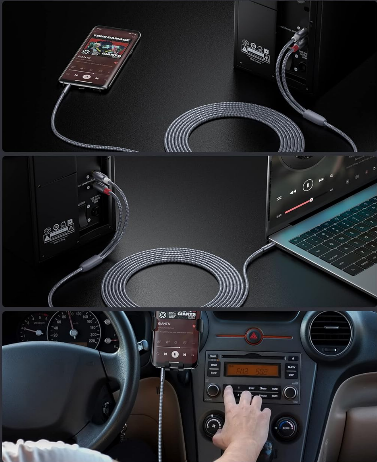
Image: A close-up view demonstrating the connection of the 3.5mm jack to a smartphone and the RCA connectors to a speaker system, illustrating the cable's application.