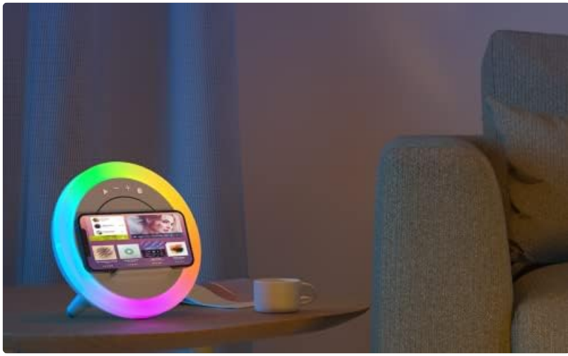
Image: Side profile of the Swarmir speaker, highlighting its compact design.