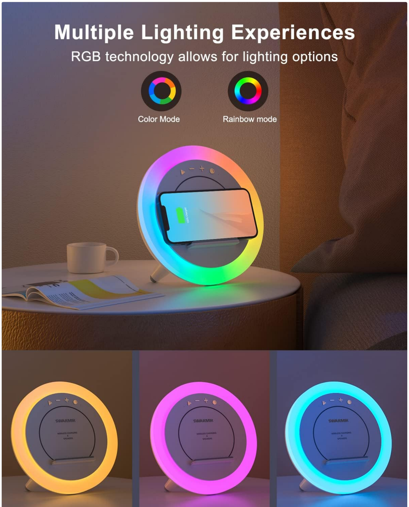
Image: The Swarmir speaker showcasing different lighting experiences, including solid colors and a rainbow mode.

The speaker features multiple lighting modes. Press the light button (circular icon) on the top panel to cycle through 7 solid colors and 2 dynamic color modes. The lights can also sync with music for an enhanced visual experience.