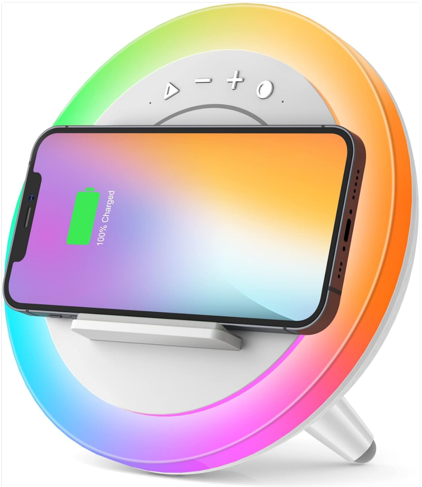
Image: Front view of the Swarmir Bluetooth Speaker with a smartphone placed on its wireless charging pad, surrounded by colorful LED lights.